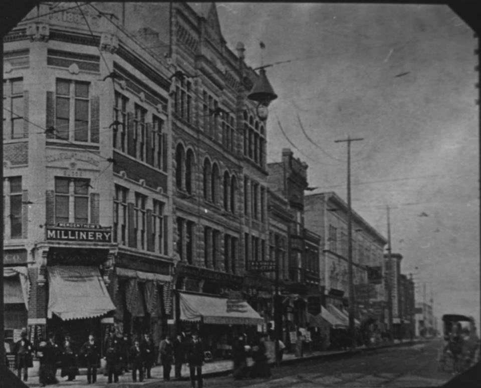
CALHOUN STREET, NORTH FROM WEST MAIN STREET.