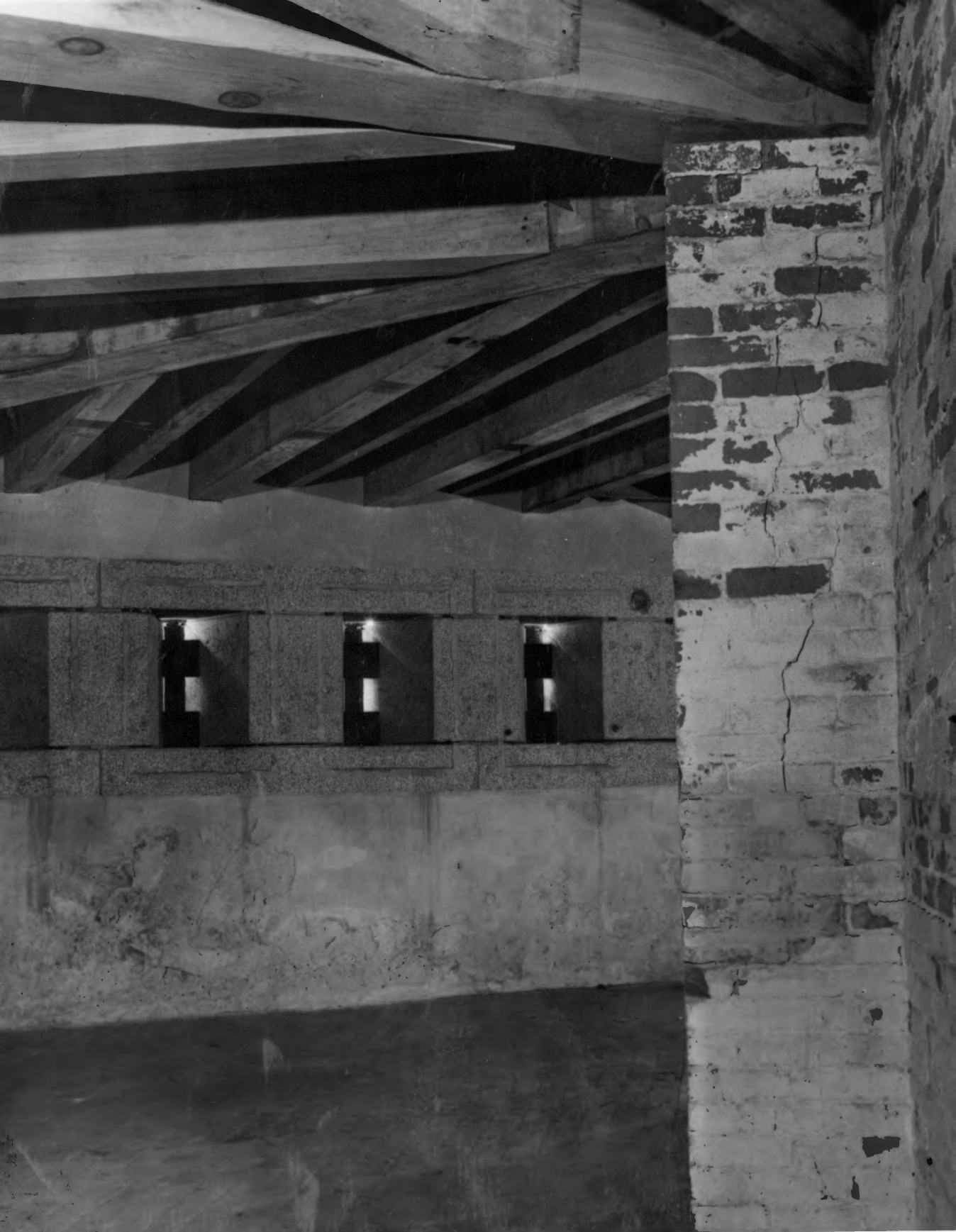
#1 Upper Floor FT. McClary Blockhouse