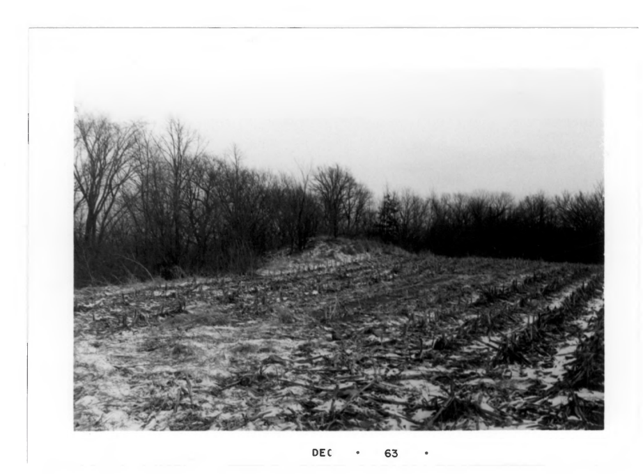
Figure 9 — Mound No. 5, looking SE. This mound in very poor condition also. It has been excavated. Negative #983.