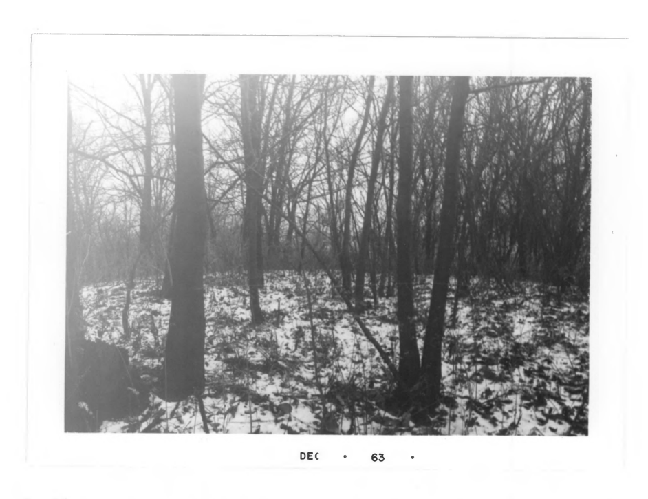
Figure 3 - Top of mound No. 1. Slight depression in top. Negative #977