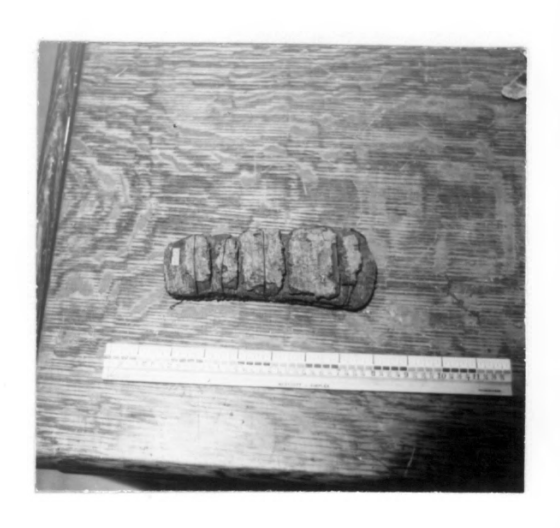
Figure 12 -- Copper ax from Mound 7 (Davenport number), Toolesboro. Davenport Public Museum specimen. Bark preserved by contact with ax, opposite side has good cloth impression. Negative #986.