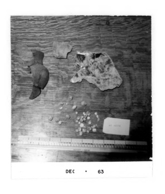
Figure 14 -- Potsherds, mica and pearl beads from Toolesboro Mounds. Davenport Public Museum specimens. Negative #988.