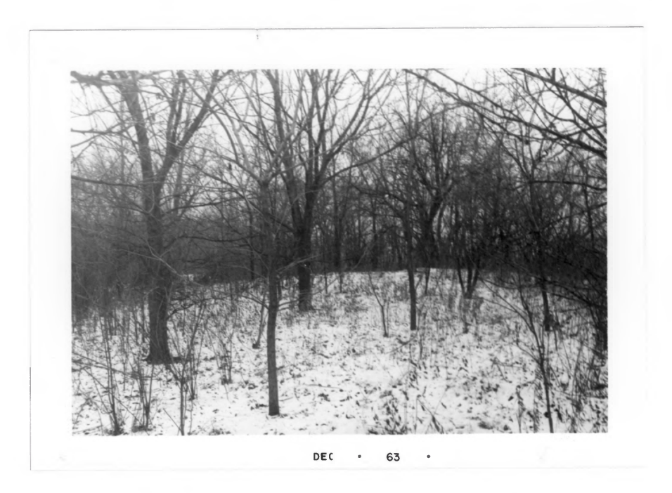
Figure 8 -- Mound No. 4, greatly reduced in height. Was excavated probably in 1870's or 1880's by Davenport group. Negative #982.