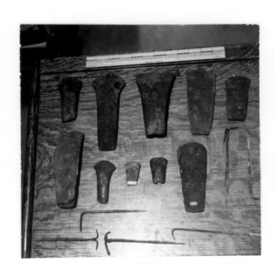
Figure 13 -- Copper axes and awls from Toolesboro Mounds. In collections of Davenport Public Museum. Negative #987.