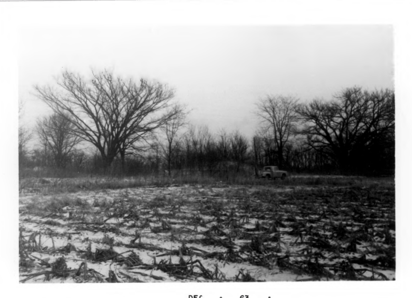
Figure 4 -- Mound No. 2 at left of pickup, looking east. Negative #978.