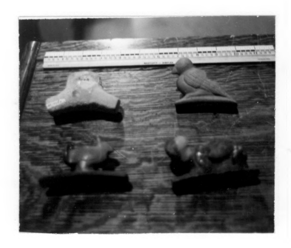
Figure 11 -- Pipes in collections of Davenport Public Museum. Excavated from Toolesboro Mounds in 1875. Negative #985.