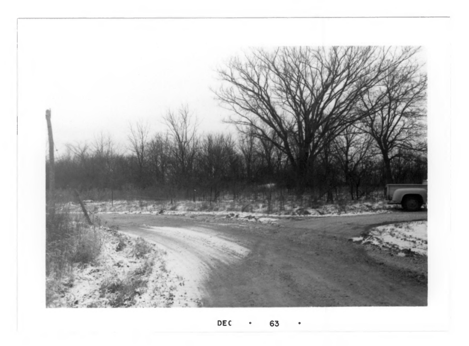
Figure 6 -- Mound No. 3, visible as white spot in center. This mound greatly disturbed. Looking north. Negative #980.