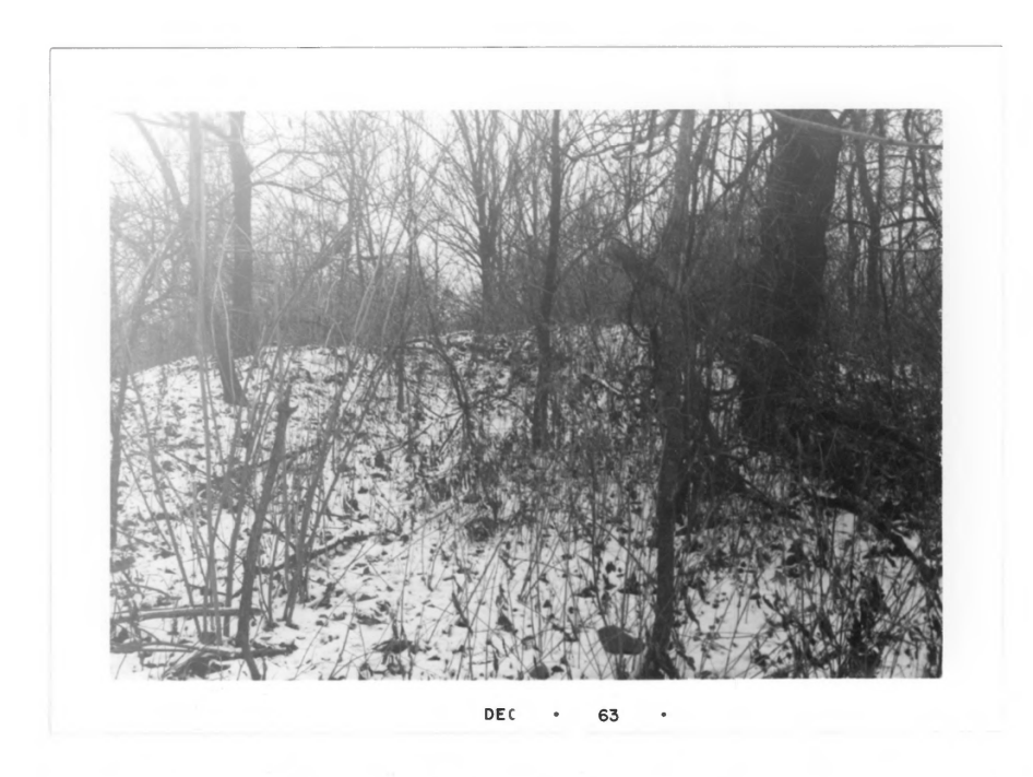
Figure 7 - Mound No. 3, looking north, remains of old pit garage in south side. There is an old cistern dug into opposite side. Negative #981.