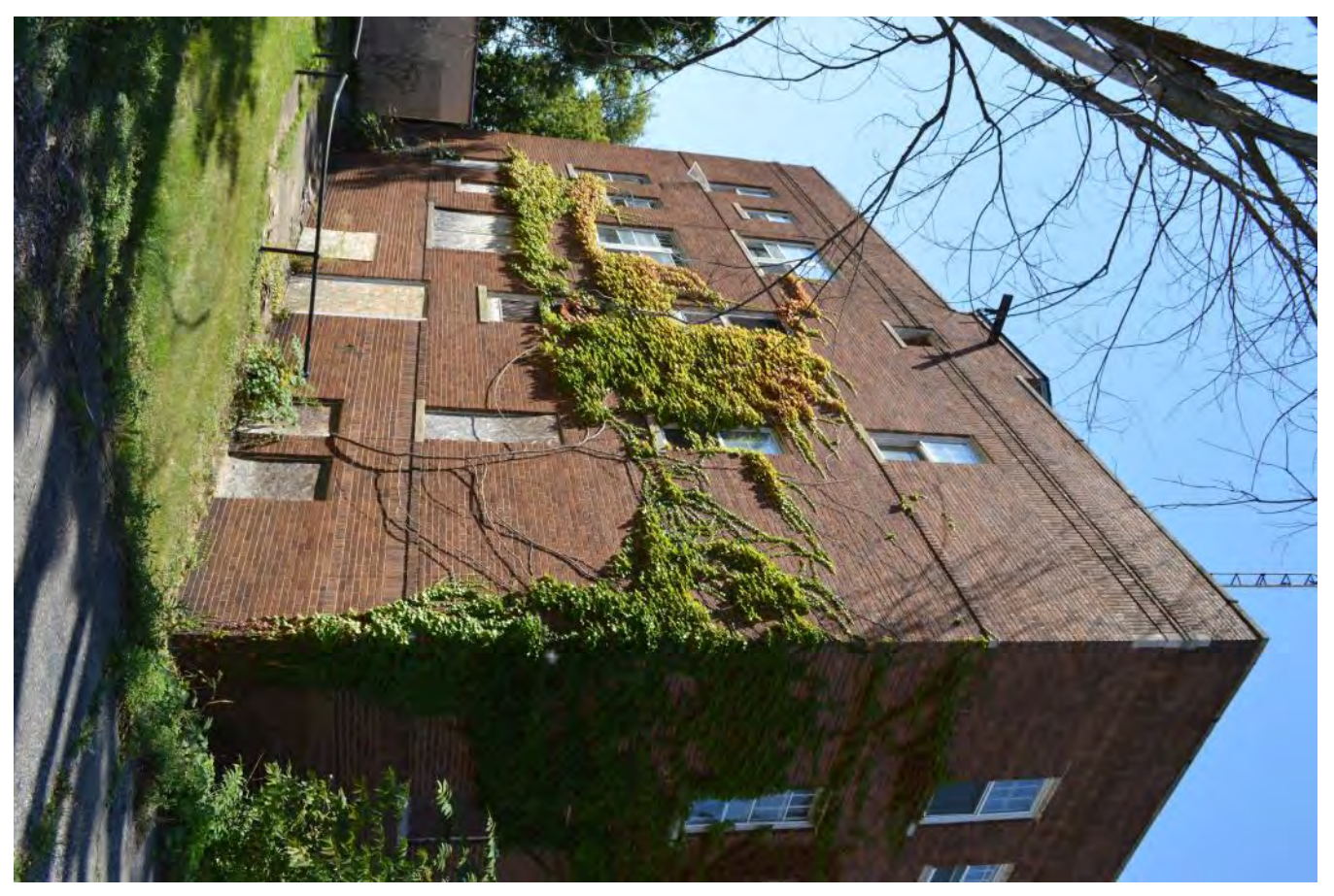
MI_Genesee County_Swayze Apartments_0003