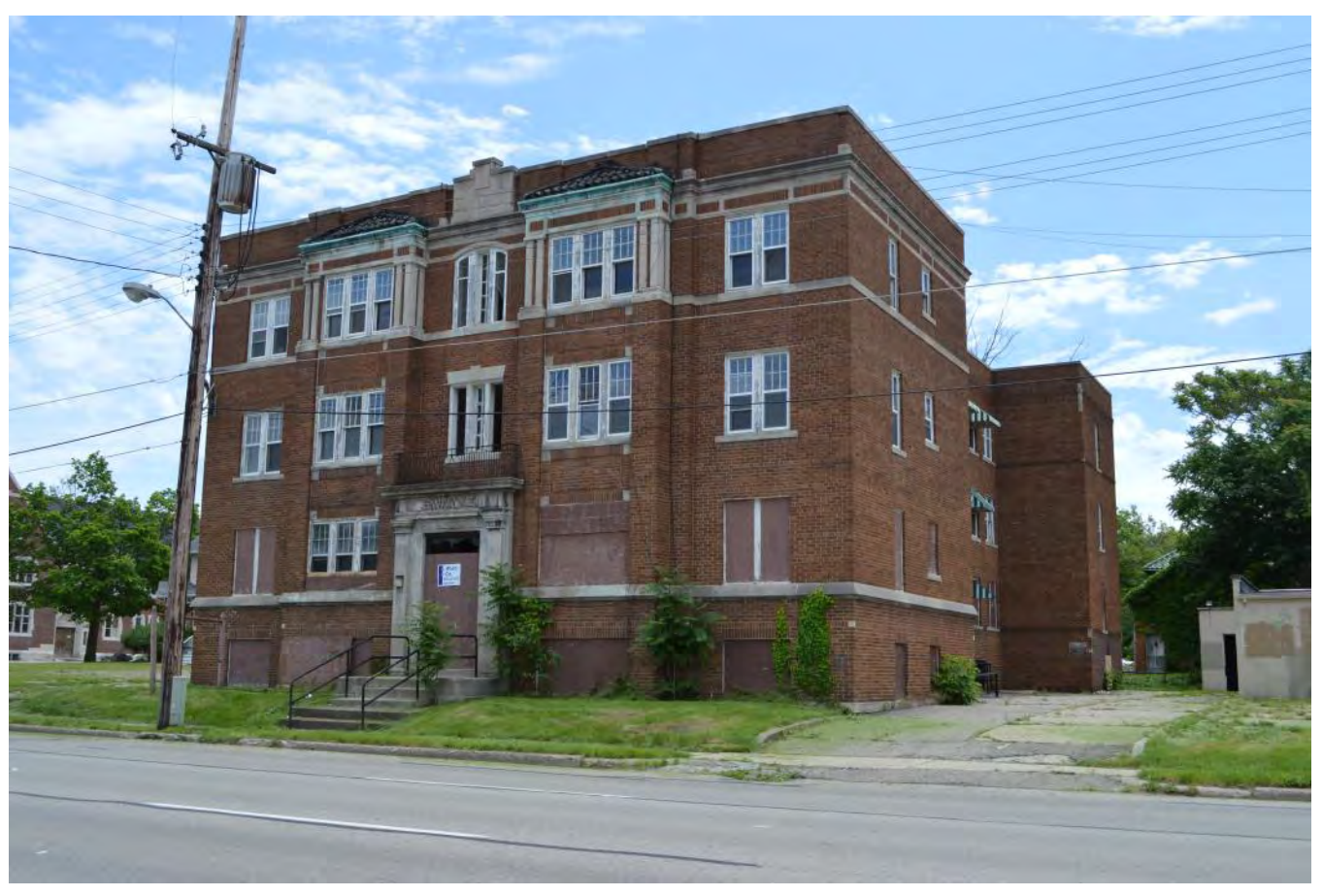
MI_Genesee County_Swayze Apartments_0001