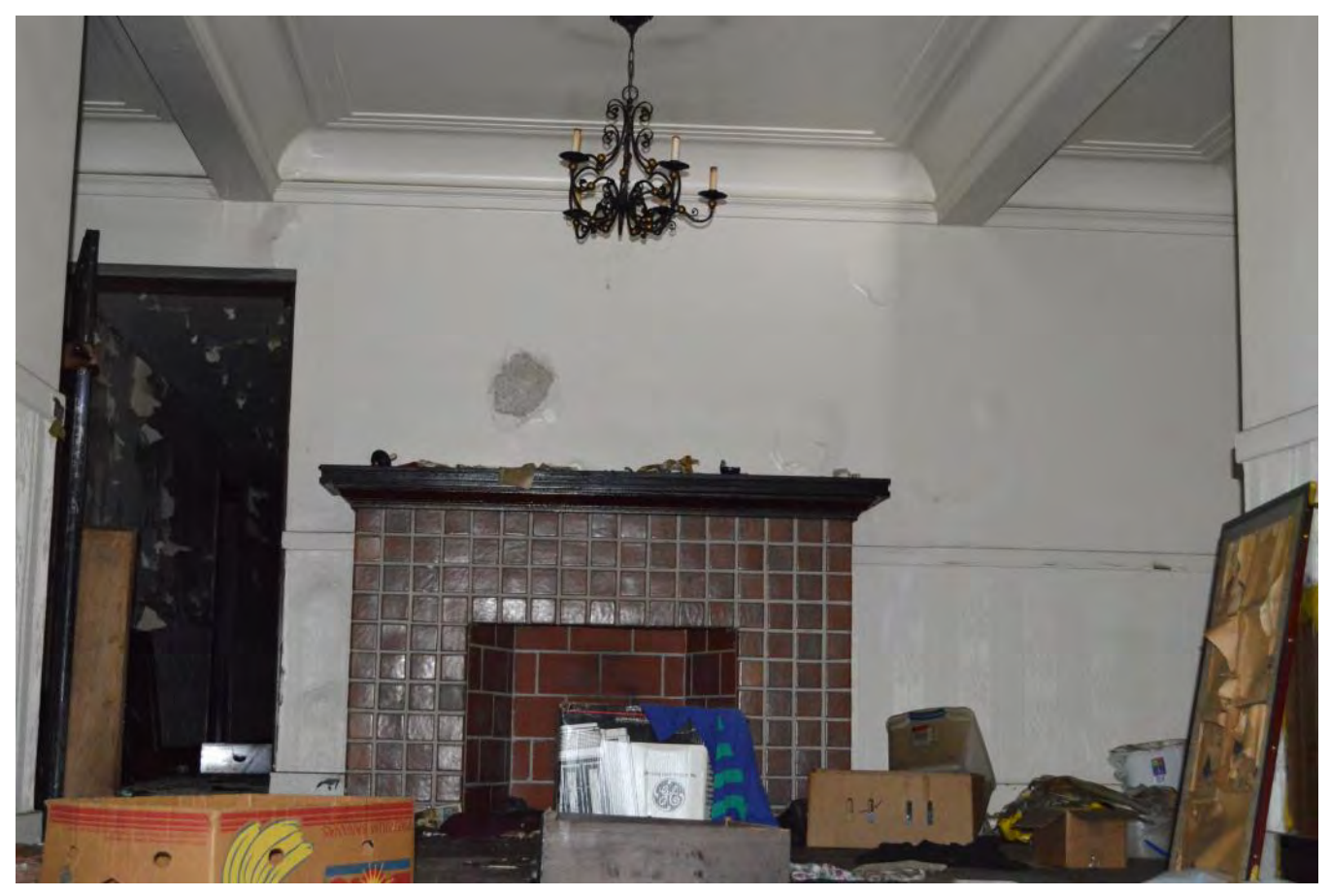
MI_Genesee County_Swayze Apartments_0005