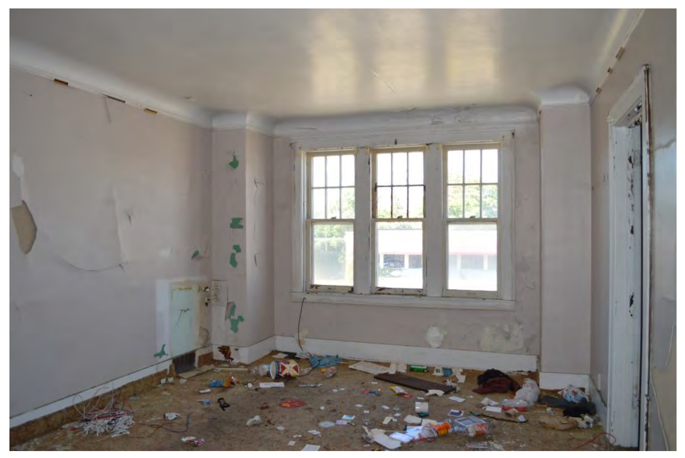
MI_Genesee County_Swayze Apartments_0007