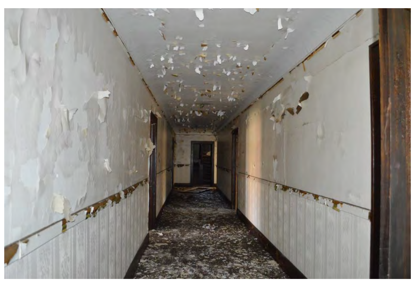
MI_Genesee County_Swayze Apartments_0006