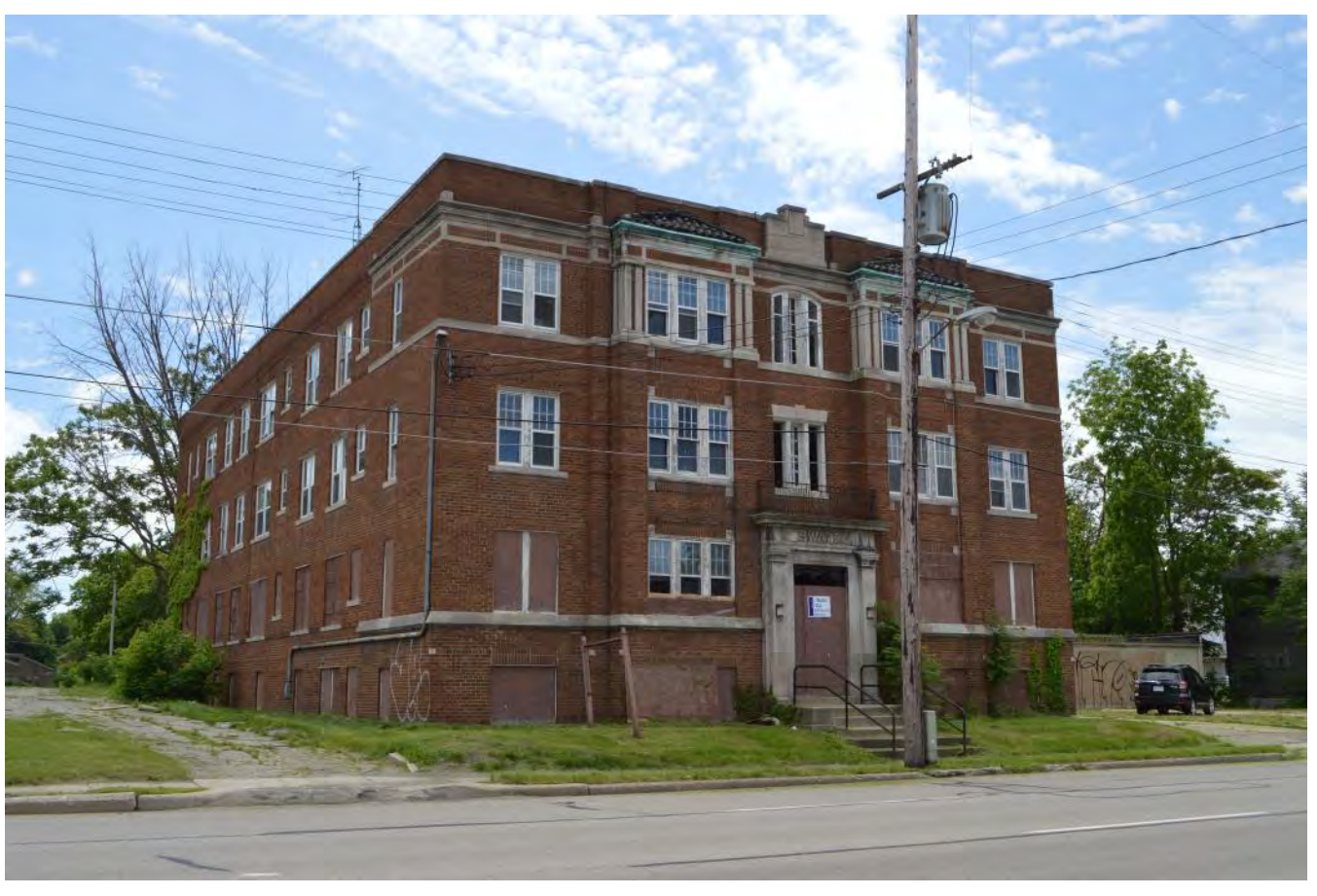
MI_Genesee County_Swayze Apartments_0002