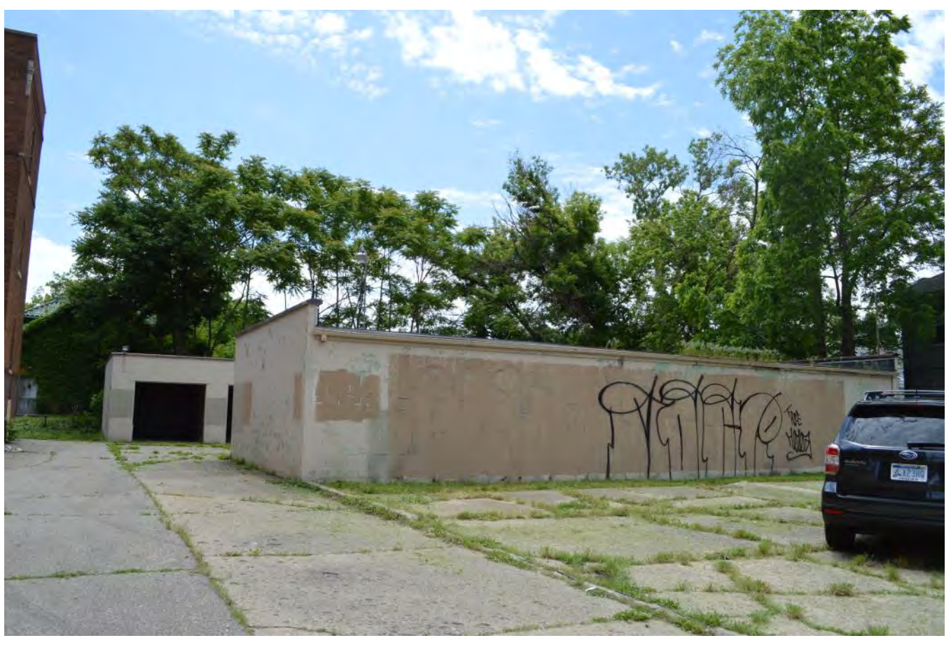
MI_Genesee County_Swayze Apartments_0004