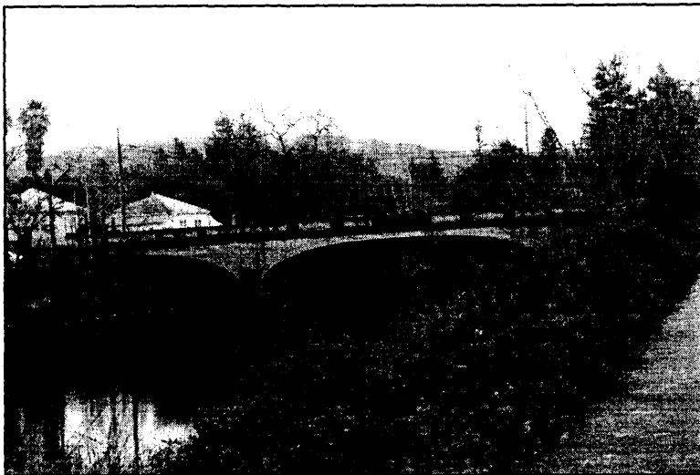
Photo No. 1 North elevation, from the northwest