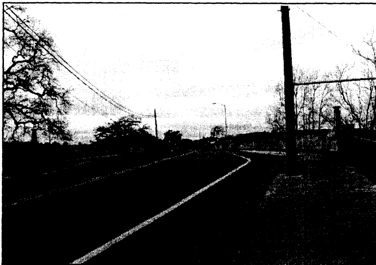
Photo No. 4 Deck, from the west