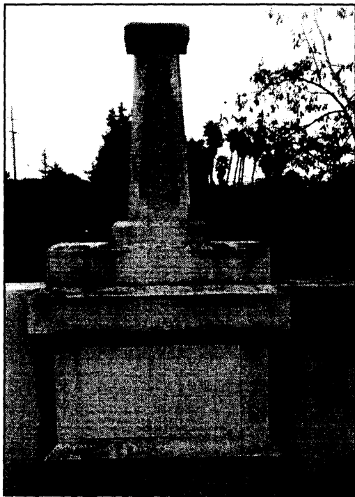
Photo No. 5 Pylon and plaque, from the north

First Street Bridge name of property Napa Co., CA county and State