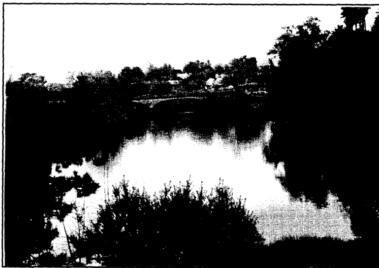
Photo No. 6 South elevation and Napa River, from the south