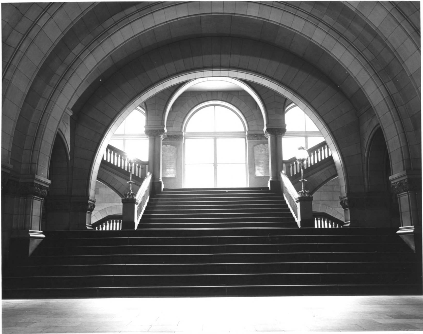
Allegheny Courthouse, Pittsburgh, Pa.