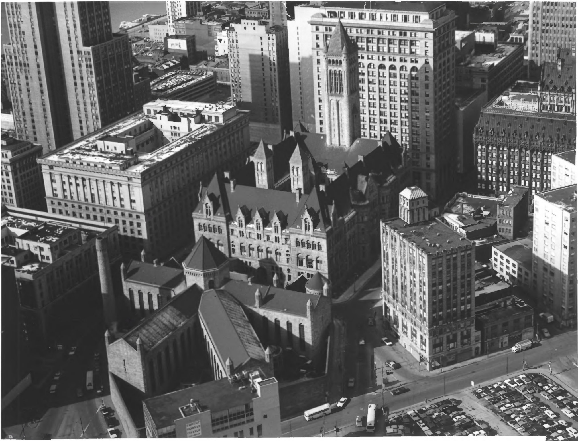
Allegheny Courthouse and Jail, Pittsburgh, Pa.