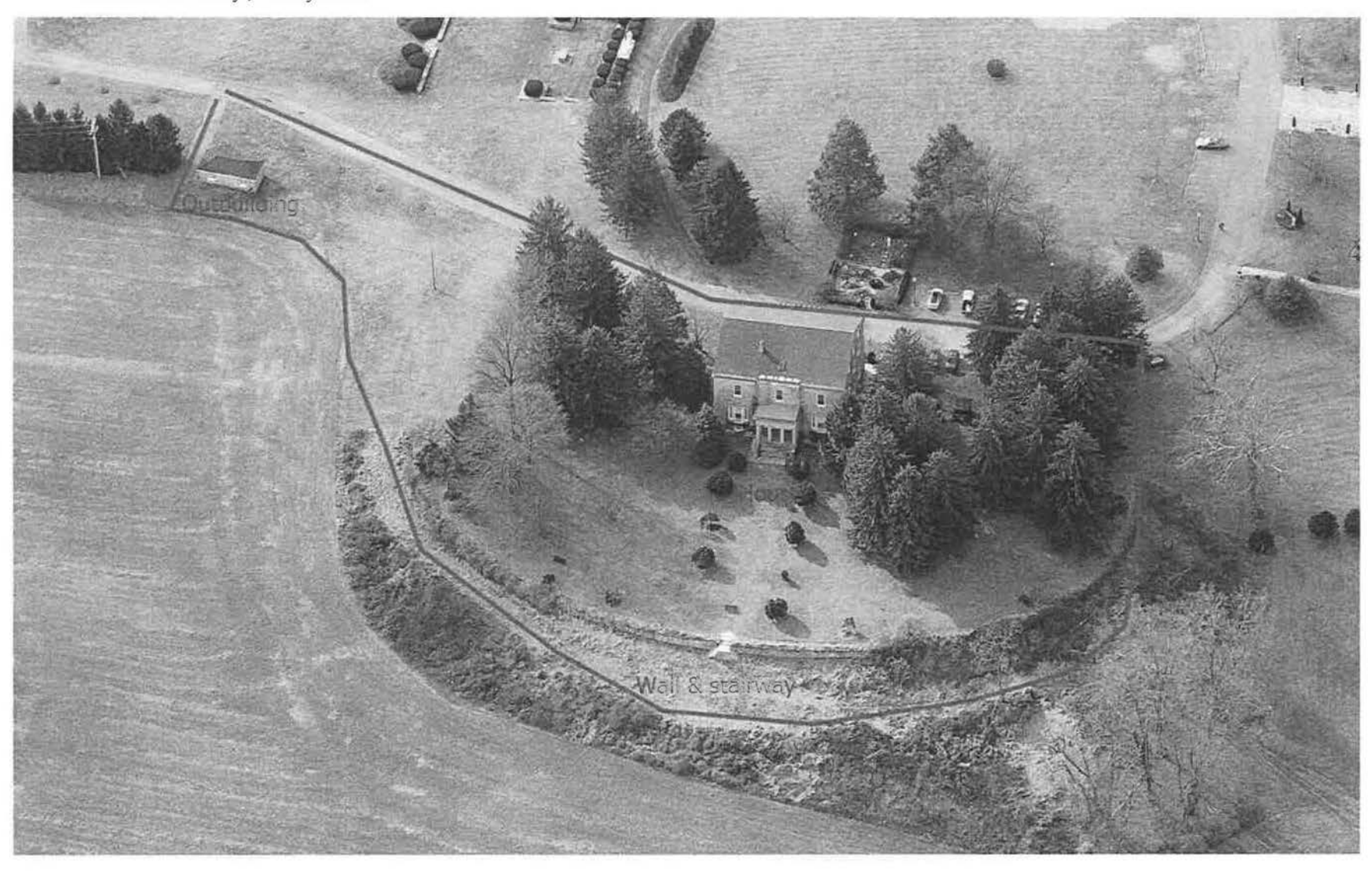
National Register Boundary (indicated by gray line) Scale: 1''=67'