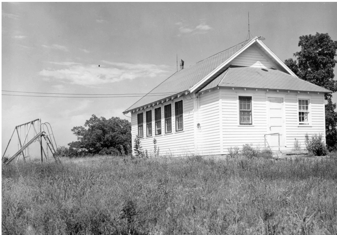
Figure 4: Salisbury School, ca. 1950s

Name of multiple listing (if applicable)