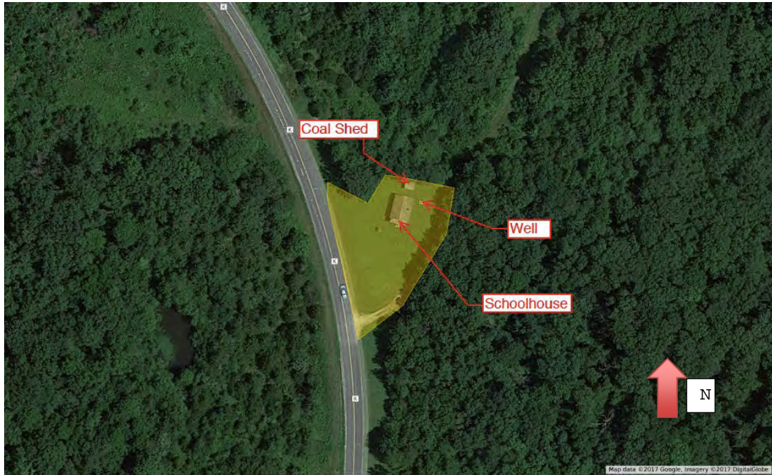
Figure 2: Site Map Lat: 40.146549 Long: -92.697284

Salisbury School site setting with boundary in yellow (shaded) and contributing structures.