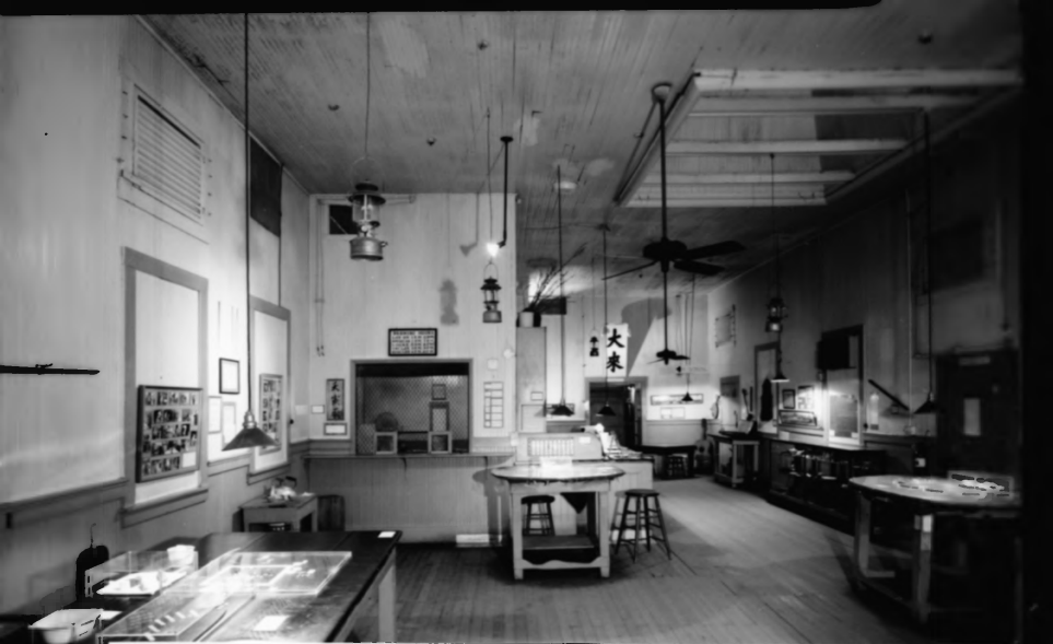
Locke Historic District, California Dai Loy Gambling House, interior showing games