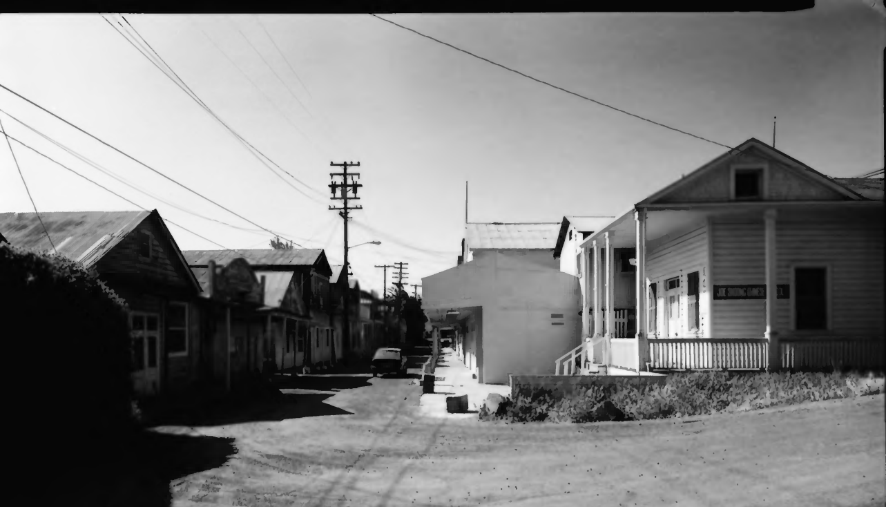
Locke Historic District, California Looking south along Main Street from Locke Road, Joe Shoong School (3) to right