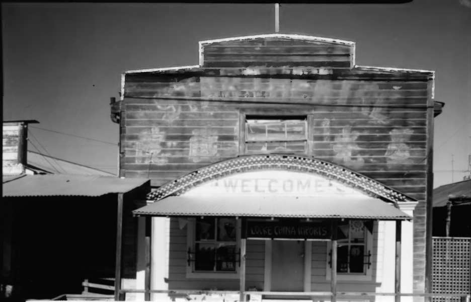
Locke Historic District, California Star Theatre (9), River Road side