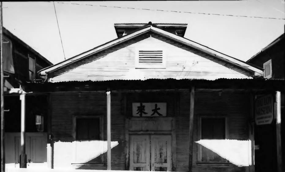
Locke Historic District, California Dai Loy Gambling House (22), east side, Main Street