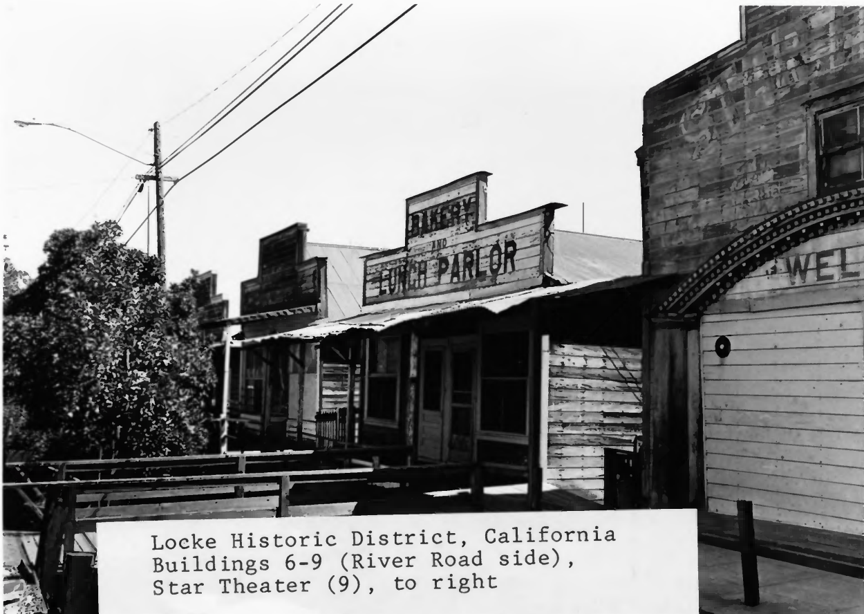
Locke Historic District, California Buildings 6-9 (River Road side), Star Theater (9), to right