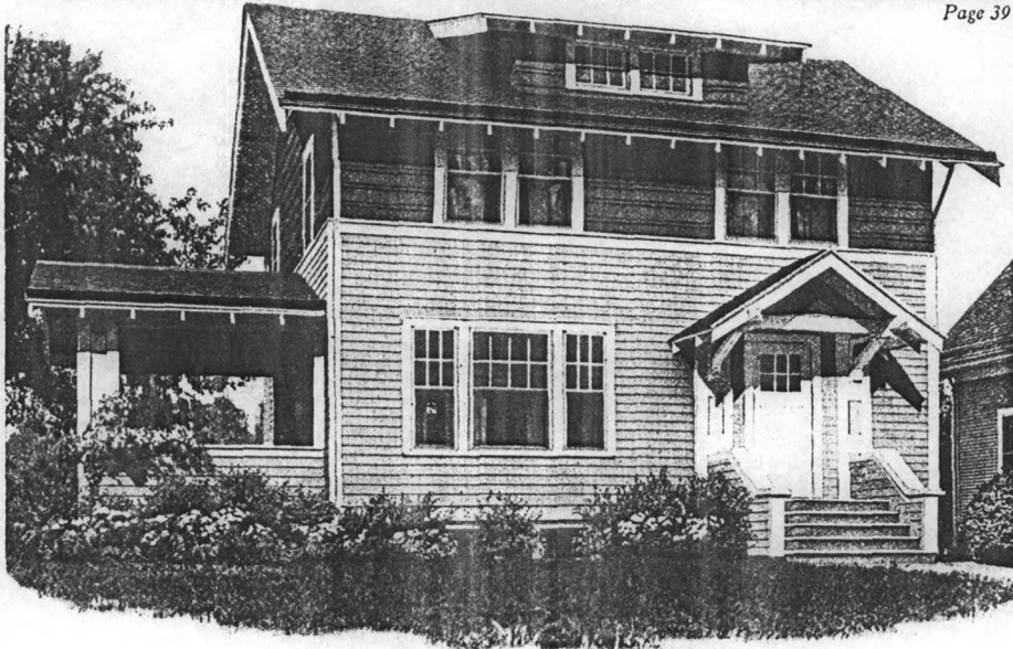
Gordon-Van Tine Home No. 505

More than 35 examples of the Side-Gabled 2-Story house form, most with Craftsman Style detailing, appear in the Redmond Park-Grande Avenue Historic District. This form was frequently used for slightly wide lots because of its horizontal form, an appearance that was accentuated by the fact that its roof pitch and overall height were lower than most of the Front-Gabled 2-Story houses in the neighborhood. A list of the better preserved examples of this form is included on page 6.