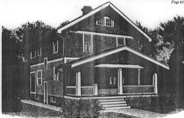
Gordon-Van Tine Home No. 501

combination of features setting it apart from a similar example next door or across the street. A comprehensive list of