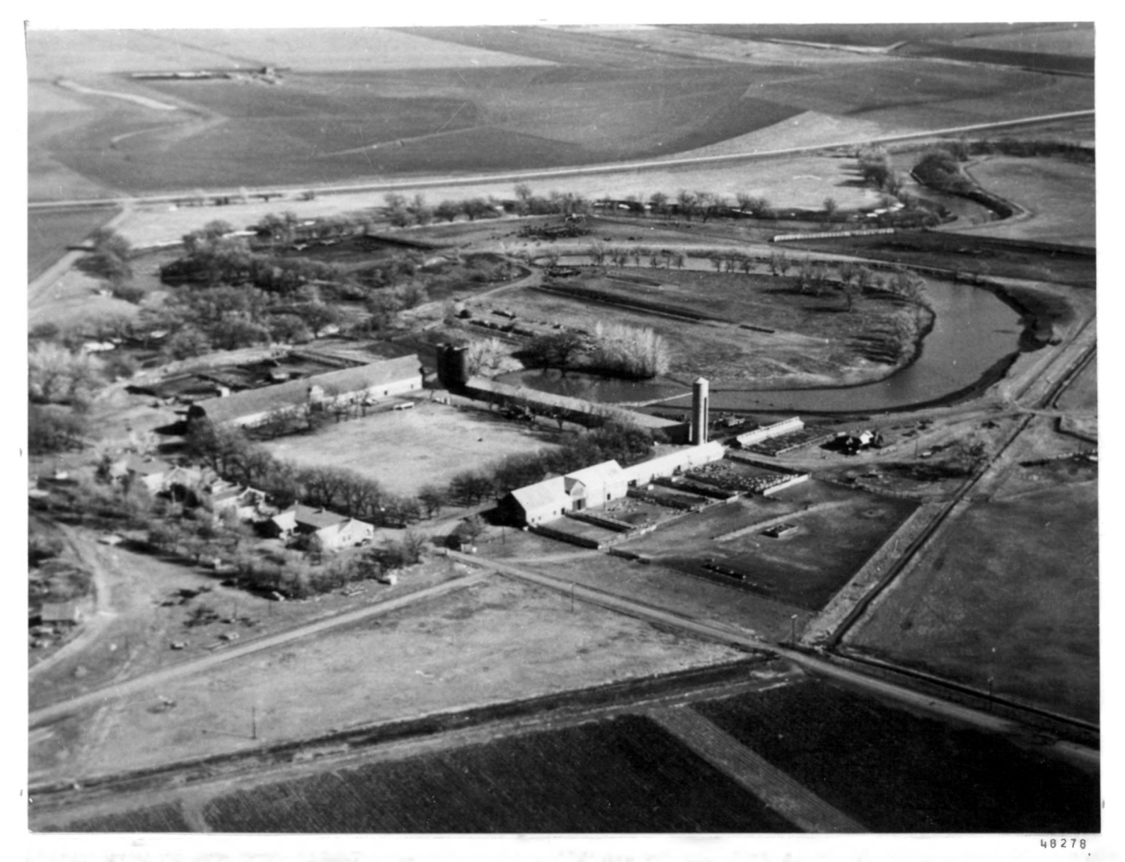
AERIAL VIEW OF FORT LARNED, Kansas. The buildings of the fort surrounding the parade grounds have been converted into farm buildings.