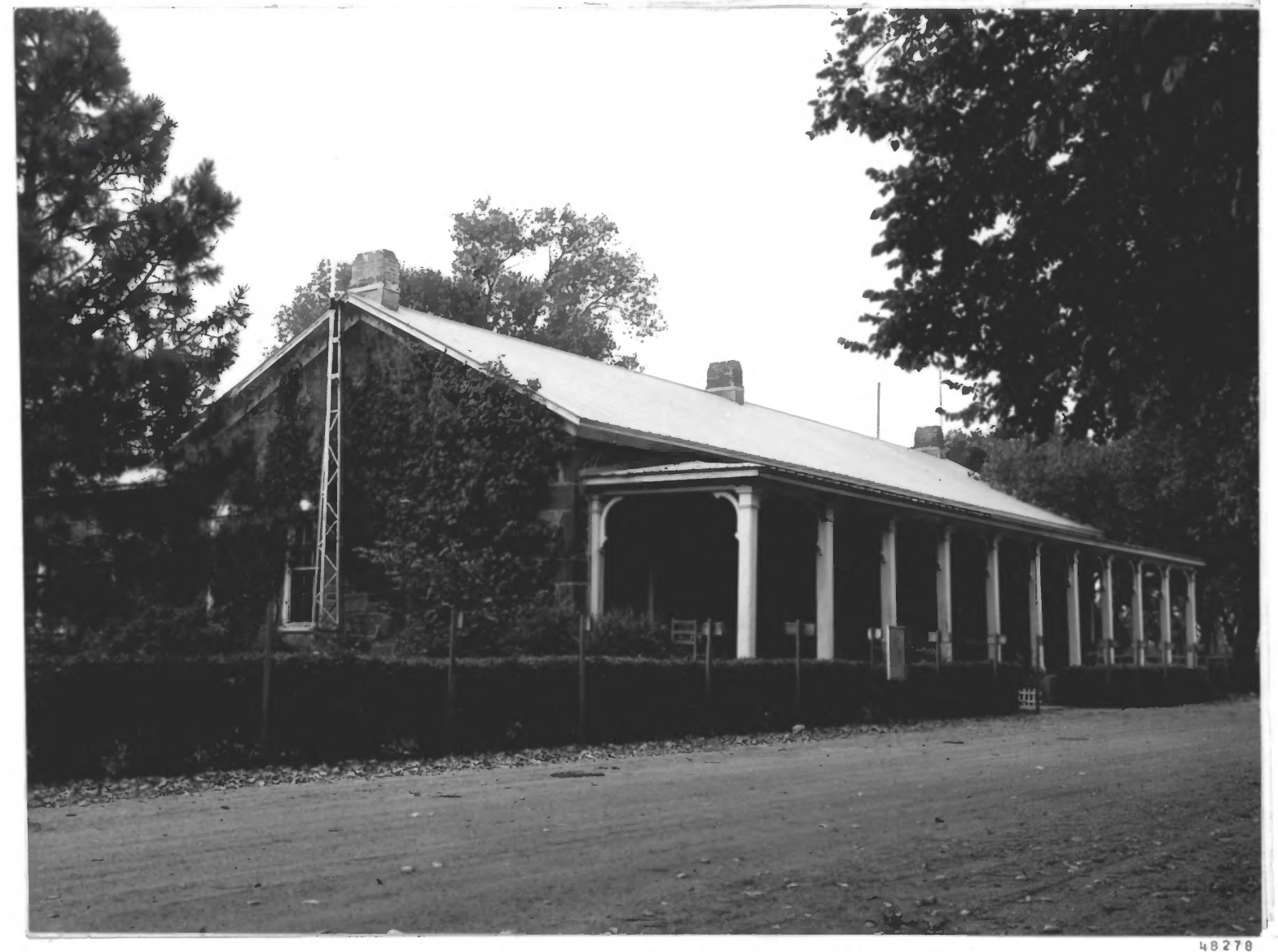
OFFICERS' QUARTERS FORT LARNED. This structure now serves as a museum