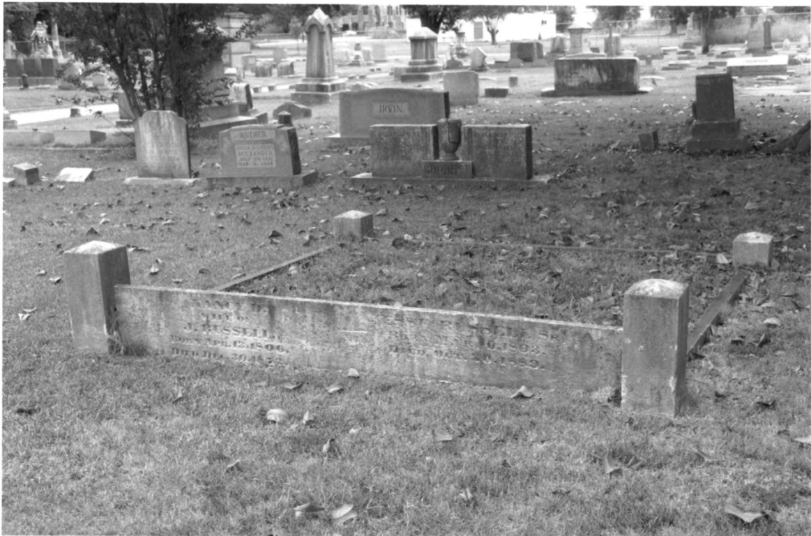
RIVERSIDE CEMETERY MADISON CO. TN