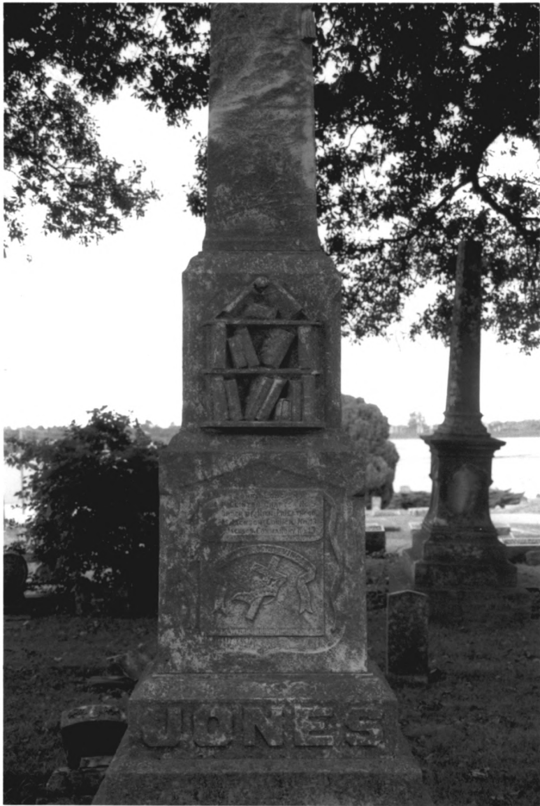
RIVERSIDE CEMETERY MADISON CO. TN