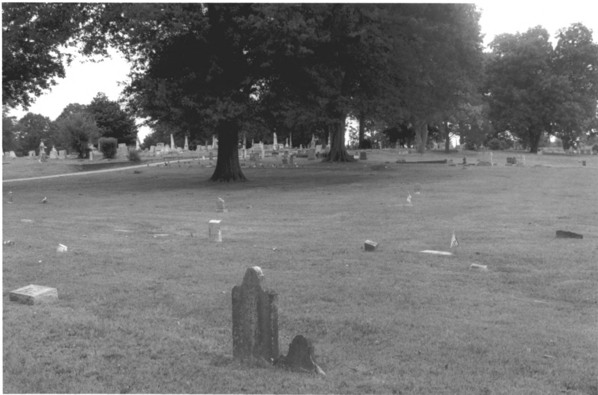
RIVERSIDE CEMETERY MADISON CO. TN