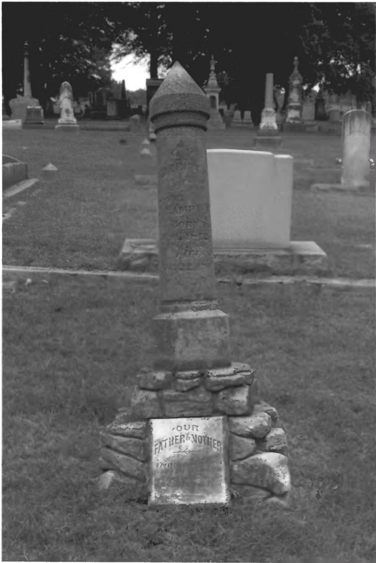
RIVERSIDE CEMETERY MADISON CO. TN