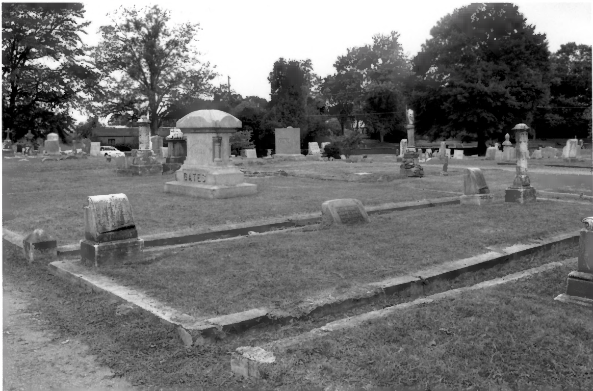
RIVERSIDE CEMETERY MADISON CO TN