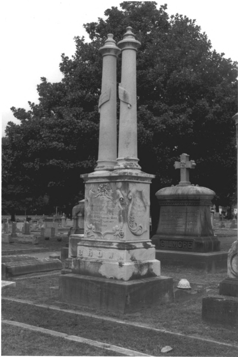
RIVERSIDE CEMETERY MADISON CO. TN