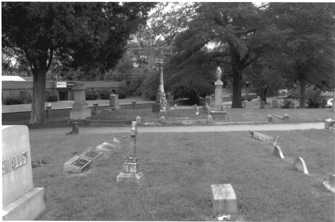
RIVERSIDE CEMETERY MADISON CO. TN