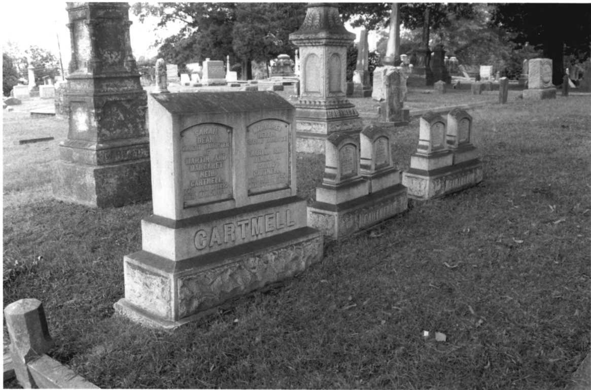
RIVERSIDE CEMETERY MADISON CO. TN