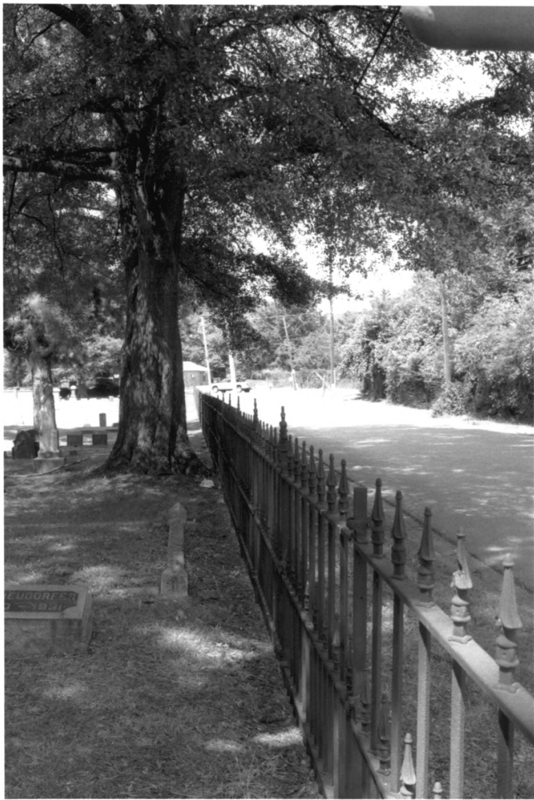
RIVERSIDE CEMETERY MADISON CO. TN