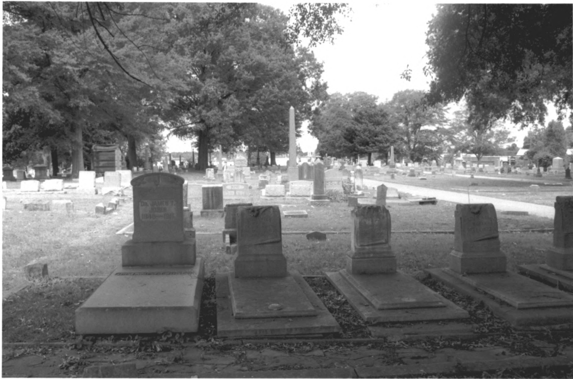
RIVERSIDE CEMETERY MADISON CO. TN