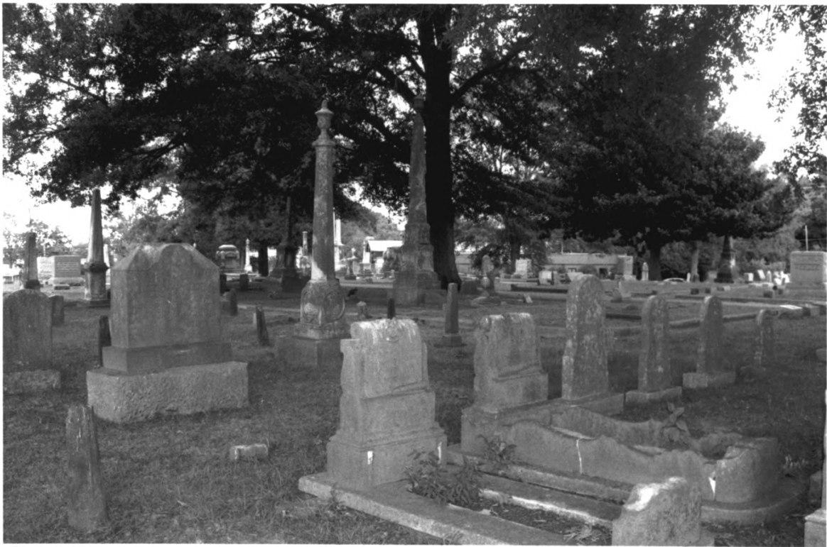
RIVERSIDE CEMETERY MADISON CO. TN