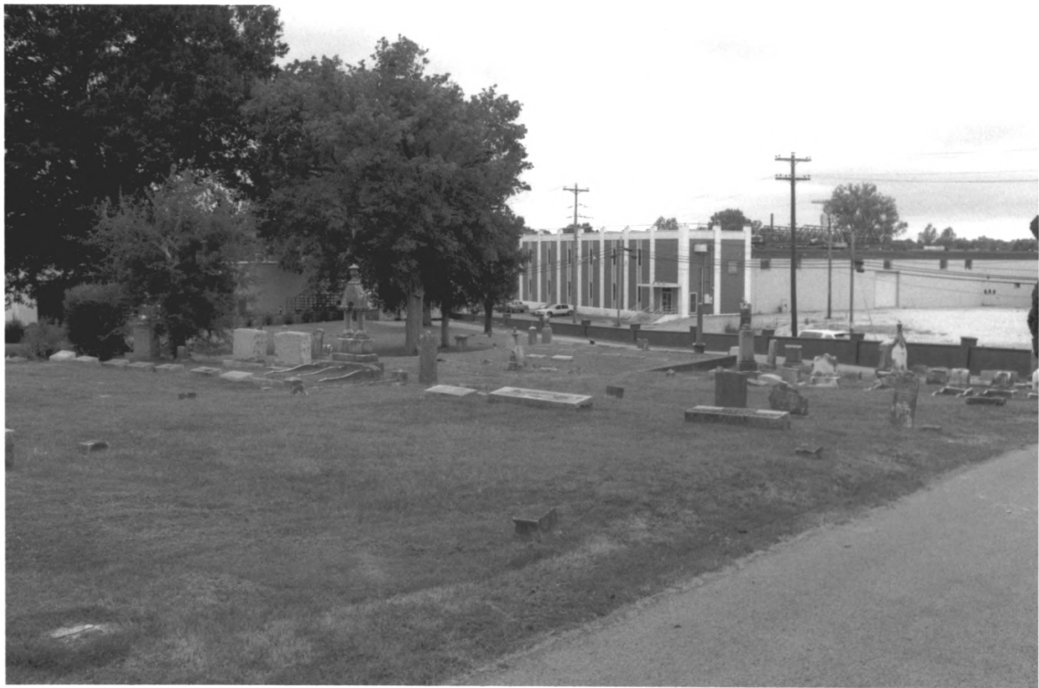
RIVERSIDE CEMETERY MADISON CO. TN