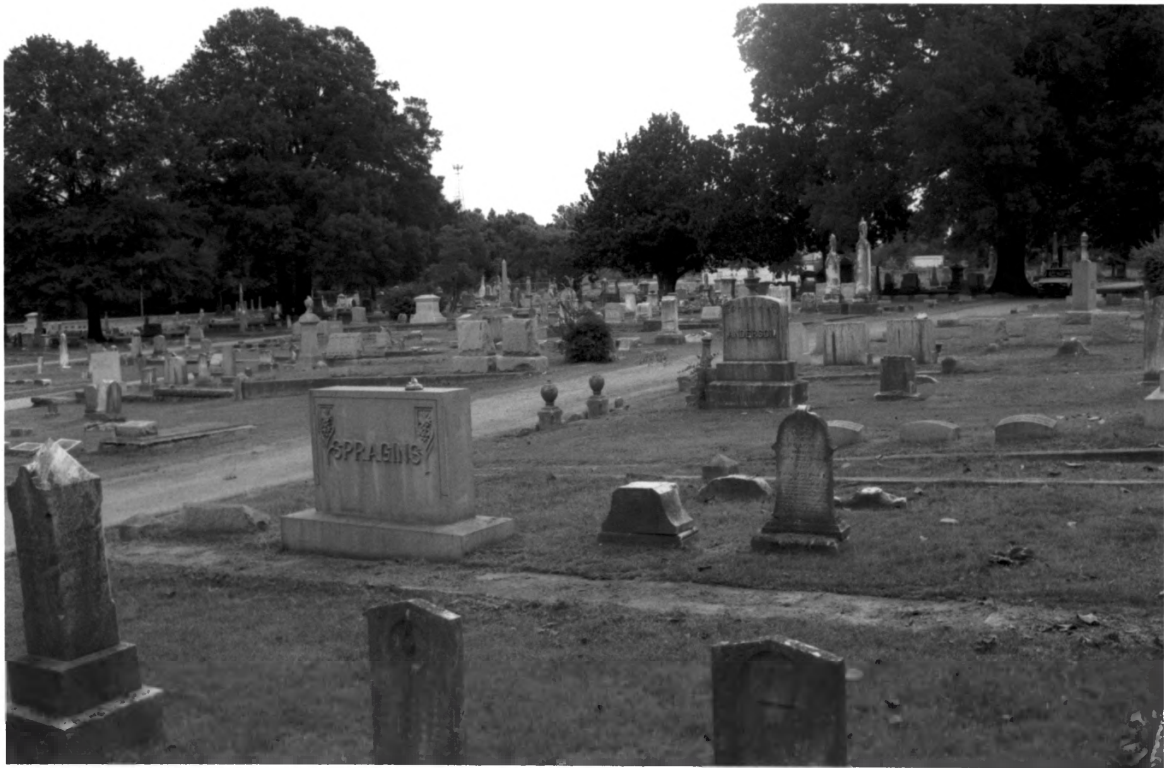
RIVERSIDE CEMETERY MADISON CO. TN