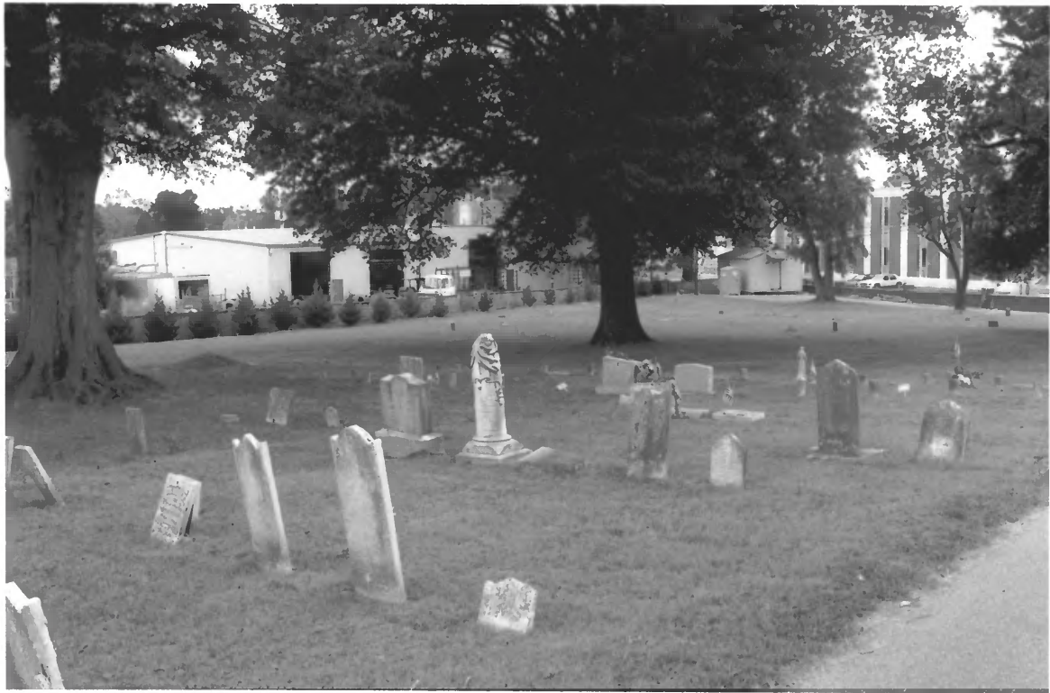
RIVERSIDE CEMETERY MADISON CO. TN