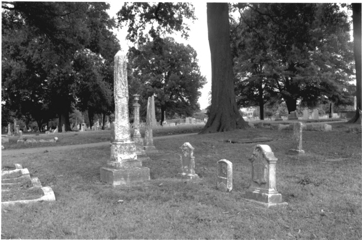
RIVER SIDE CEMETERY MADISON CO. TN