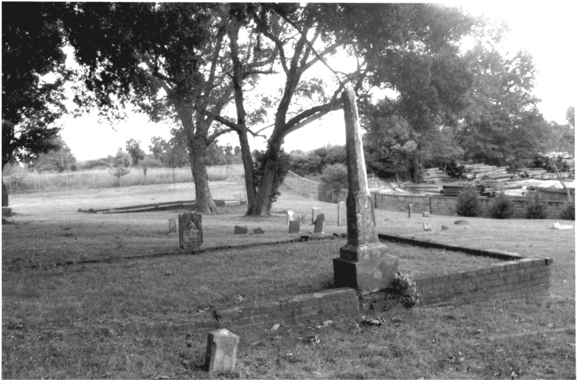
RIVERSIDE CEMETERY MADISON CO. TN