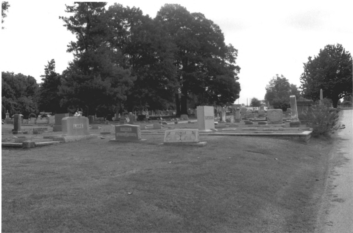
RIVERSIDE CEMETERY MADISON CO. TN