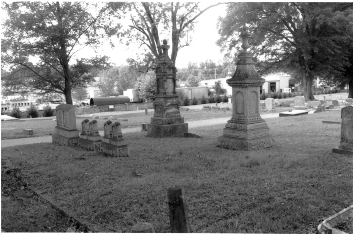
RIVERSIDE CEMETERY MADISON CO.