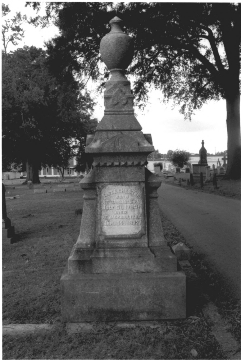
RIVERSIDE CEMETERY MADISON CO. TN