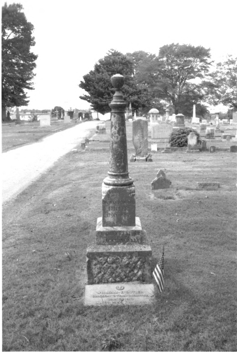
RIVERSIDE CEMETERY MADISON CO. TN