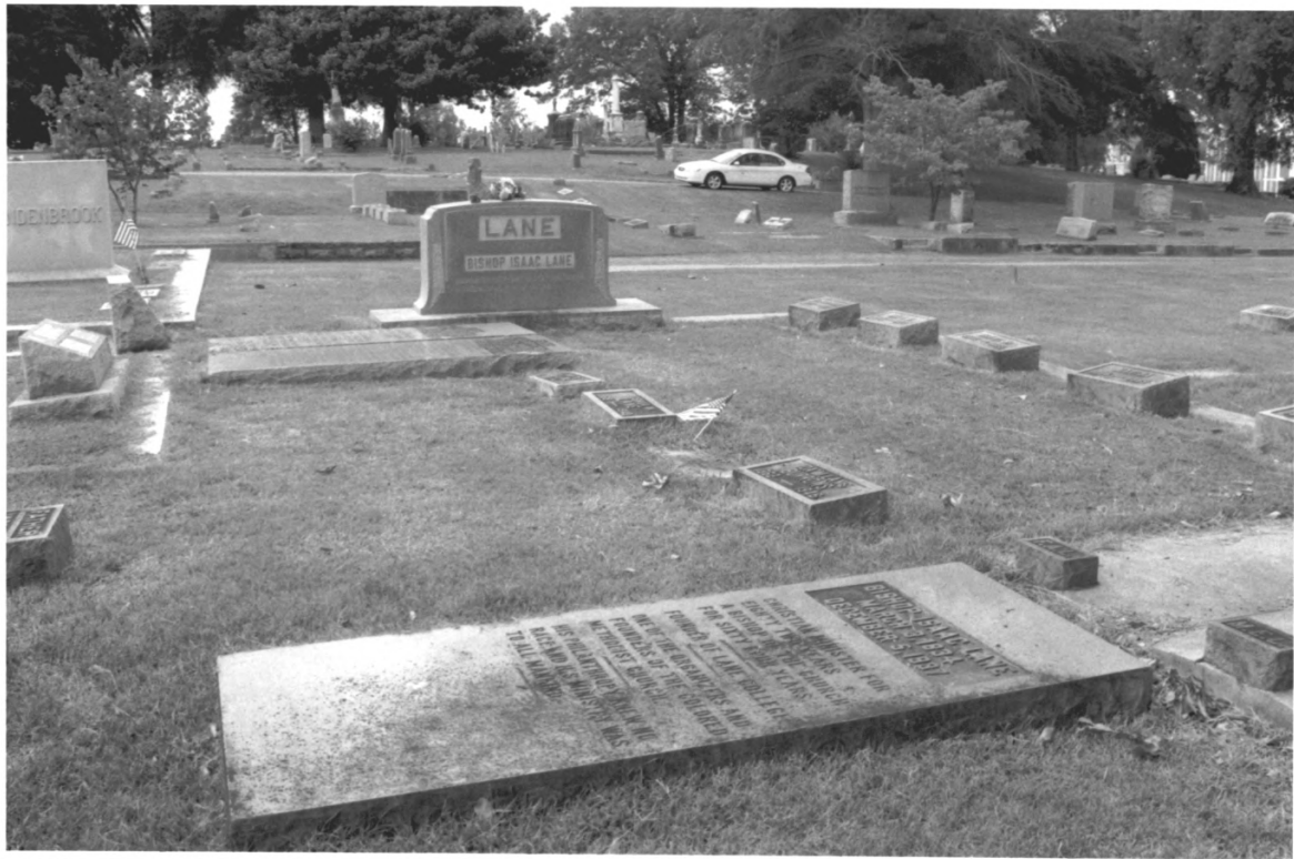
RIVERSIDE CEMETERY MADISON CO. TN