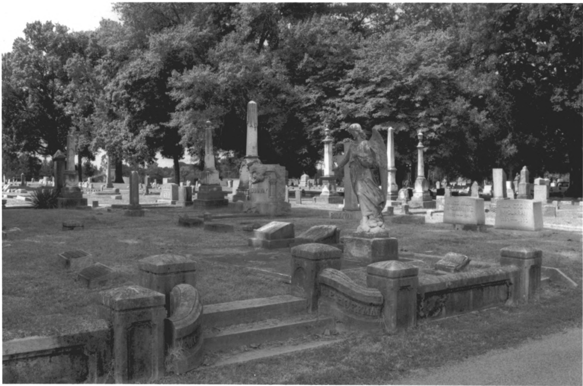
RIVERSIDE CEMETERY MADISON CO. TN