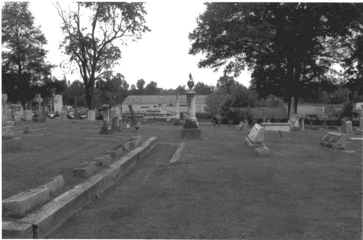
RIVERSIDE CEMETERY MADISON CO, TN