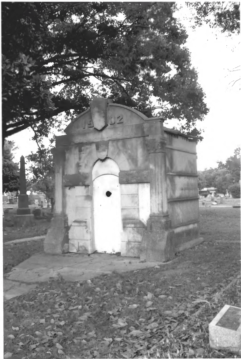
RIVERSIDE CEMETERY MADISON CO. TN