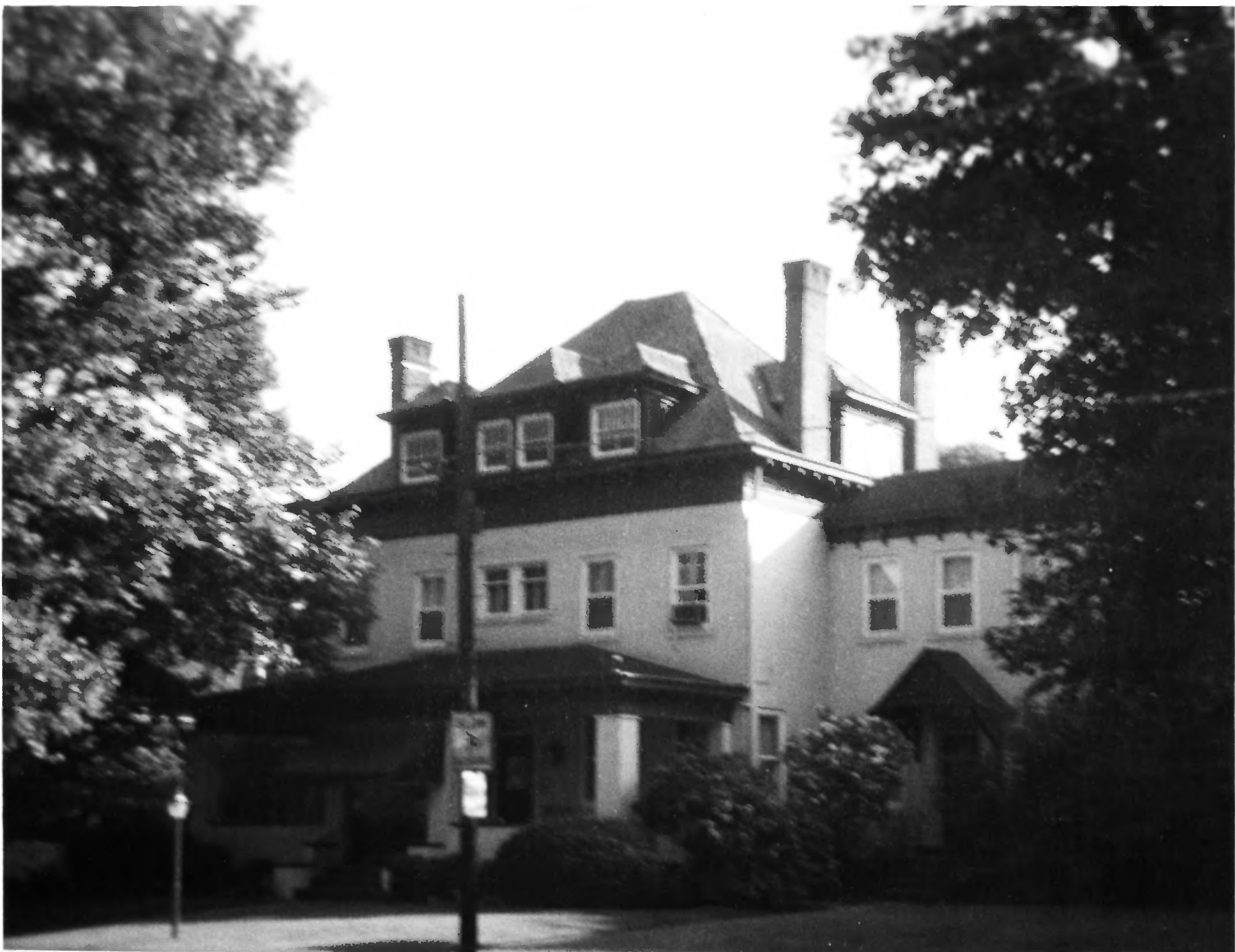
Matthew Quay House, Beaver, Pennsylvania