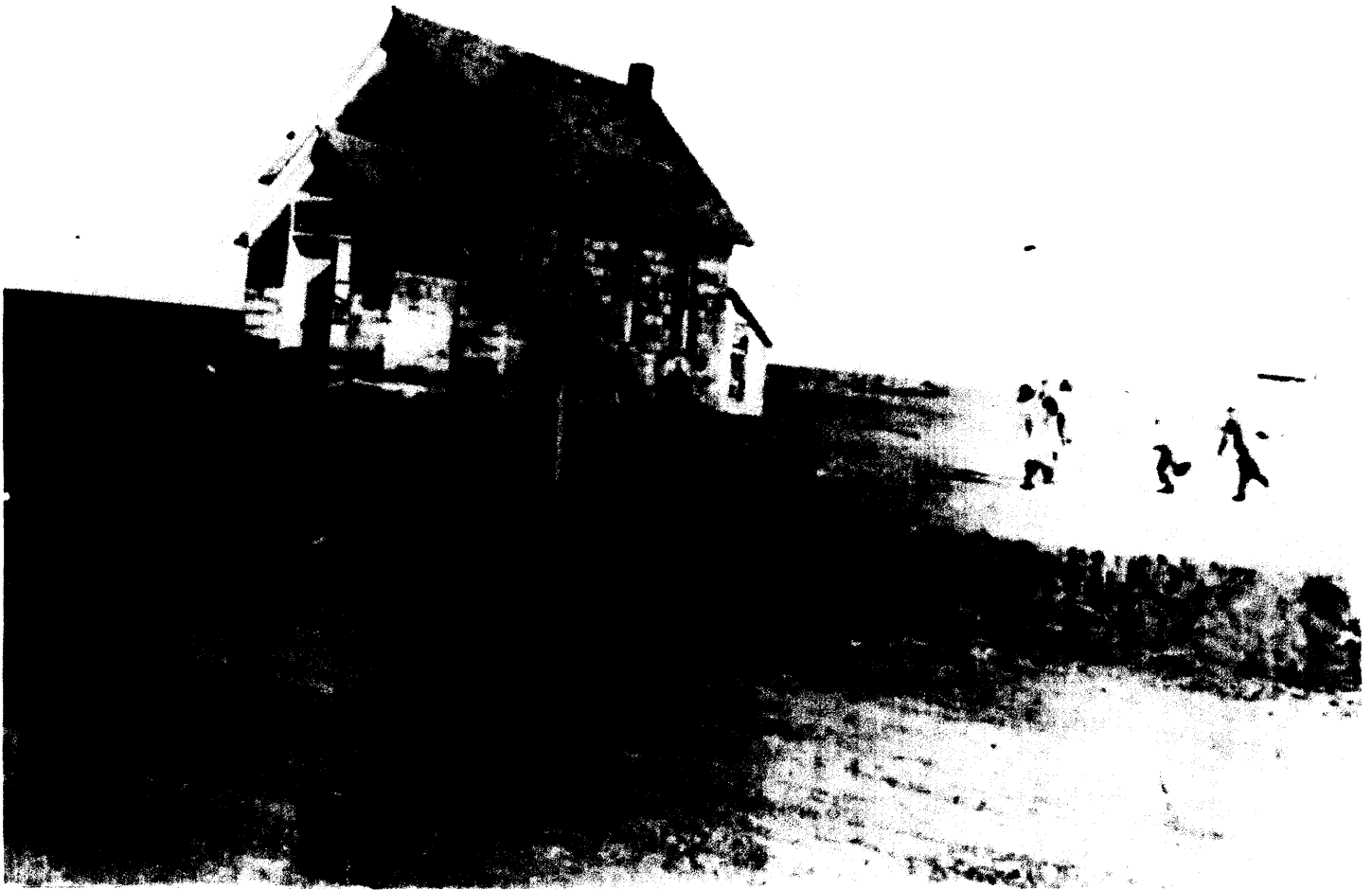
Figure 1 – Historic View of Wilcox School

Historic Public Schools of Kansas Wilcox School – District 29, Trego County, Kansas