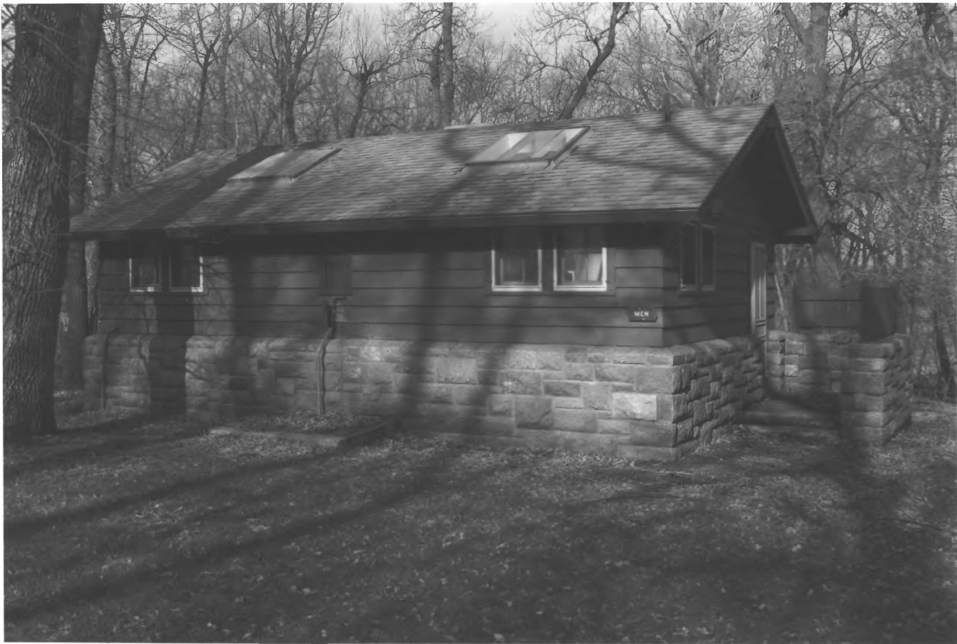
LAKE SHETEK STATE PARK WPA/RUSTIC STYLE HISTORIC DISTRICT MURRAY CO., MN BLDG # 5 PHOTO I.D. 09725 #10