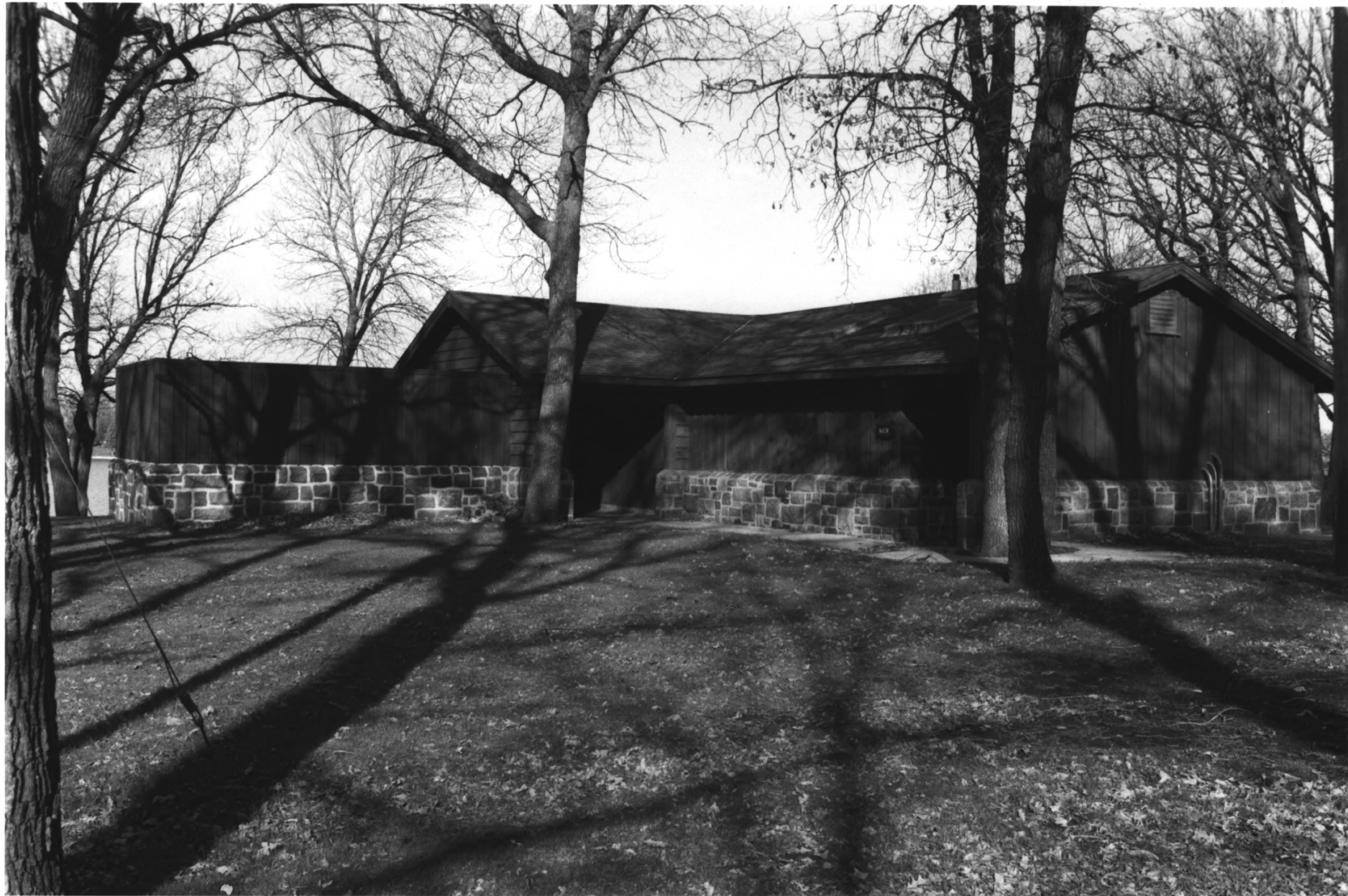
LAKE SHETEK STATE PARK WPA/RUSTIC STYLE HISTORIC DISTRICT MURRAY CO., MN BLDG # 1 PHOTO I.D. 09725 #1