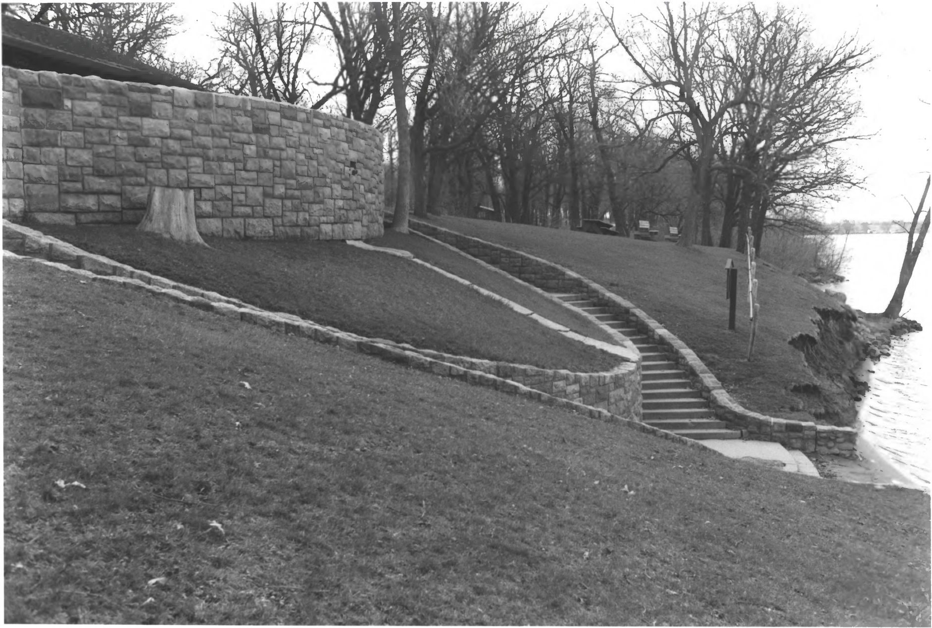
LAKE SHETEK STATE PARK WPA/RUSTIC STYLE HISTORIC DISTRICT MURRAY CO., MN BEACH HOUSE TERRACE, RETAINING WALL, AND STONE STAIRWAYS # 09725-13