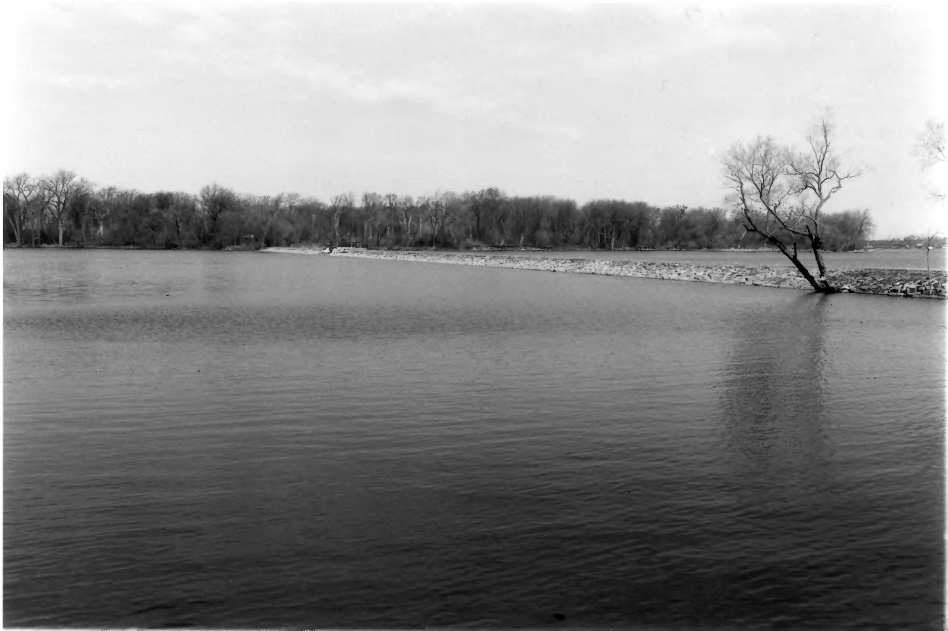
LAKE SHETER STATE PARK WPA / RUSTIC STYLE HISTORIC DISTRICT MURRAY CO., MN STRUCTURE # 7 PHOTO I.D. 09721 # 1