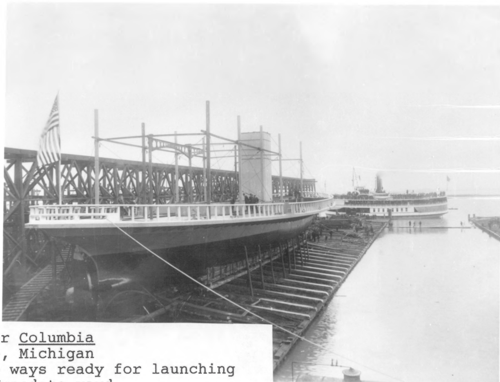
Steamer Columbia Ecorse, Michigan On the ways ready for launching at Wyandote yard Photo #1 by Unknown Courtesy of William A. Hoey