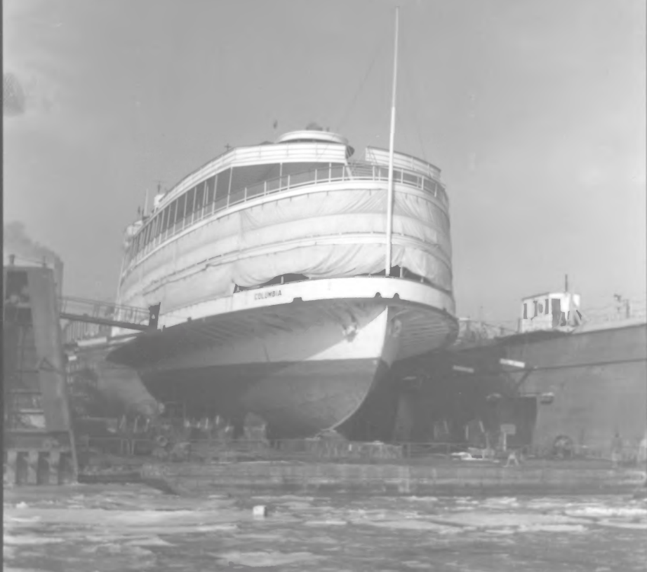
Steamer Columbia Ecorse, Michigan In drydock, 1966