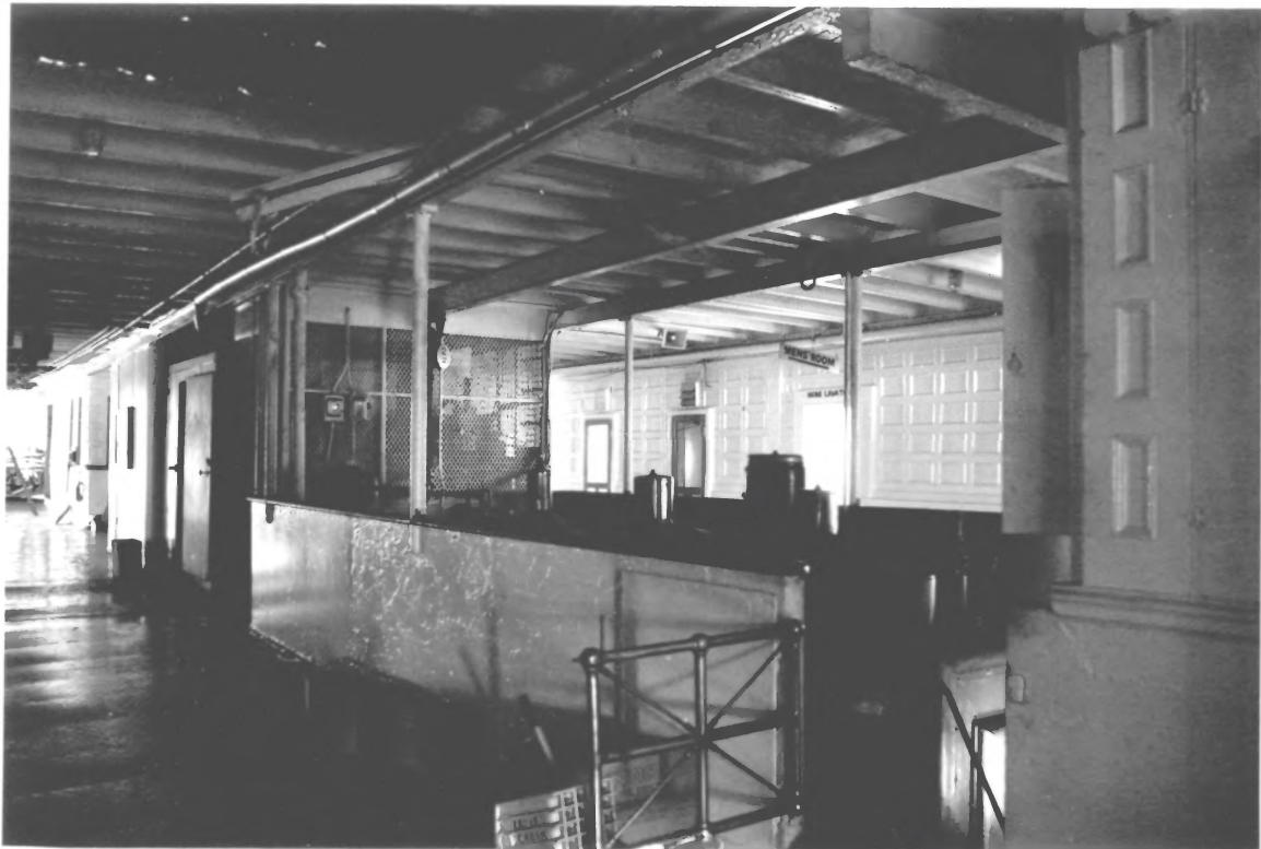
Steamer Columbia Ecorse, Michigan Main deck amidships, 1991