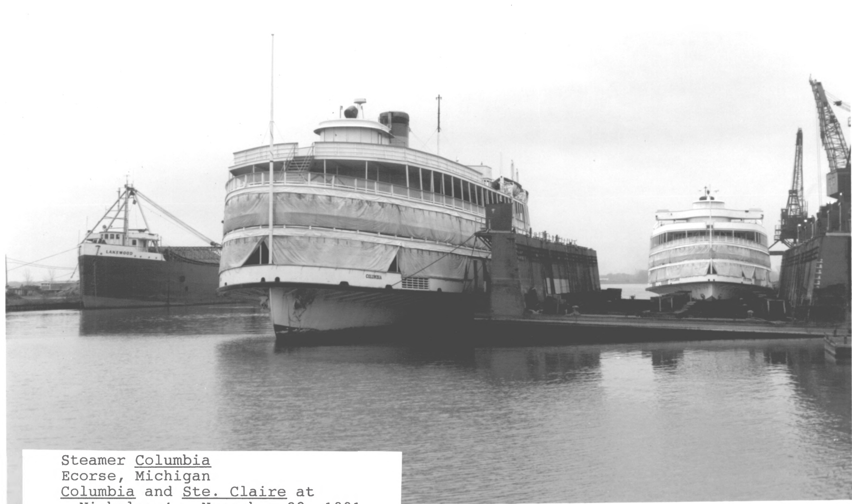
Steamer Columbia Ecorse, Michigan Columbia and Ste. Claire at Nicholson's, November 22, 1991