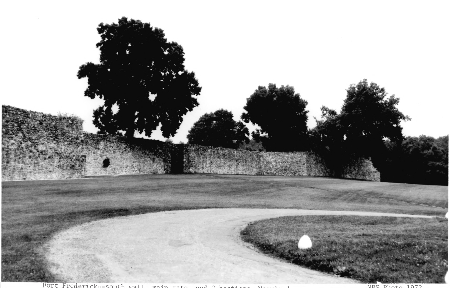
Fort Frederick--south wall, main gate, and 2 bastions, Maryland.