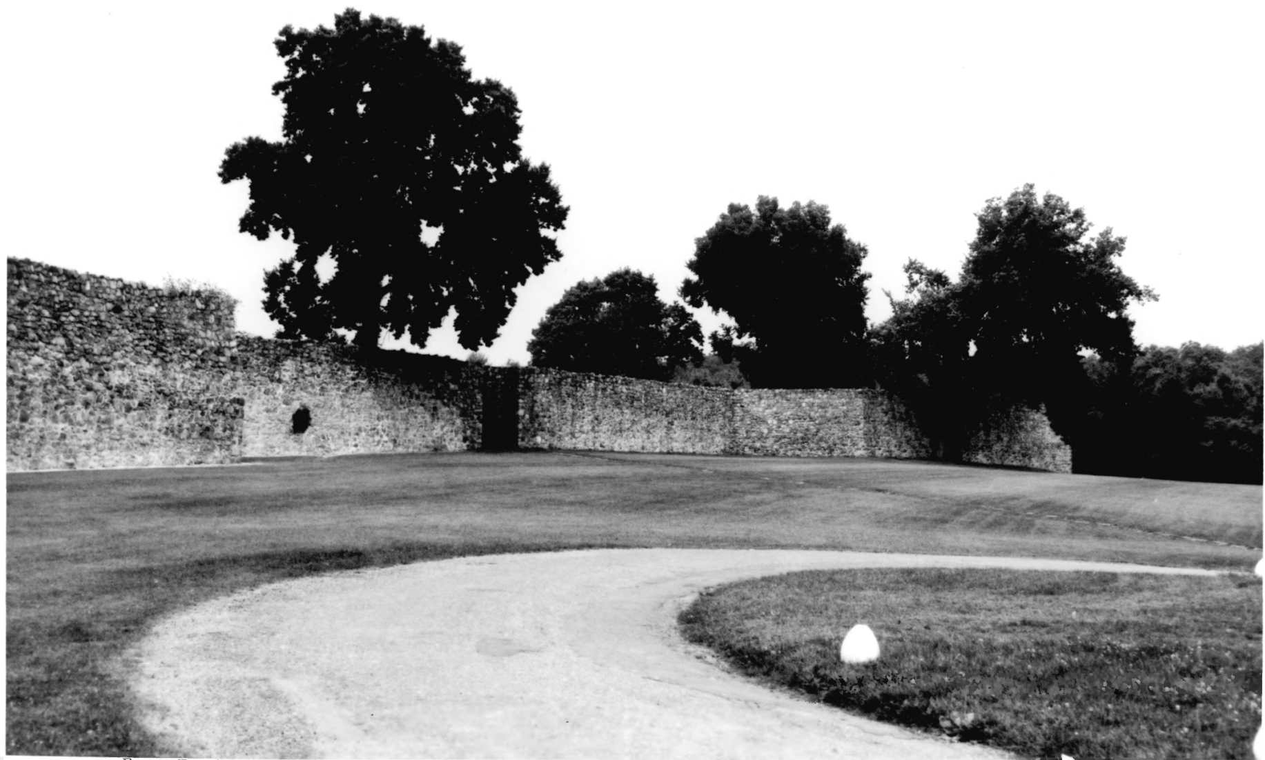
Fort Frederick--south wall, main gate, and 2 bastions, Maryland.