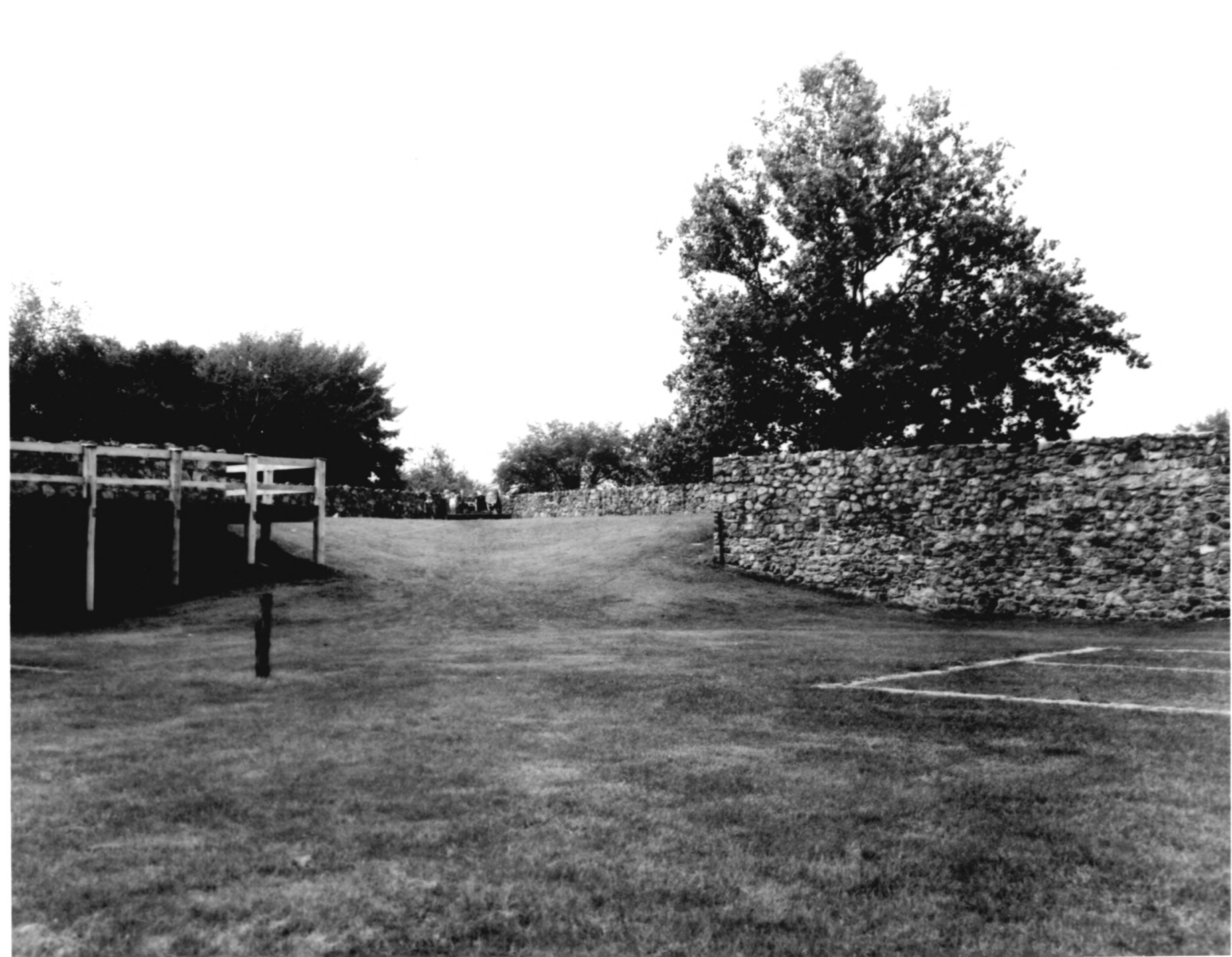
Fort Frederick Interior of NW Bastion, Maryland.