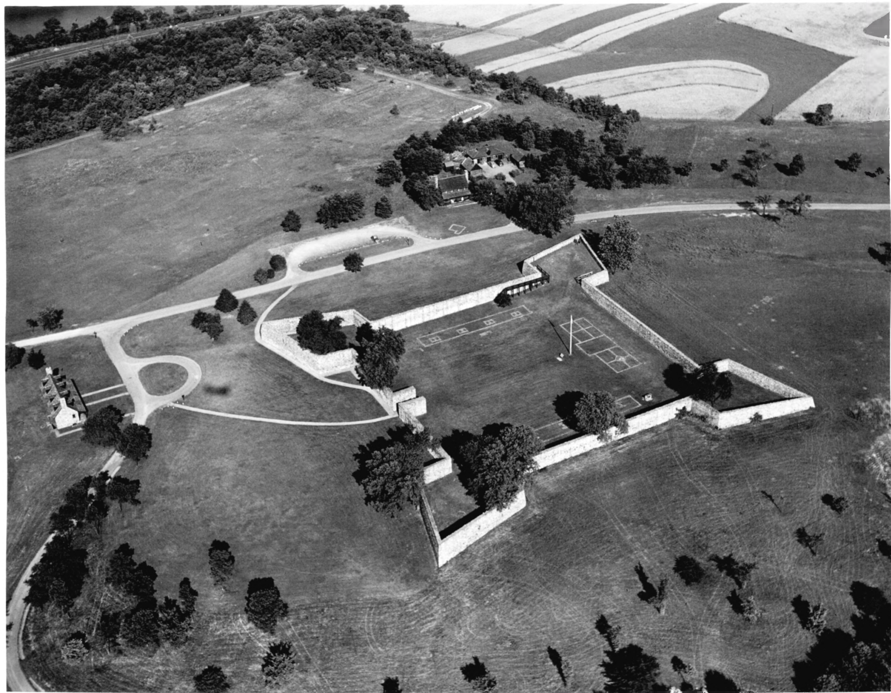
Fort Frederick, Big Pool, Maryland