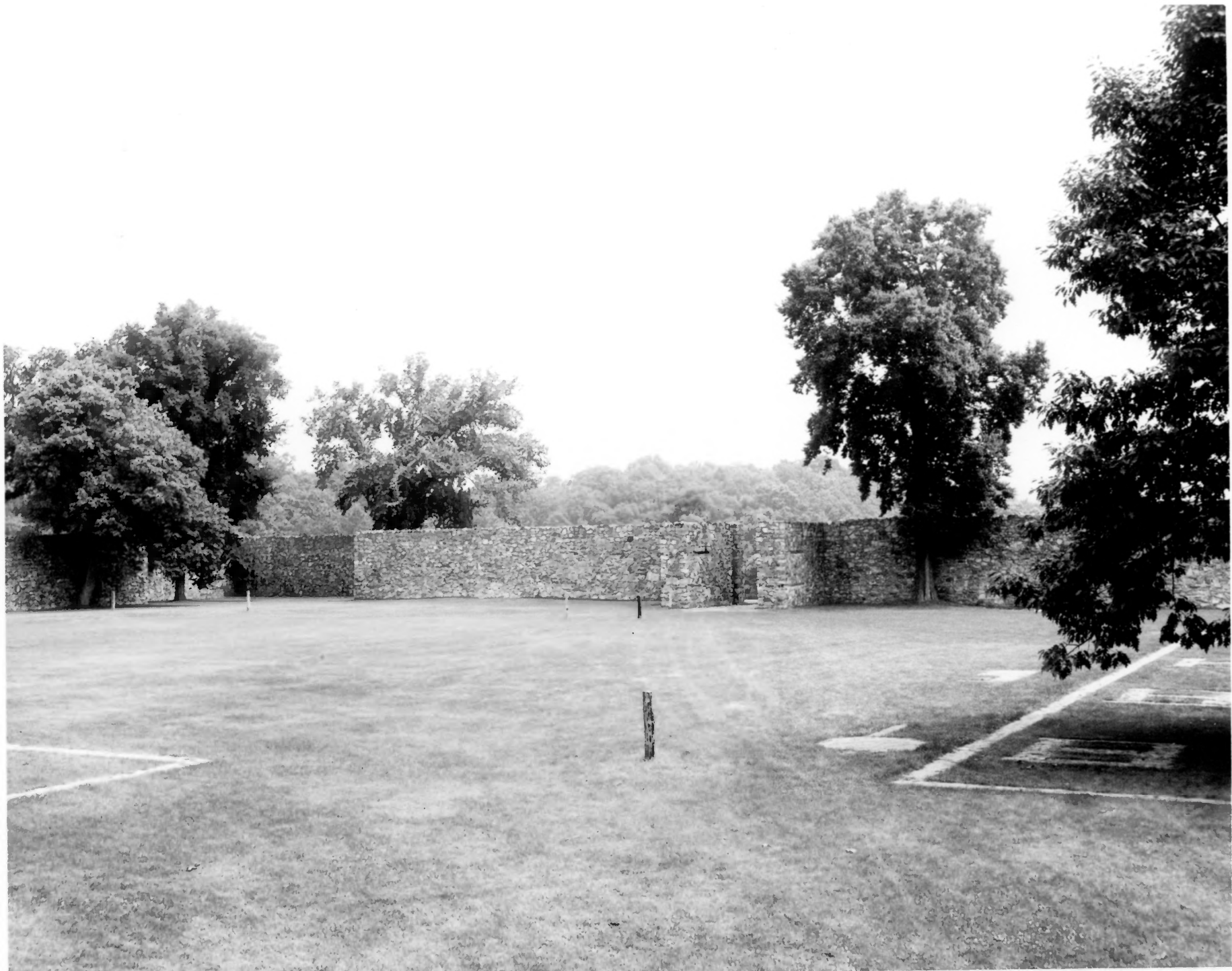
Fort Frederick: Parade Gate, main gate and SE Bastion, Maryland