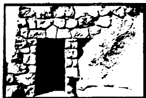
EAST ELEV. OF 1-STORY WING