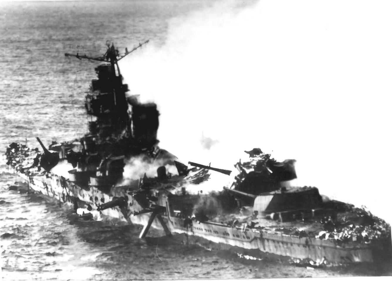
Japanese cruiser Mikuma which sank June 6, 1942, Battle of Midway. An American dive bomber crashed on the after gun turret.