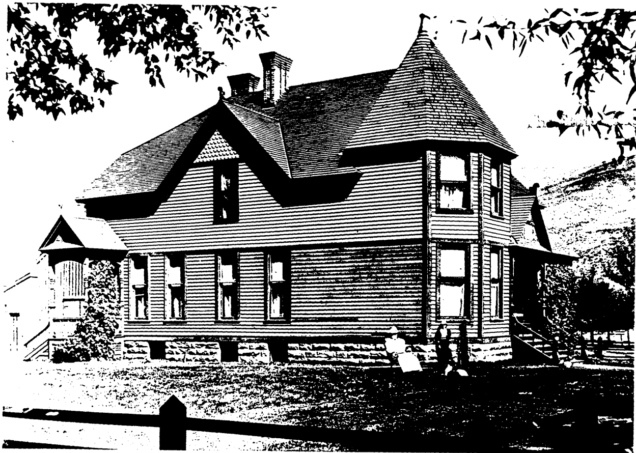
Shilling-Lamb House, 525 North 2nd Street, Aspen photo- ca. 1898