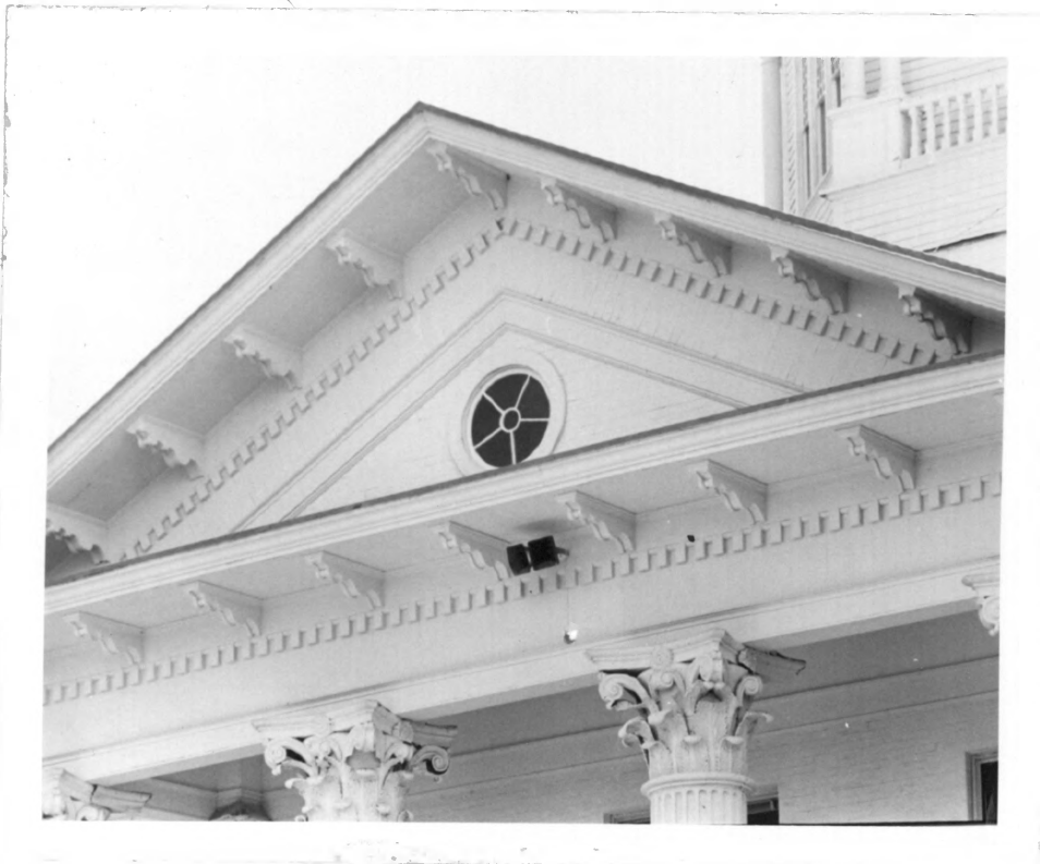
DETAIL - PEDIMENT