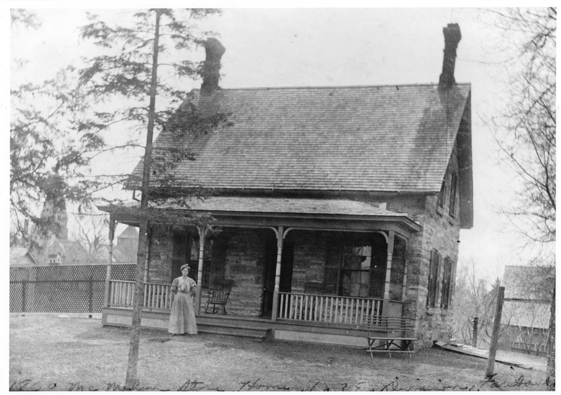
THOMAS MCMAHON HOUSE FARIBAULT RICE CO., MN