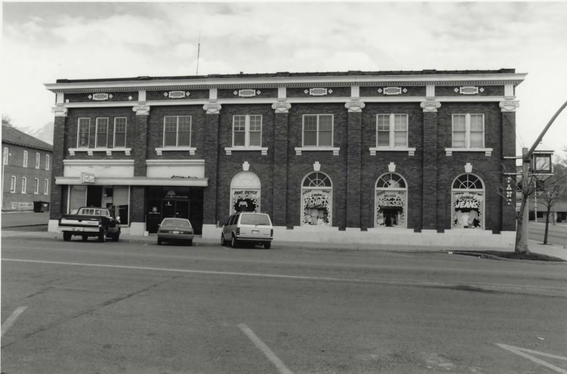
BANK OF AMERICAN FORK AMERICAN FORK, UTAH CO., UT PHOTO #2