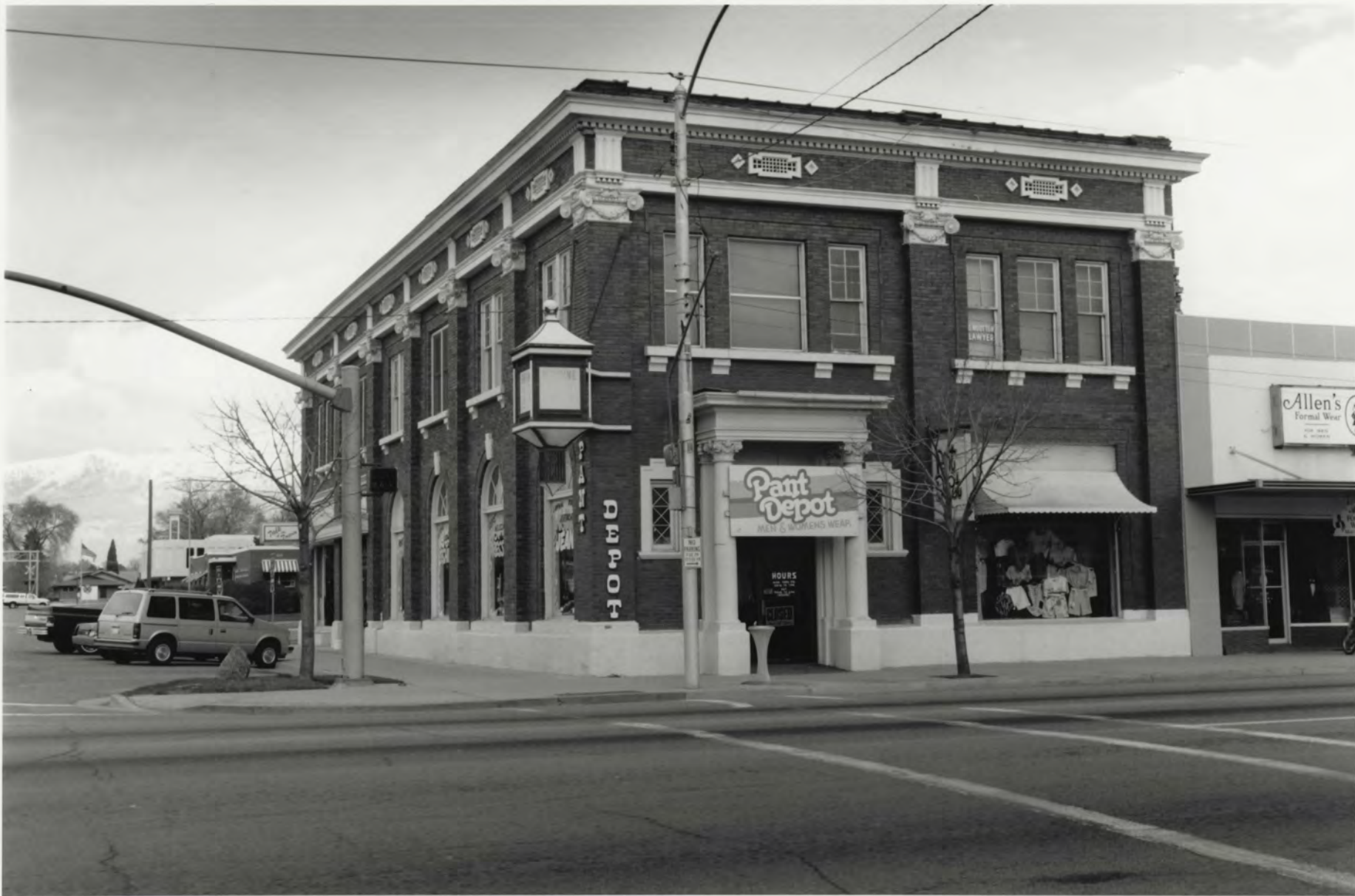
BANK OF AMERICAN FORK AMERICAN FORK, UTAH CO., UT PHOTO #1