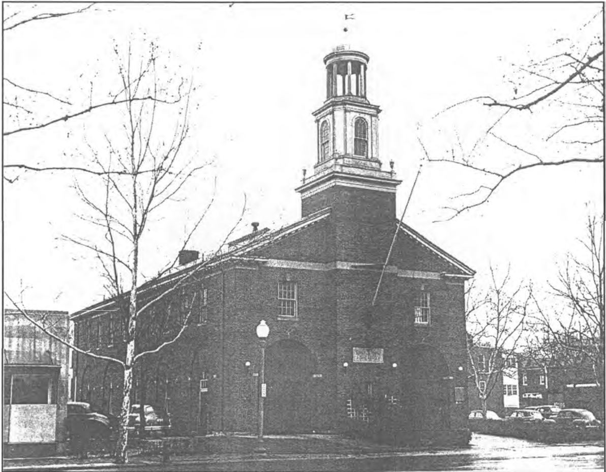
Historic Photo of Truck House No. 13 (circa 1950s)