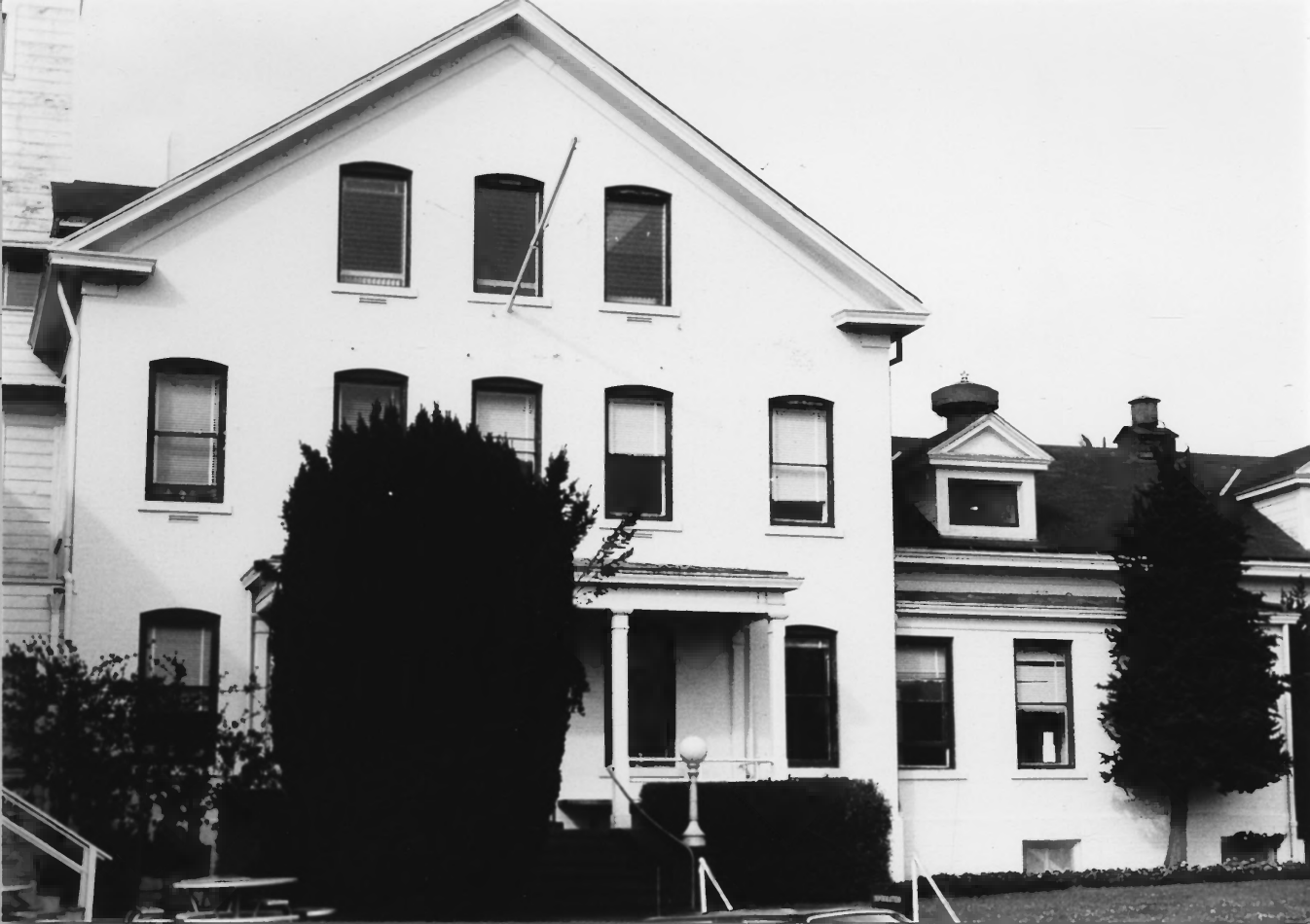
1. Brick portion of the headquarters building, San Francisco Port of Embarkation, Fort Mason. The U.S. Army constructed this unit as a posh hospital in 1902.