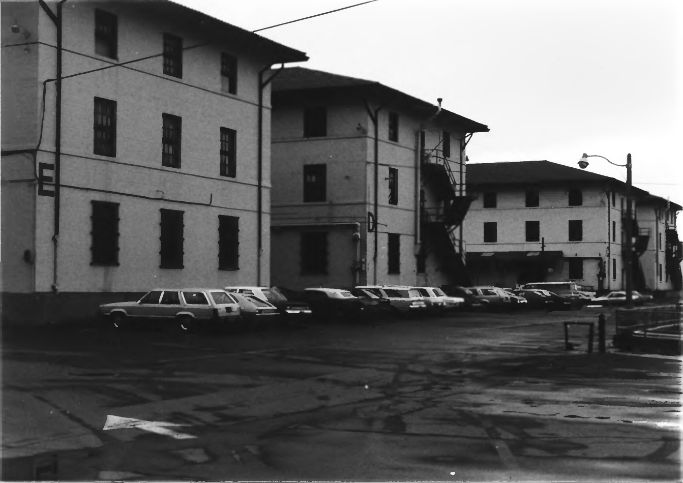
3. The four permanent army storehouses at the San Francisco Port of Embarkation in lower Fort Mason.