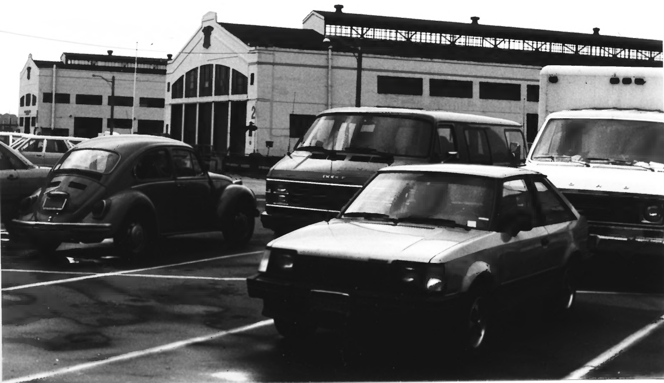
4. Piers 1, on left, and 2, San Francisco Ports of Embarkation. The shed on Pier 2 is the original, permanent shed. Pier 1's shed was reconstructed in the 1930s.