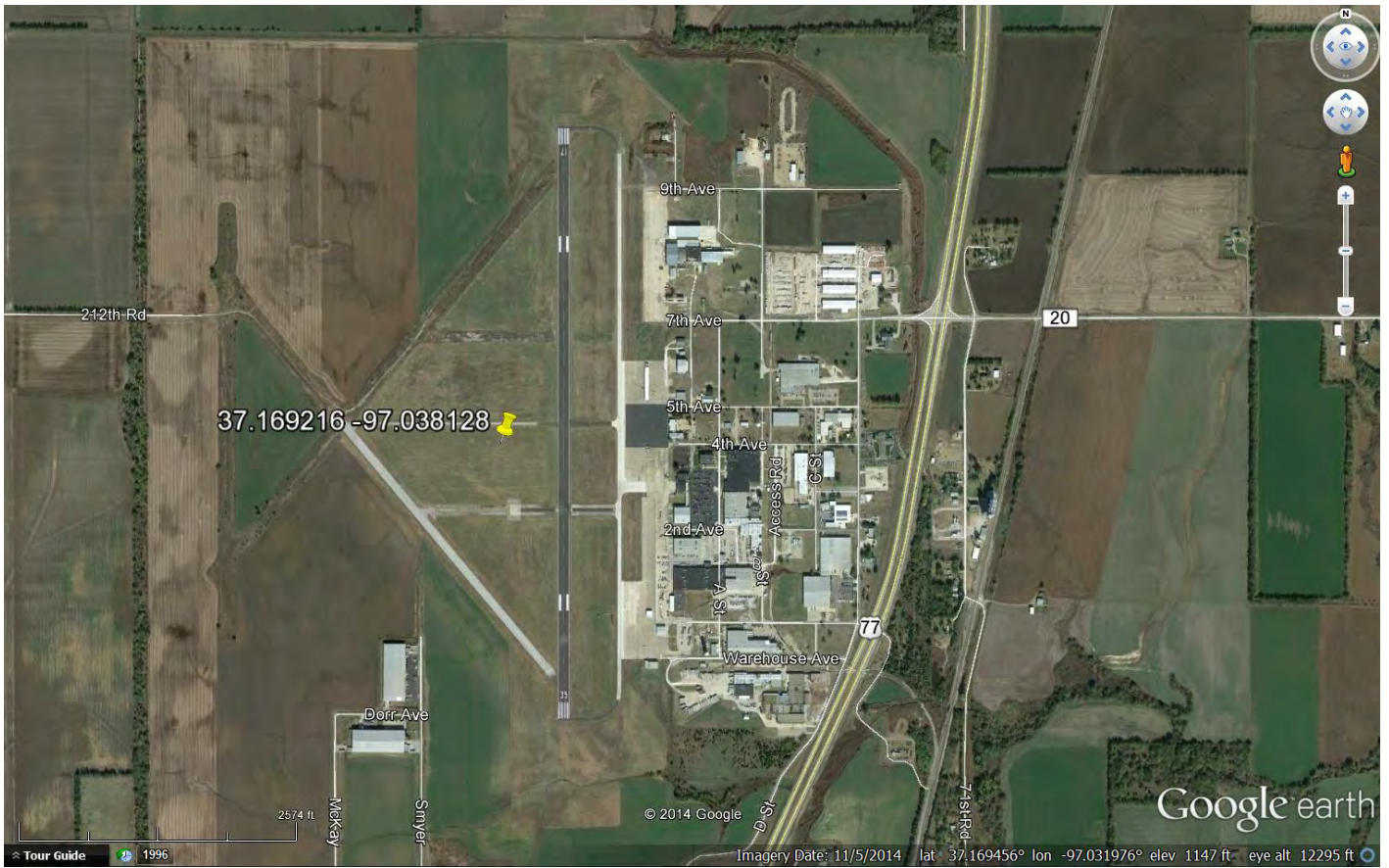
Figure 2: Close-in Aerial Image, Google Earth, 2014.