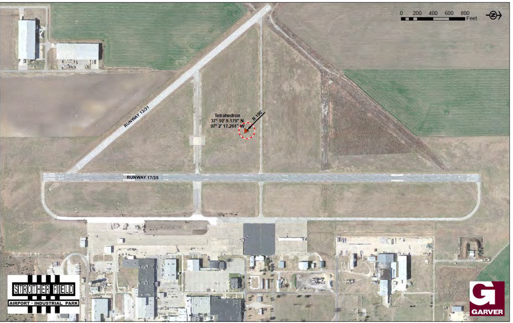
Figure 3: Aerial of Tetrahedron Location

Cowley County, Kansas _____ County and State