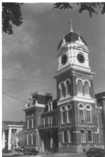
NEWTON COUNTY COURTHOUSE

This is one of half a dozen courthouses in the state built in the Second Empire Style or with Second Empire details, and one of the few built in the early 1880's that is still in use. Its site overlooking the town square makes it an architectural focal point for the city of Covington.