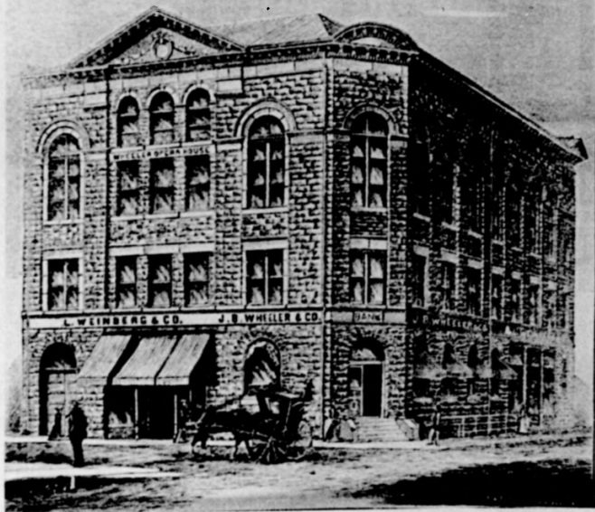
WHEELER OPERA HOUSE 1890