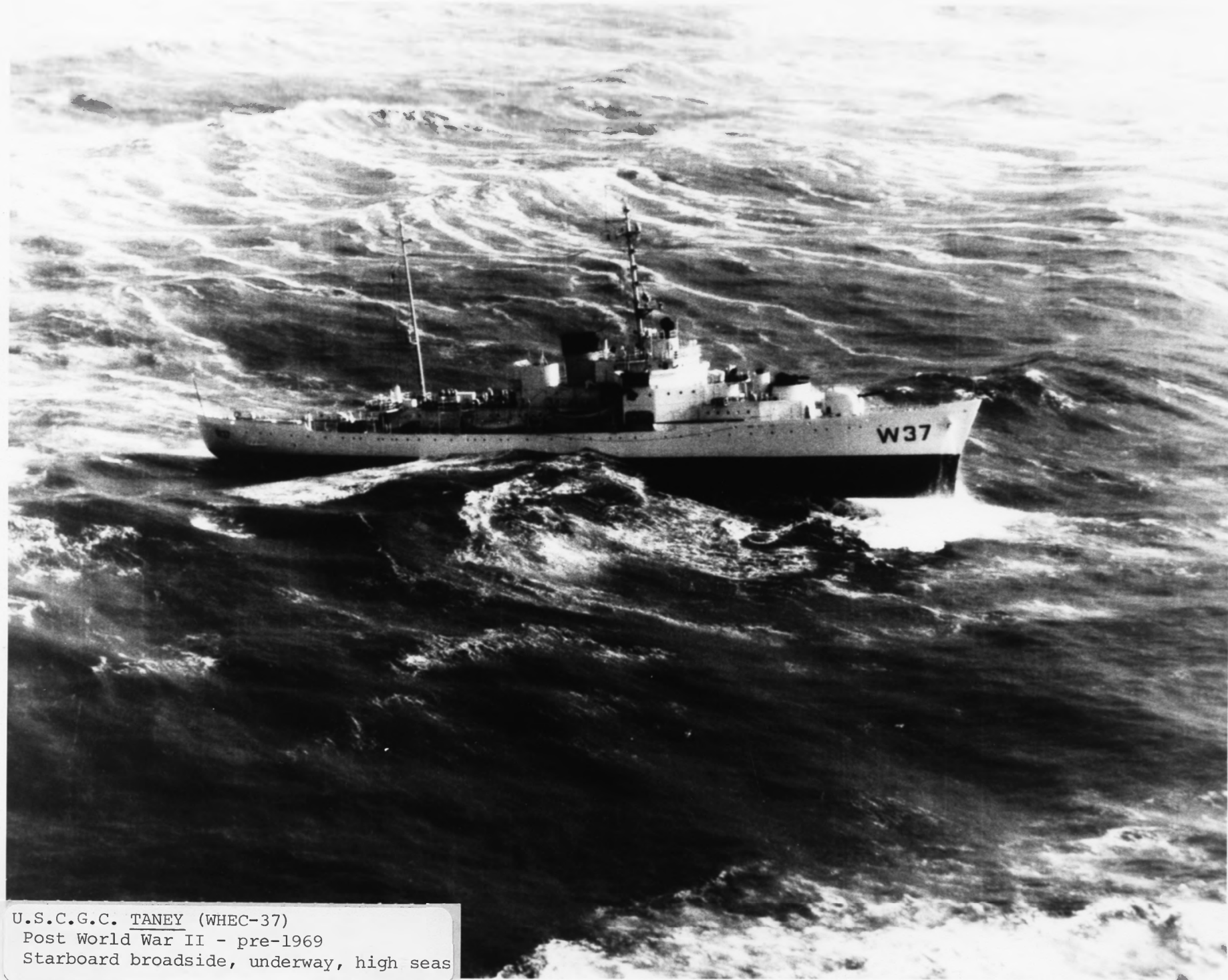
U.S.C.G.C. TANEY (WHEC-37) Post World War II - pre-1969 Starboard broadside, underway, high seas