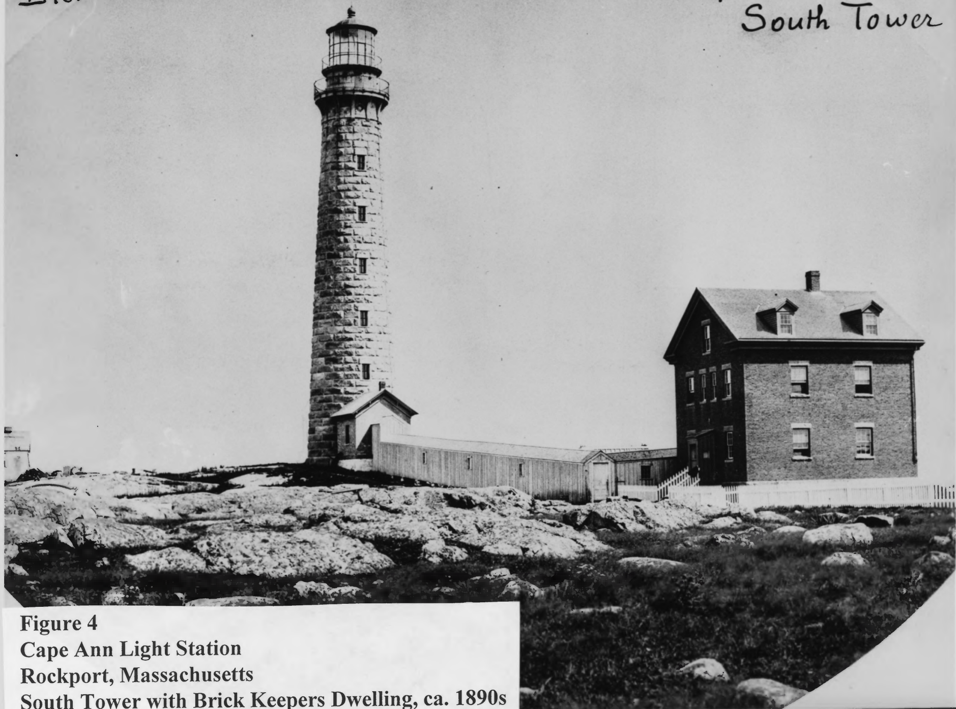
Figure 4 Cape Ann Light Station Rockport, Massachusetts South Tower with Brick Keepers Dwelling, ca. 1890s