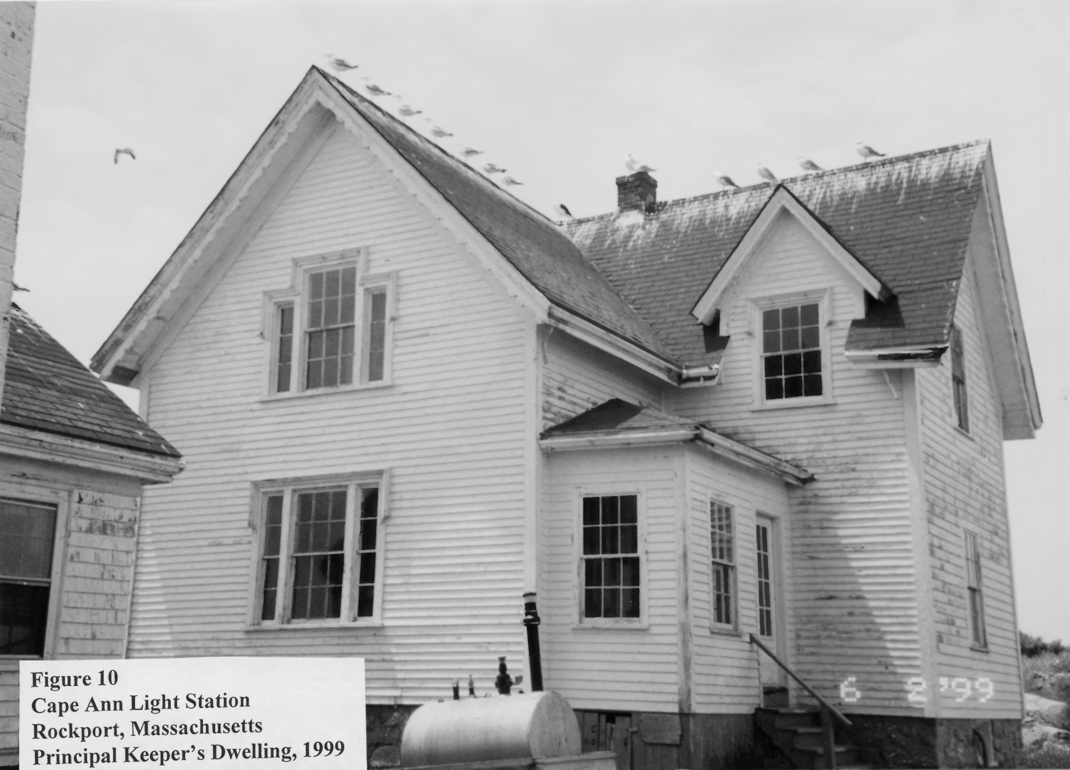
Figure 10 Cape Ann Light Station Rockport, Massachusetts Principal Keeper's Dwelling, 1999