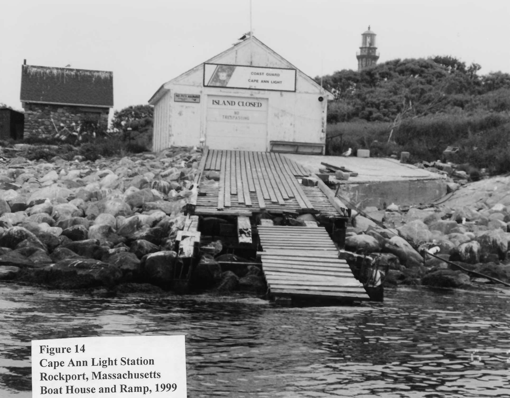
Figure 14 Cape Ann Light Station Rockport, Massachusetts Boat House and Ramp, 1999