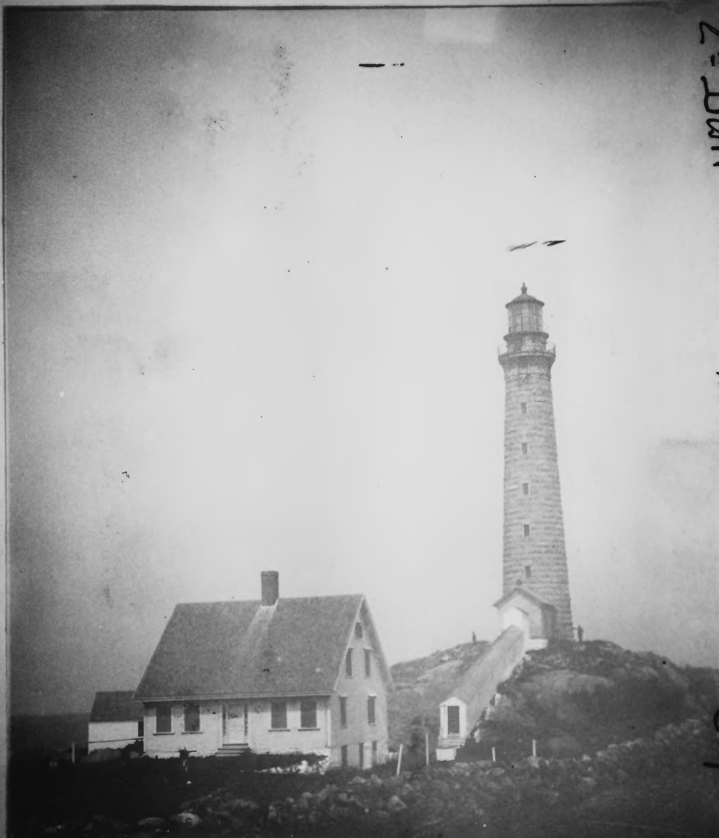
Figure 5 Cape Ann Light Station Rockport, Massachusetts North Tower with Wooden Keepers Dwelling, ca. 1900