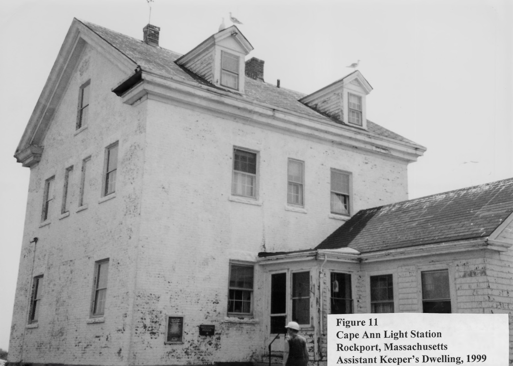
Figure 11 Cape Ann Light Station Rockport, Massachusetts Assistant Keeper's Dwelling, 1999