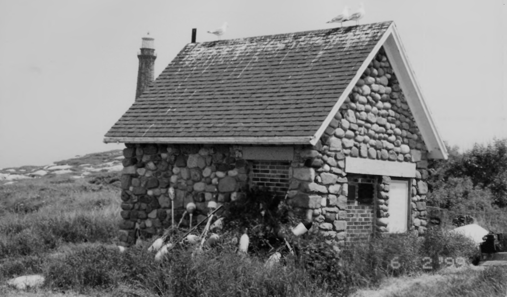
Figure 13 Cape Ann Light Station Rockport, Massachusetts Utility Building, 1999