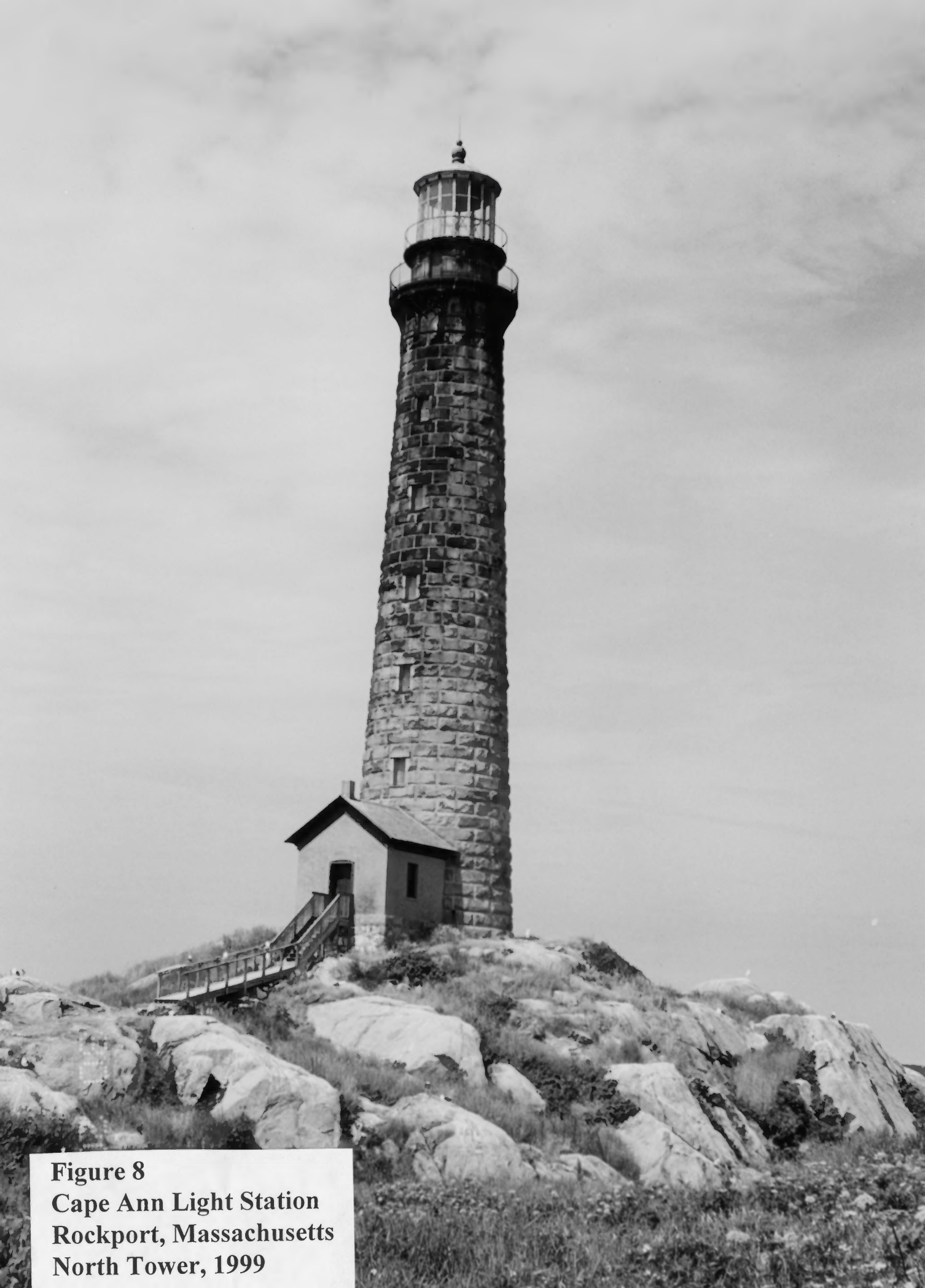
Figure 8 Cape Ann Light Station Rockport, Massachusetts North Tower, 1999