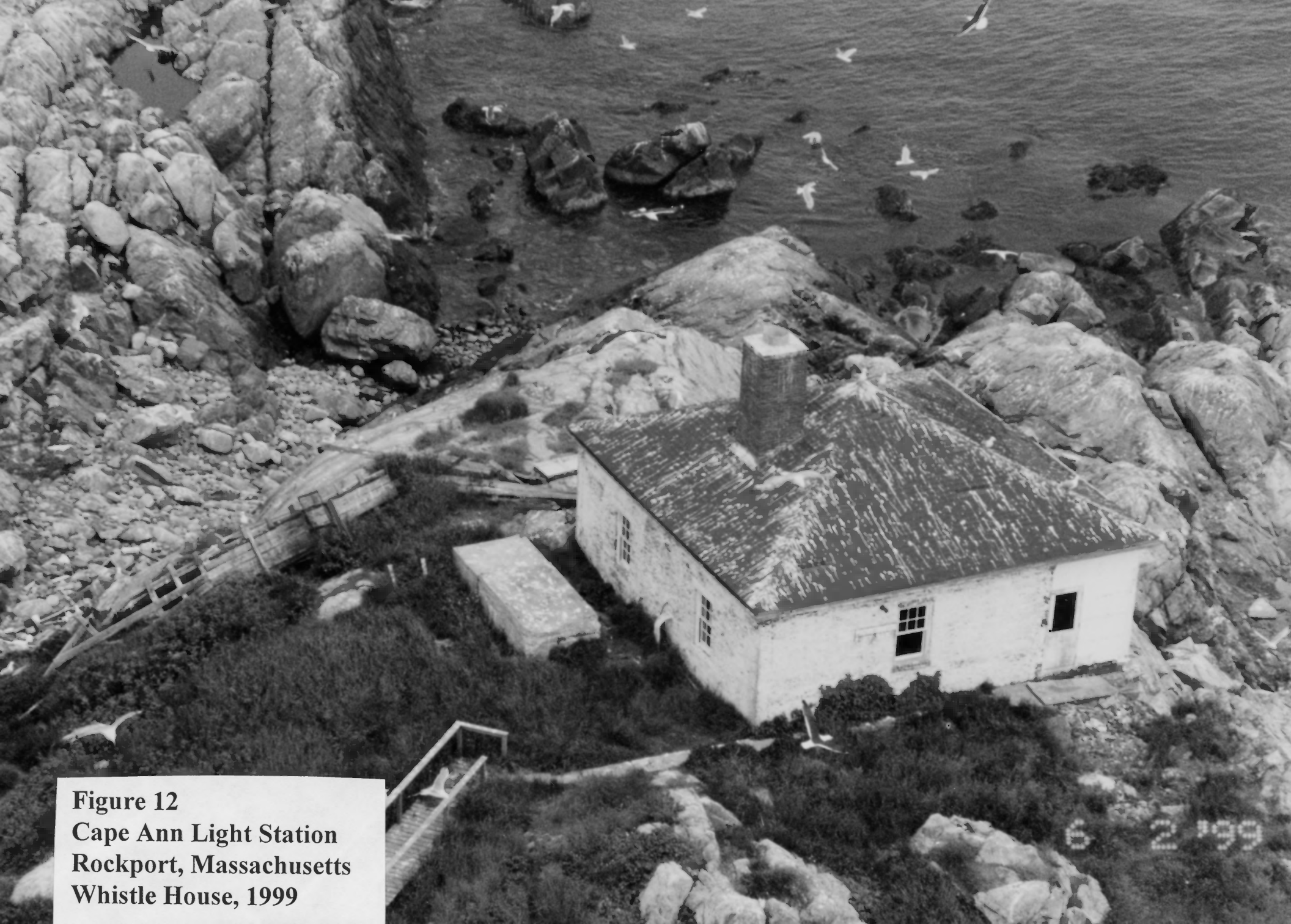
Figure 12 Cape Ann Light Station Rockport, Massachusetts Whistle House, 1999