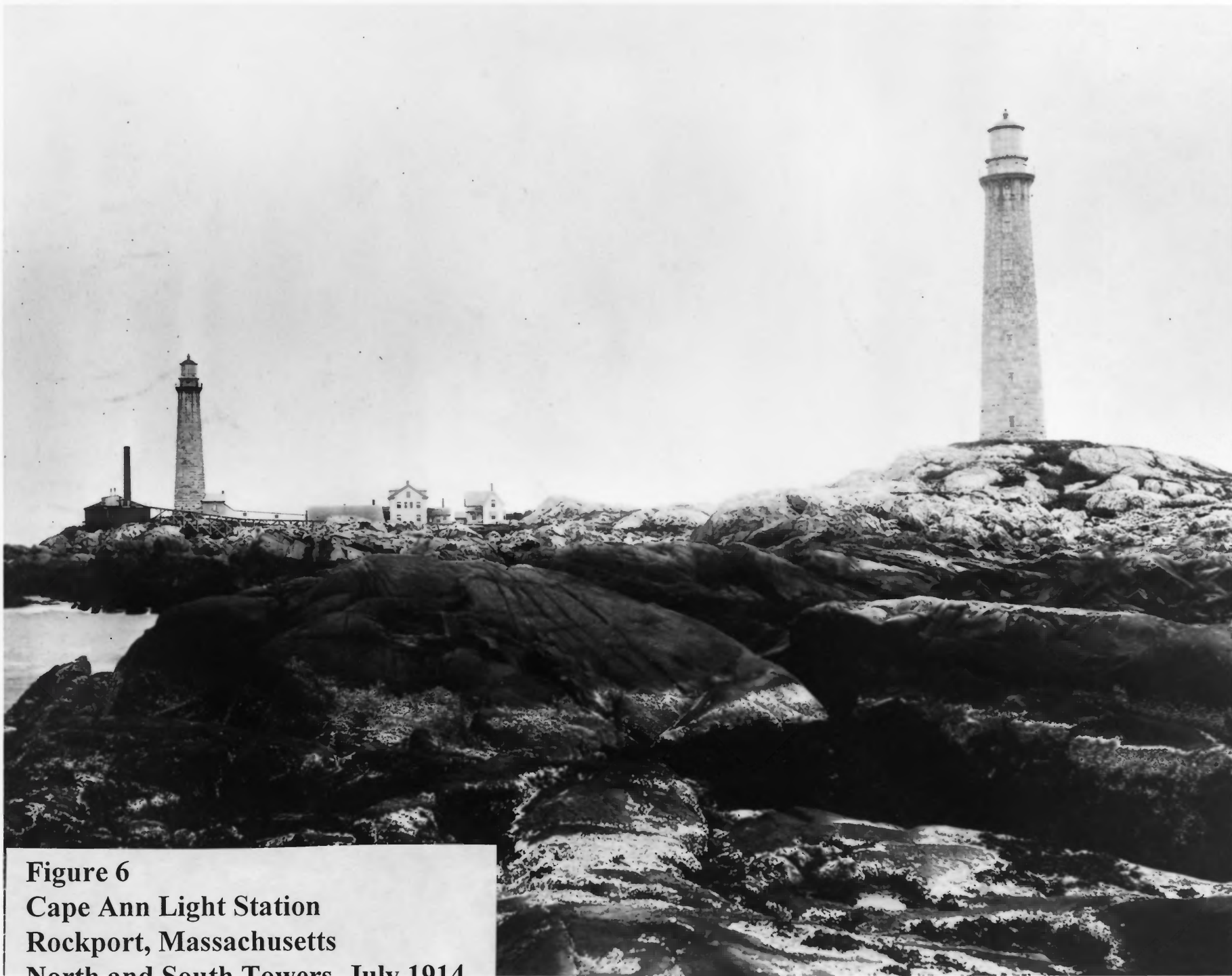
Figure 6 Cape Ann Light Station Rockport, Massachusetts North and South Towers, July 1914