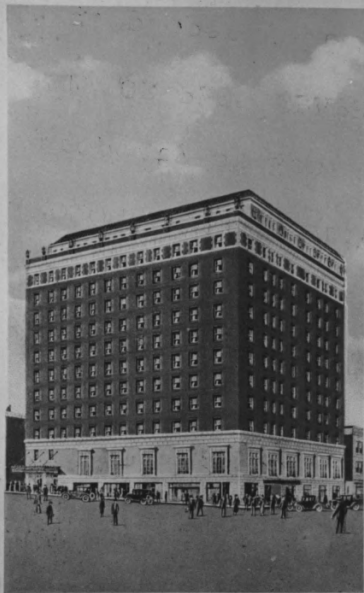
THE NEW JAY-HAWK HOTEL, TOPEKA, KANSAS.