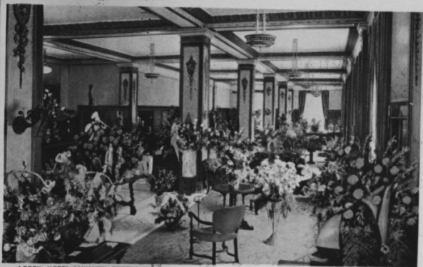
LOBBY, HOTEL JAYHAWK, TOPEKA, KANSAS.