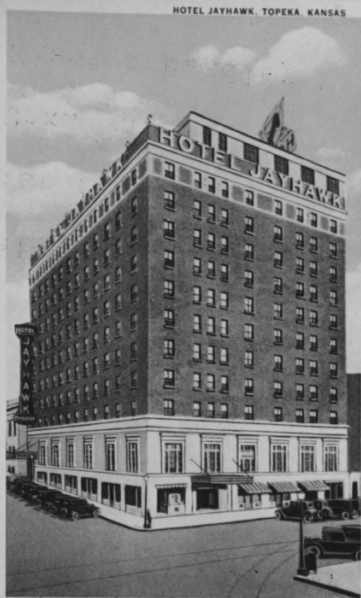
HOTEL JAYHAWK, TOPEKA, KANSAS