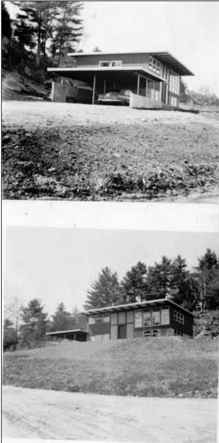
112 Hopson Road (HD #3)