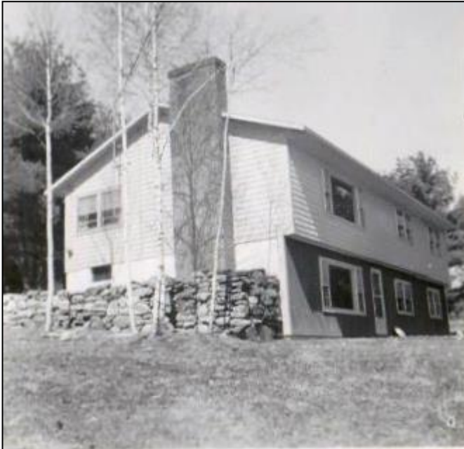
70 Pine Tree Road (HD #12)