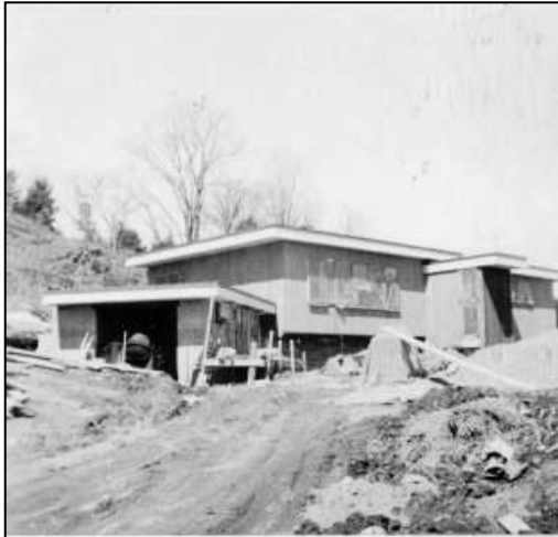
96 Hopson Road (HD #2)