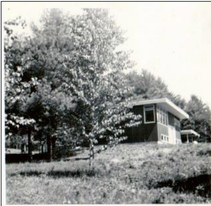
24 Pine Tree Road (HD #8)