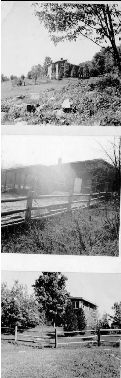
163 (top and bottom) & 149 (center) Hopson Road (HD #5 & #4)