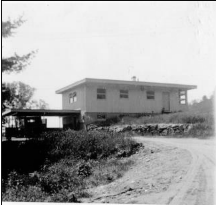
27 Hillside Road (HD #1)

Documentation from lister cards of the mid-1950s to mid-1960s in the collection of the Norwich Historical Society.