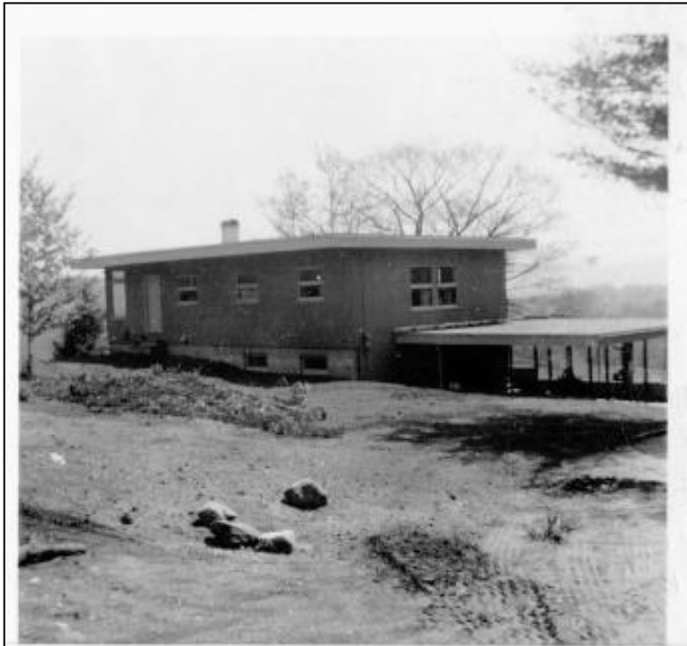
48 Pine Tree Road (HD #9)