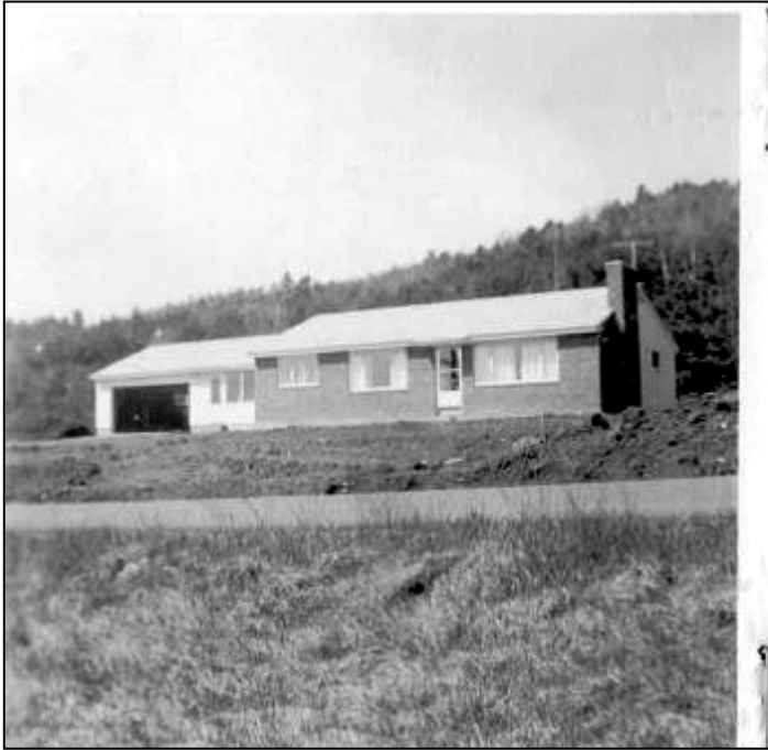
21 Pine Tree Road (HD #7)