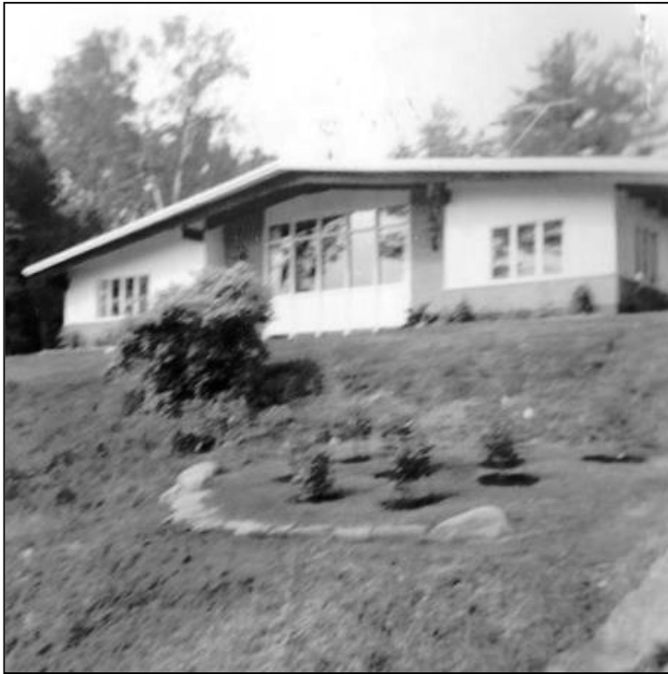
7 Pine Tree Road (HD #6)