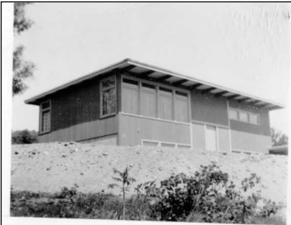
60 Pine Tree Road (HD #11)