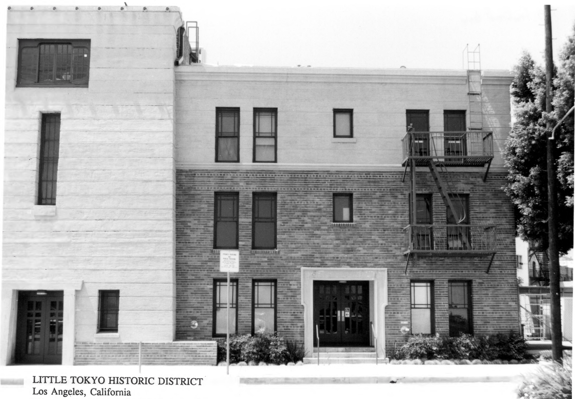
LITTLE TOKYO HISTORIC DISTRICT Los Angeles, California Hompa Hongwani Buddhist Temple (13), Central Avenue temple office section