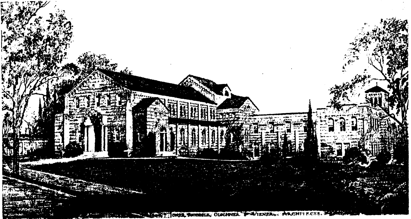
RENDERED PERSPECTIVE SHOWING FINAL DEVELOPMENT KINGS HIGHWAY CHRISTIAN CHURCH, SHREVEPORT, LA. JONES, ROSSILE, OLSCHNER & WIENER, ARCHITECTS (See plan on back)

Kings Highway Christian Church, Shreveport, Caddo Parish, LA Section number 7 Page 2