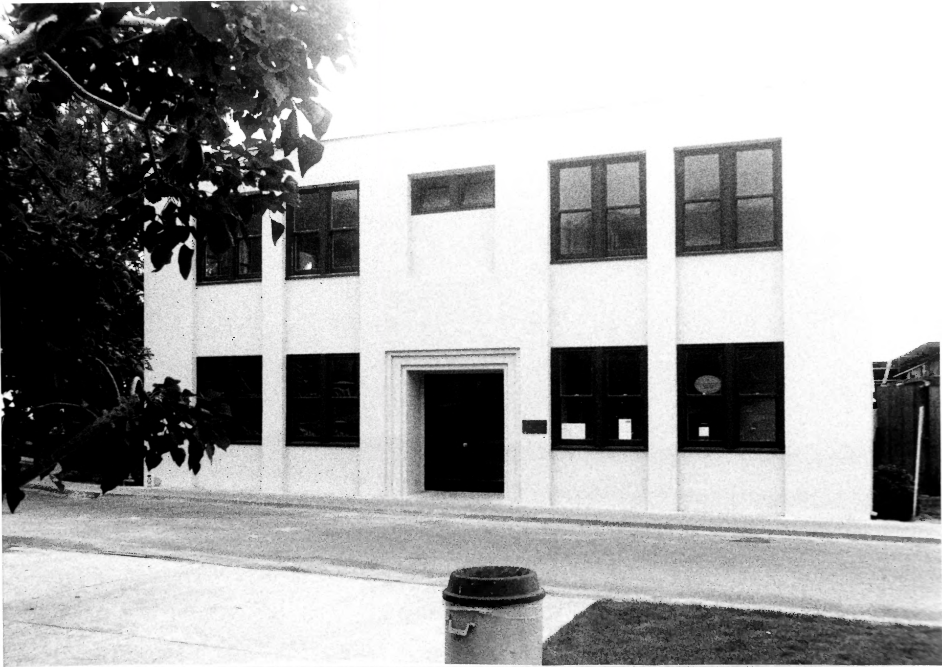
East facade, from site of Library-Museum. (1980)