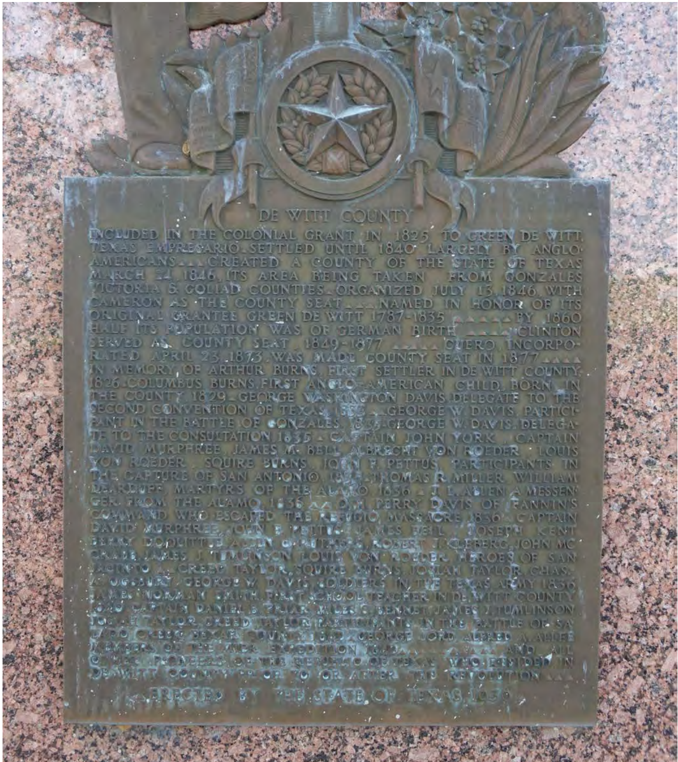
Photo 4: DeWitt County Monument plaque detail—camera facing west, February 16, 2018. The monument marker text outlines county history.