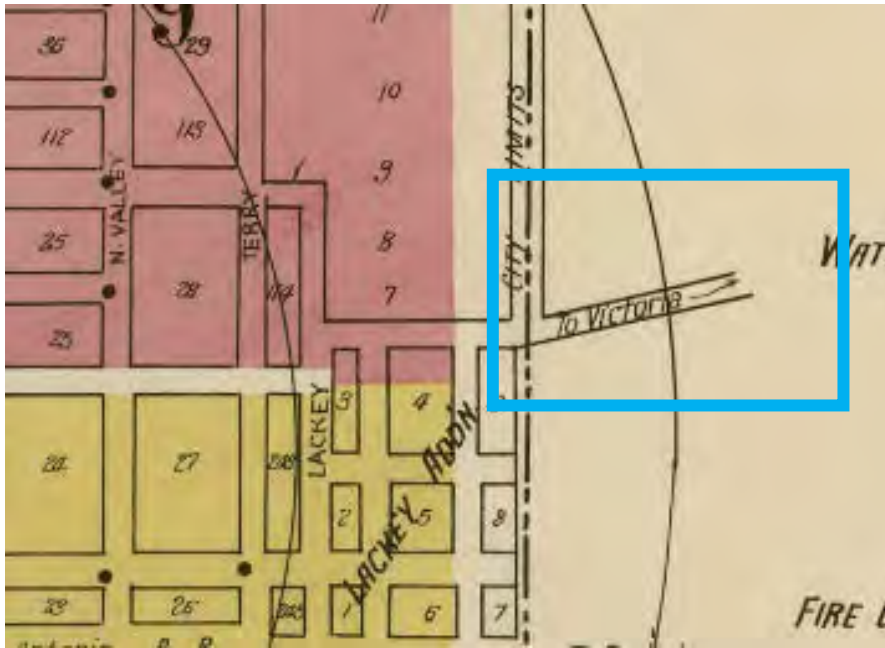
Figure 2: Sanborn Fire Insurance Map, 1950. The later map of the same area shows the 1931 highway junction (within the blue box) that created the triangular parcel where the nominated monument (star) is located.