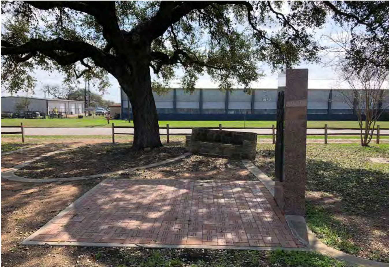
Photo 5: DeWitt County Monument side elevation—camera facing south, February 16, 2018.