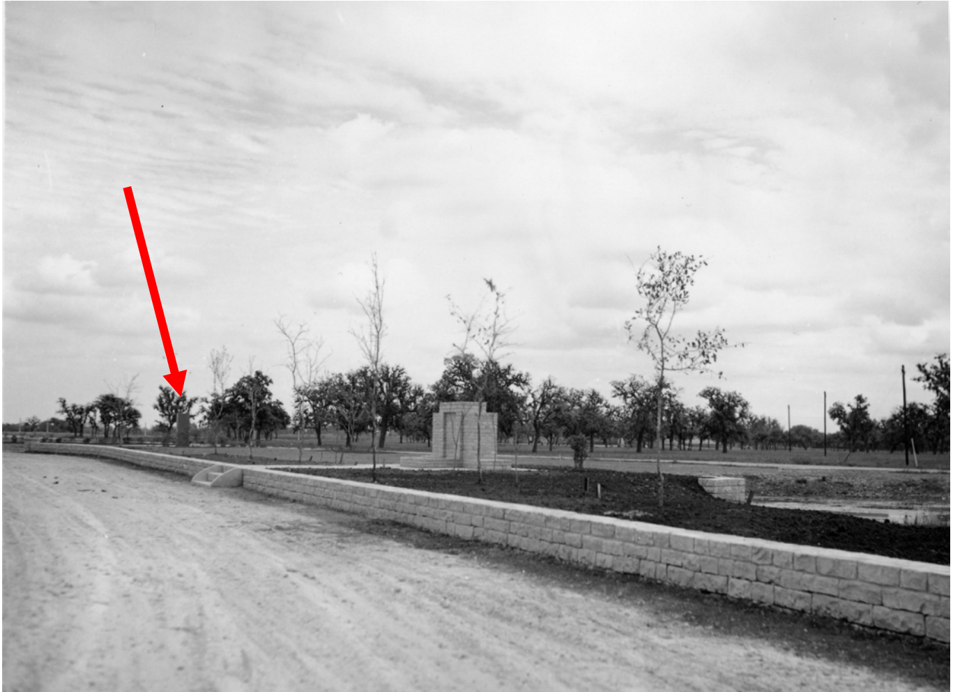
Figure 4: Looking southeast at the DeWitt County roadside park showing NYA-constructed retaining walls and fountain. Both features are currently intact, although Cueroans transformed the fountain into a statuary base circa 2010. The DeWitt Monument is in the background, indicated by the red arrow.