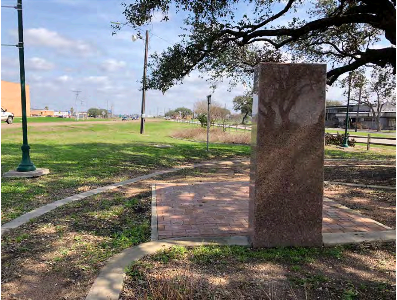
Photo 6: DeWitt County Monument back elevation—camera facing east, February 16, 2018. The monument was historically part of a landscape design plan implemented by the Texas Highway Department for roadside parks. Until 2012, a turnout between the highway junctions ran in front of the nominated property.