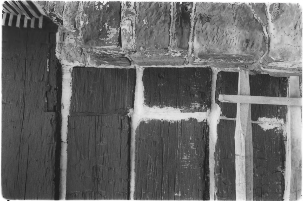
RICHARD LIEBER LOG CABIN, PARKE CNTY, IN #15