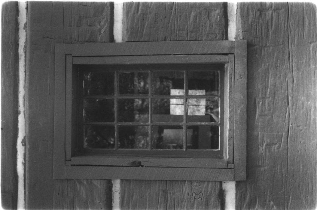
RICHARD LIEBER LOG CABIN, PARKE CNTY, IN #9