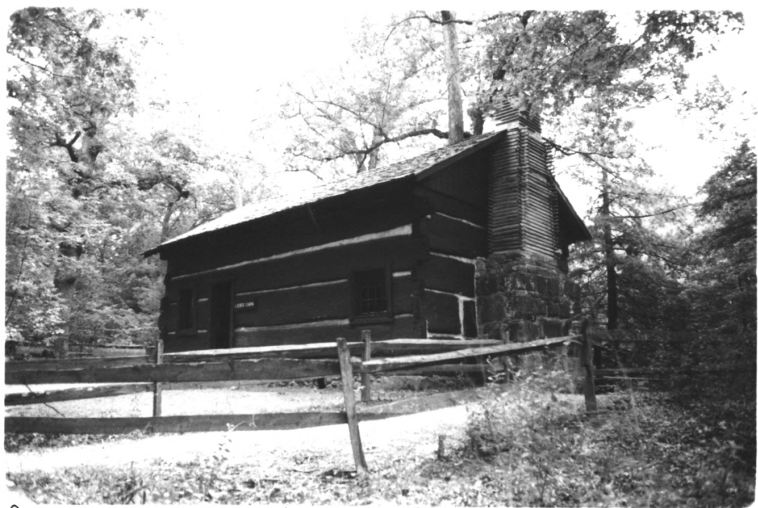
RICHARD LIEBER LOG CABIN, PARKE CNTY, IN # 1