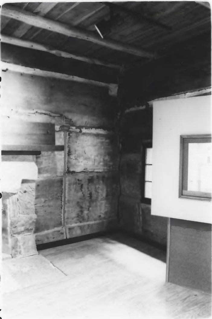
RICHARD LIEBER LOG CABIN, PARKS CNTY, IN #20