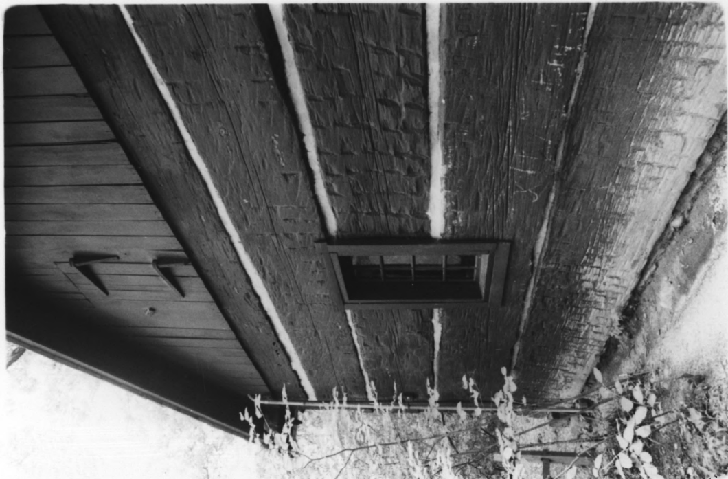
RICHARD LIEBER LOG CABIN, PARKE CNTY, IN #11