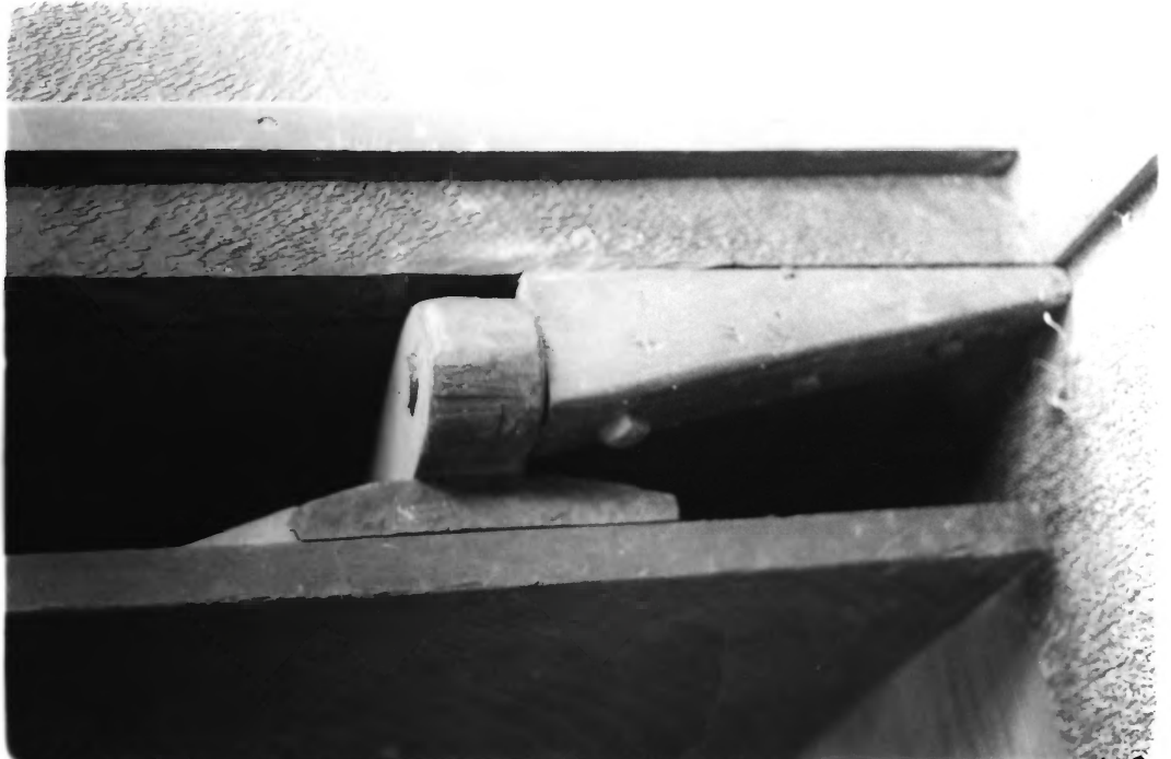
RICHARD LIEBER LOG CABIN, PARKE CNTY, IN # 23