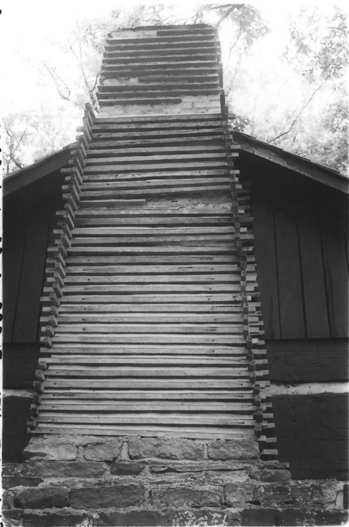
RICHARD LIEBER LOG CABIN, PARKE CNTY, IND #12