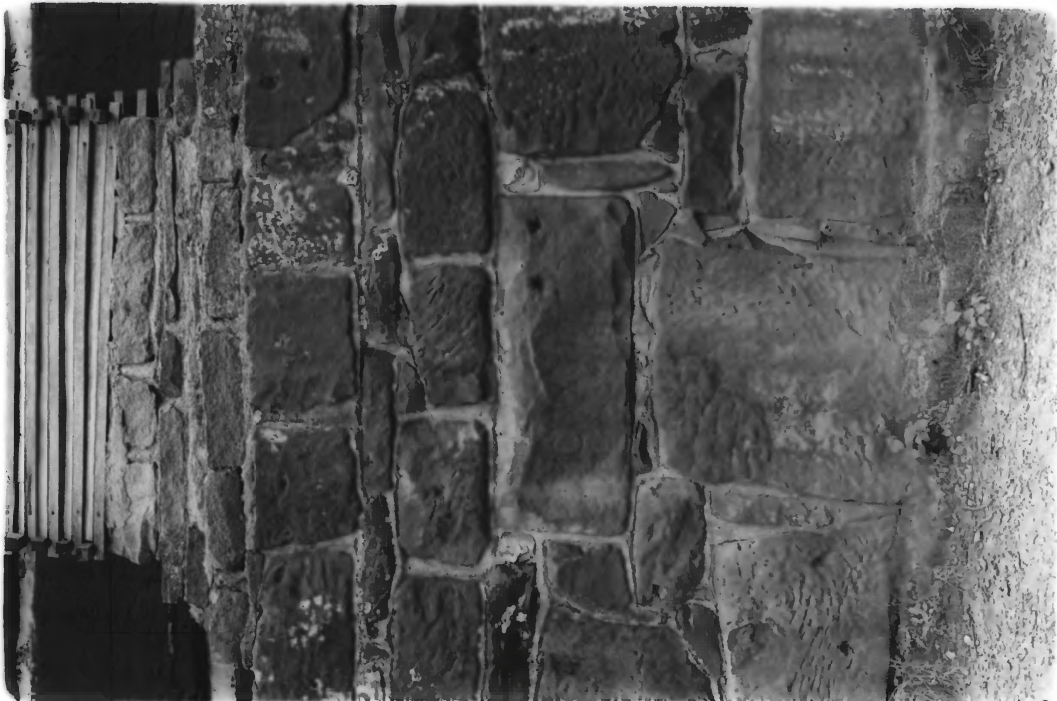
RICHARD LIEBER LOG CABIN, PARKE CNTY, IN # 13