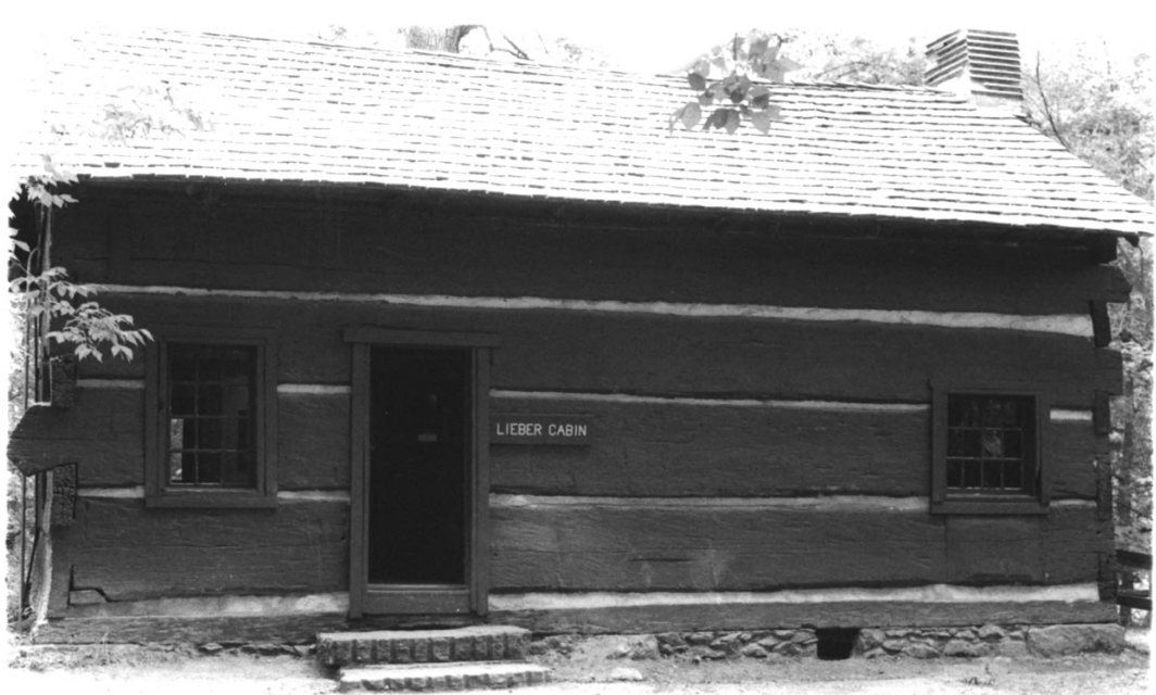
RICHARD LIEBER LOG CABIN, PARKE CNTY, IN # 2