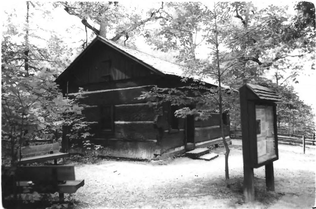
RICHARD LIEBER LOG CABIN, PARKE CNTY, IN #3