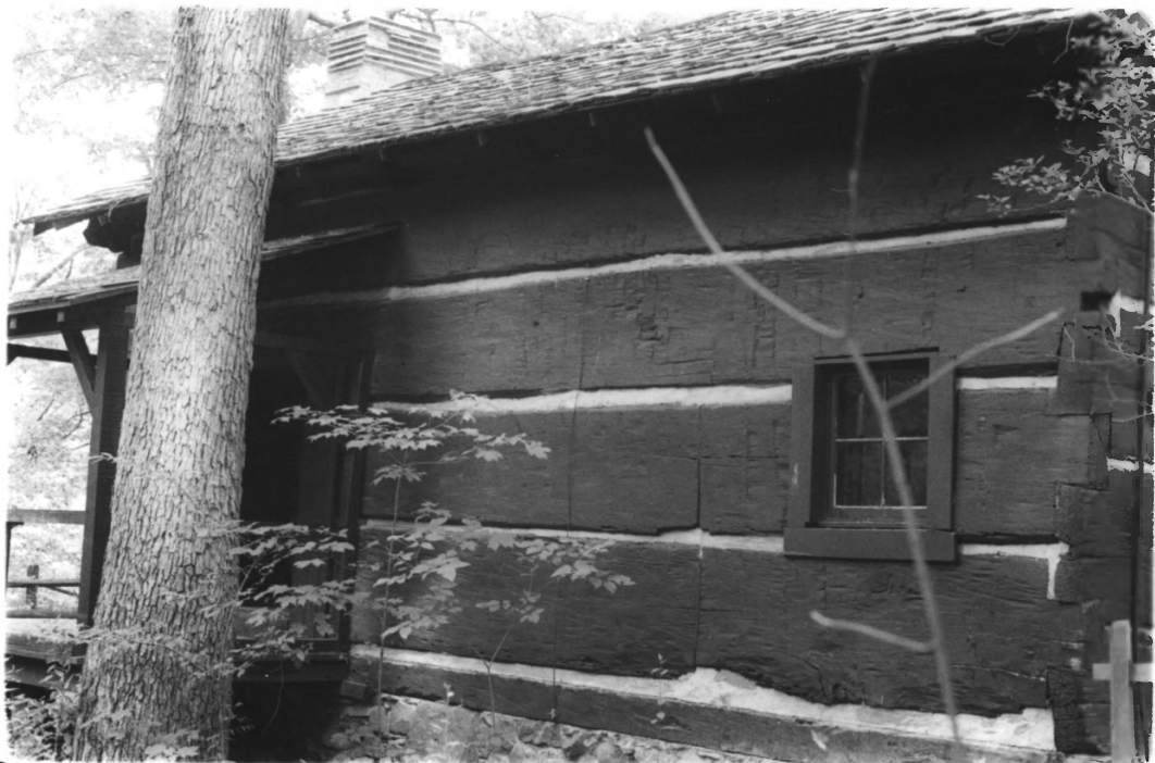
RICHARD LIEBER LOG CABIN, PARKE CNTY, IN #4