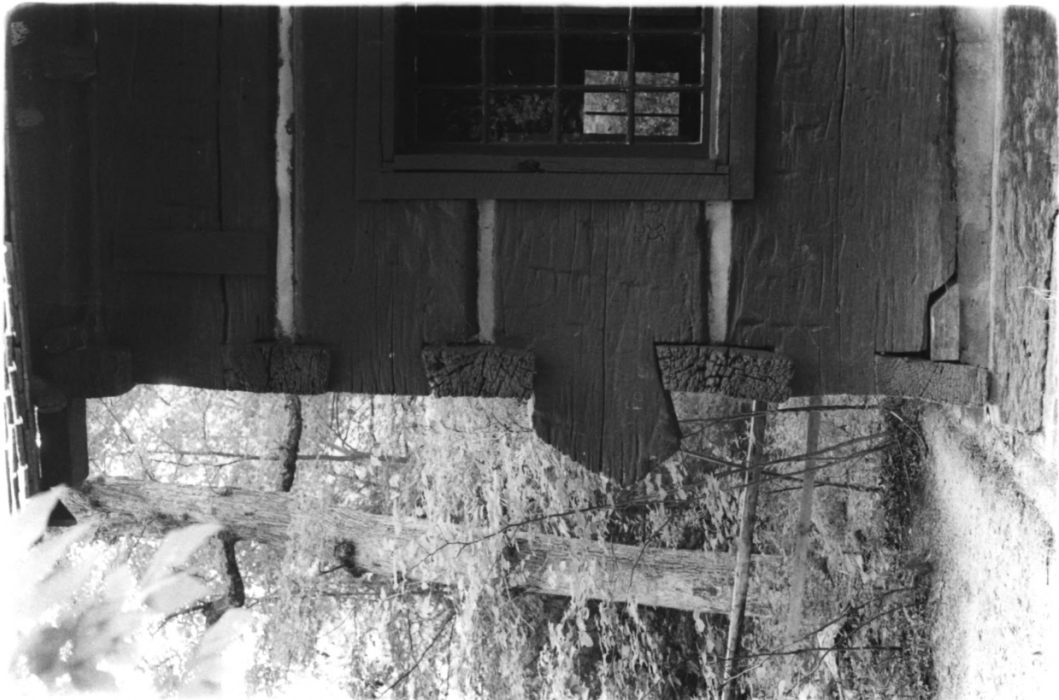
RICHARD LIEBER LOG CABIN, PARKE CNTY, IN # 10