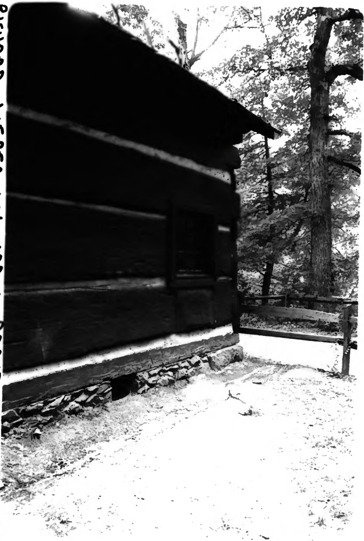
RICHARD LIEBER VOL CABIN, PARK CUSTY IN #16