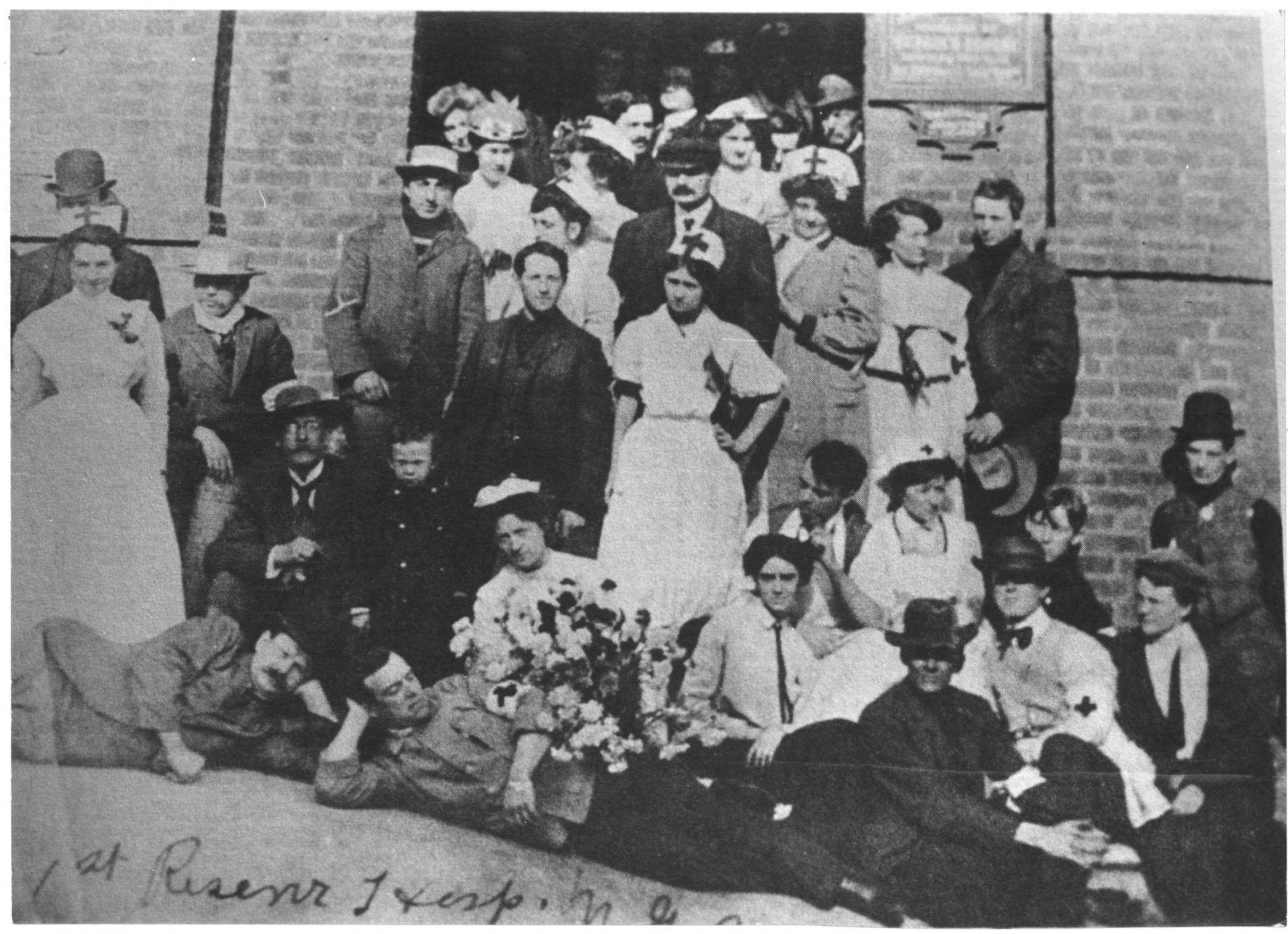
at Reserve Hosp. in a