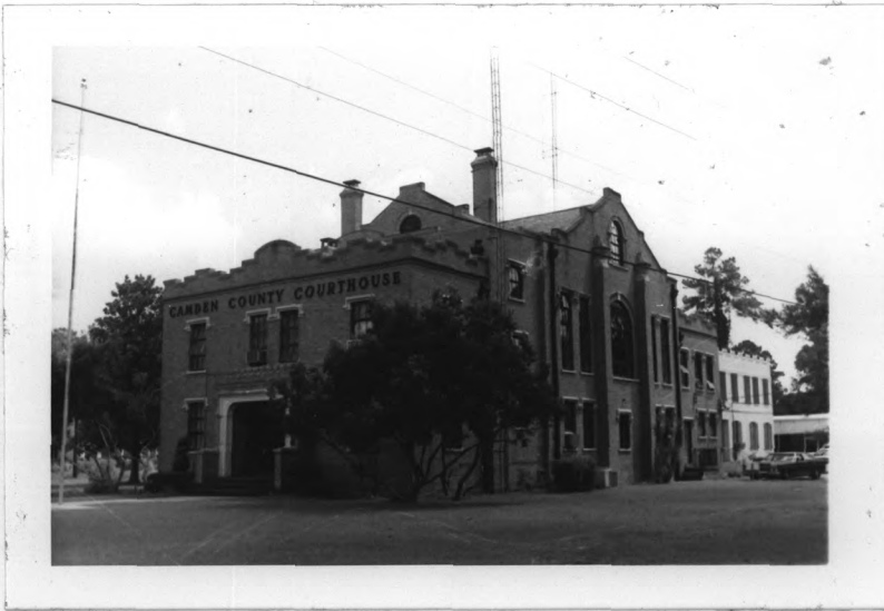
CAMDEN COUNTY COURTHOUSE

This is the only 20th century Gothic Revival courthouse in Georgia. Its picturesque architecture and its location on a square of scrub pines and palm trees are significant.