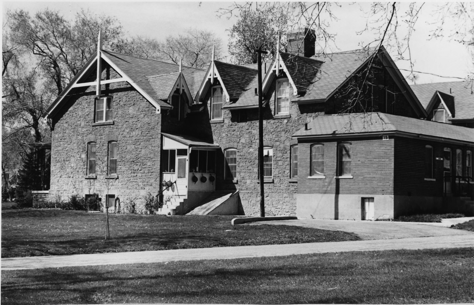
Fort Douglas, (Sandstone Officers' Duplexes), Salt Lake City, Utah