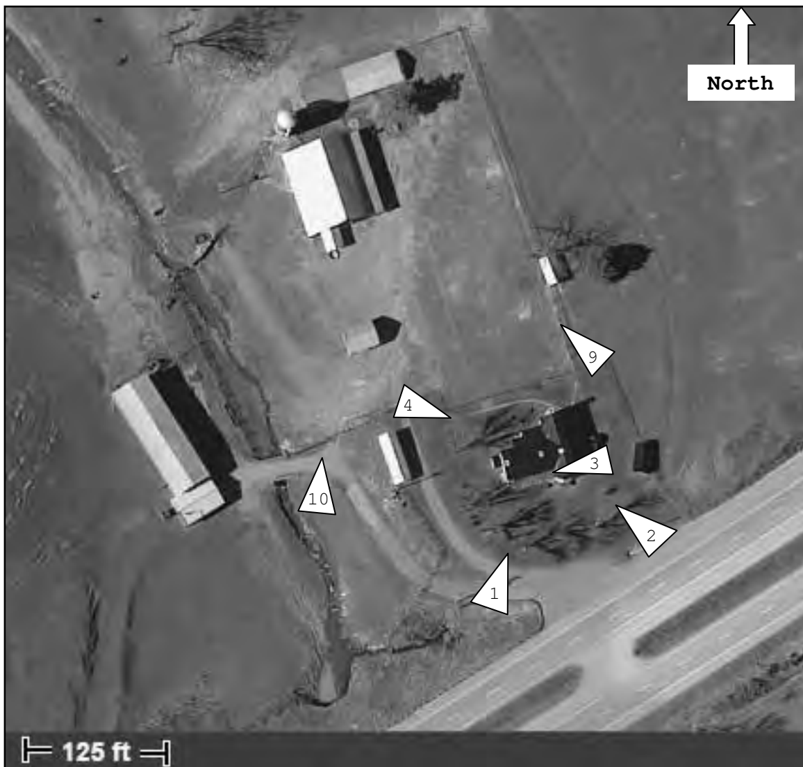
PHOTO KEY. [Number and direction of exterior photos only indicated by numbered arrows.]