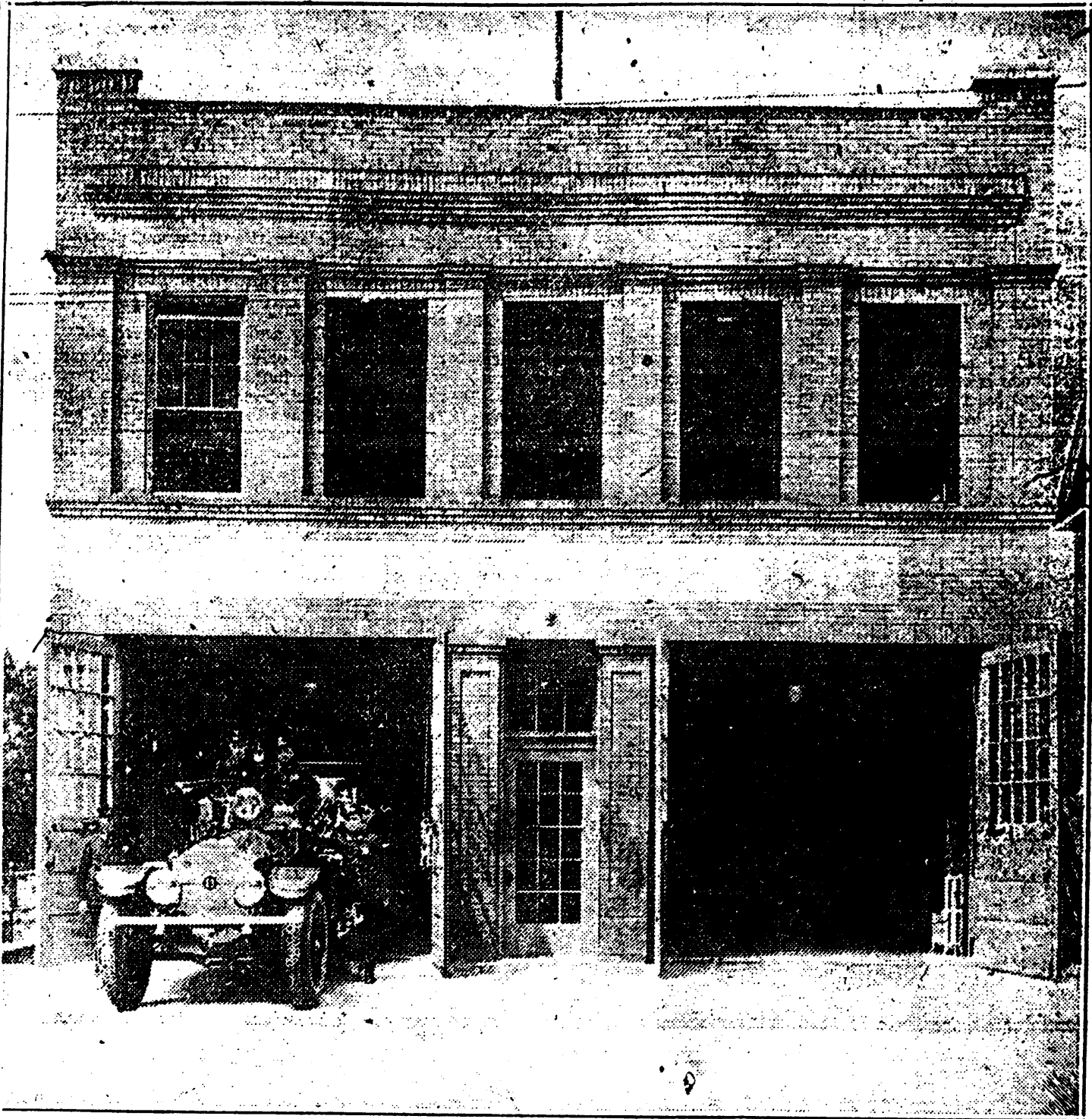
The new Warwood fire station known officially as Fire Department No. 11, will be formally opened tonight with a program arranged by Warwood citizens.

A beautiful American flag presented by the citizens of Warwood will be unfurled over the Ninth Warwood Fire Engine House this evening. The department is known as Number 11.