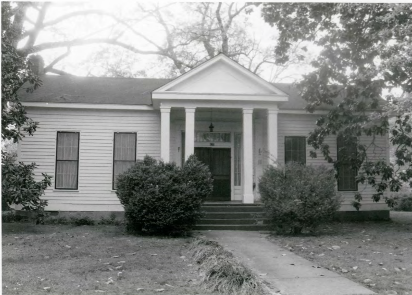
Cl-29 Marston House 429 Main HISTORIC RESOURCES OF CLARENDON Negatives at AHPP Viewed from the East