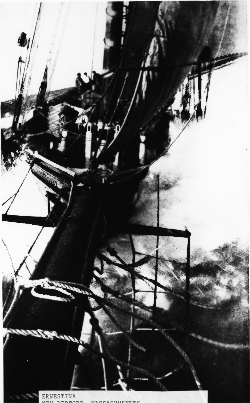
ERNESTINA NEW BEDFORD, MASSACHUSETTS Owner: SCHOONER ERNESTINA COMMISSION MORRISSEY DRIVING ALONG ON THE BANKS, 1913.