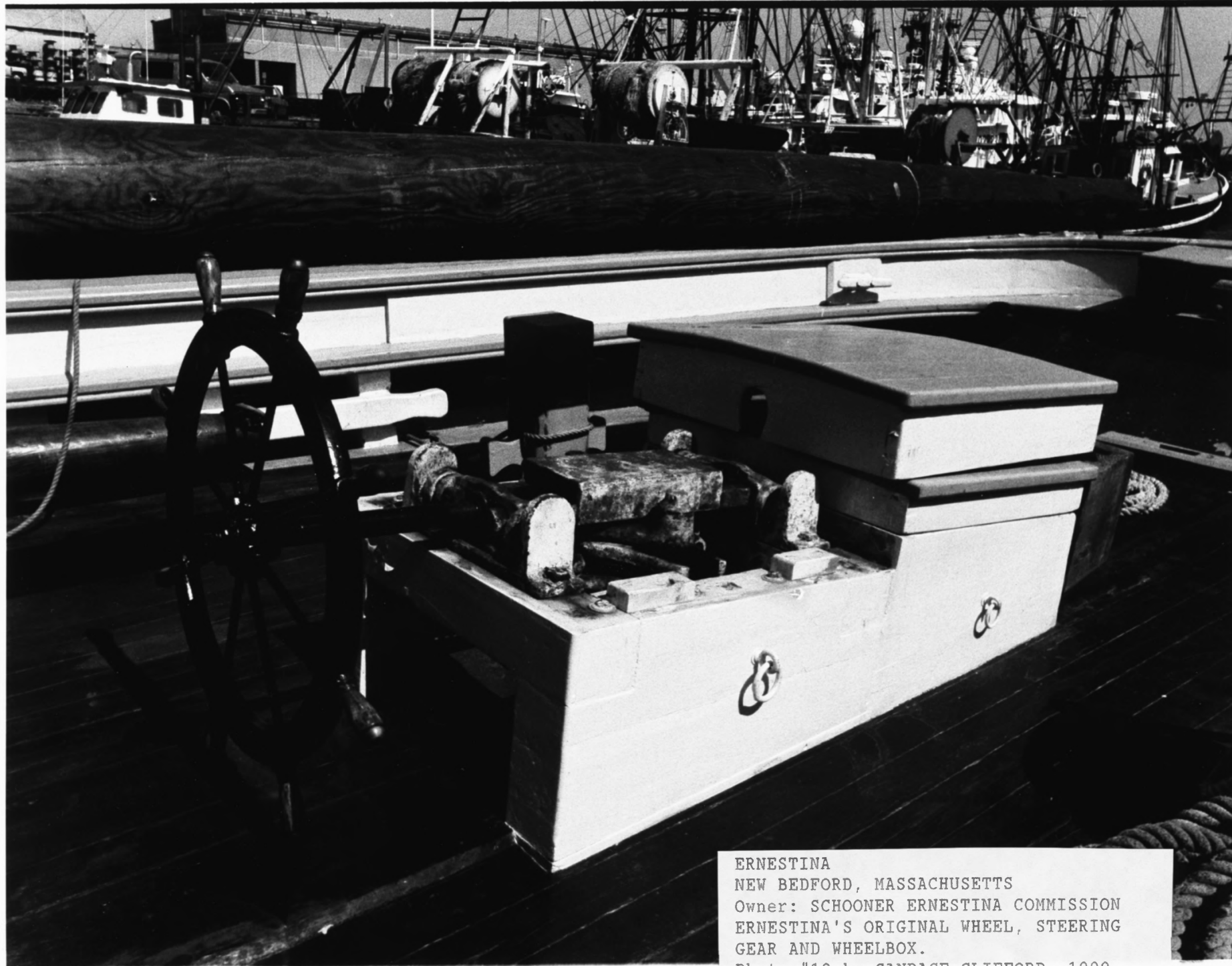
ERNESTINA NEW BEDFORD, MASSACHUSETTS Owner: SCHOONER ERNESTINA COMMISSION ERNESTINA'S ORIGINAL WHEEL, STEERING GEAR AND WHEELBOX.