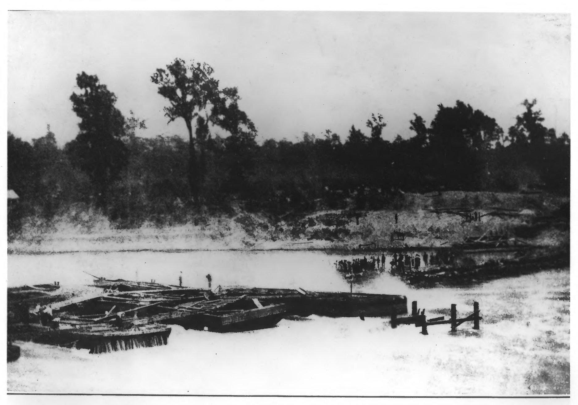
SECTION OF RED RIVER DAM.