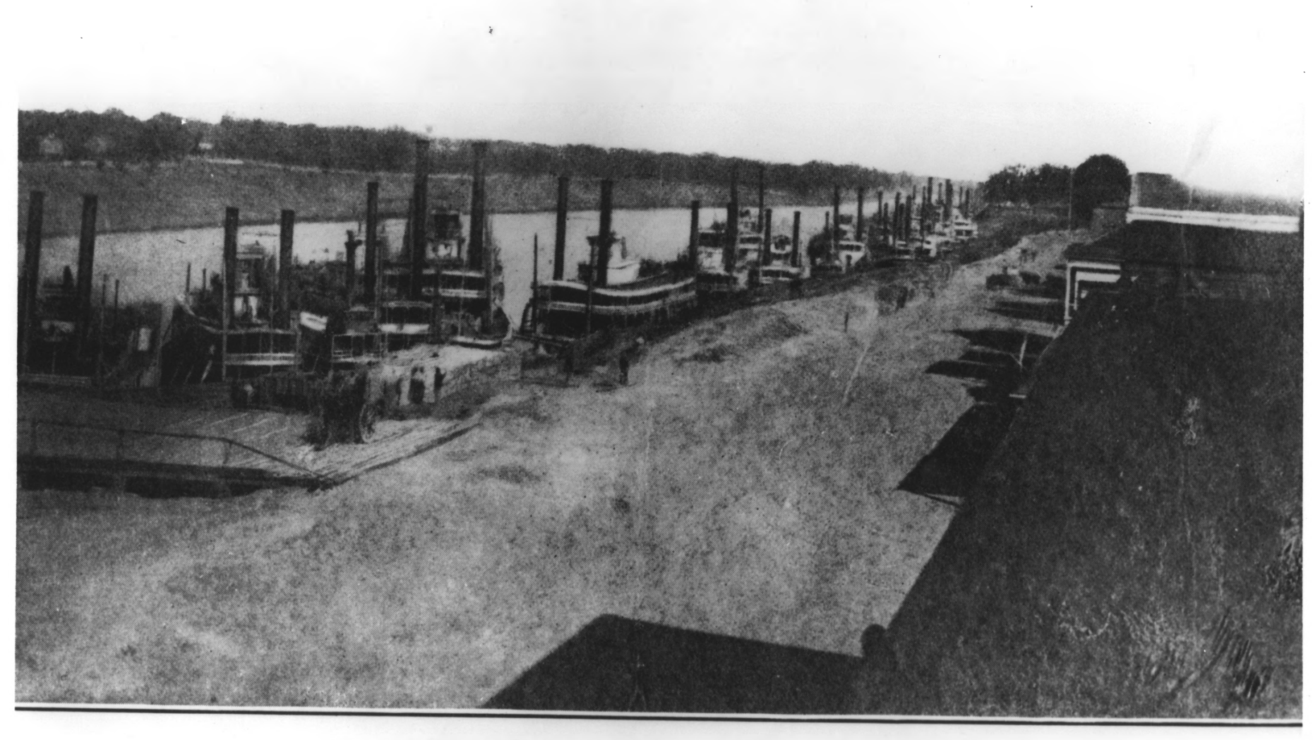
UNITED STATES FLEET IN RED RIVER AT ALEXANDRIA, LA.