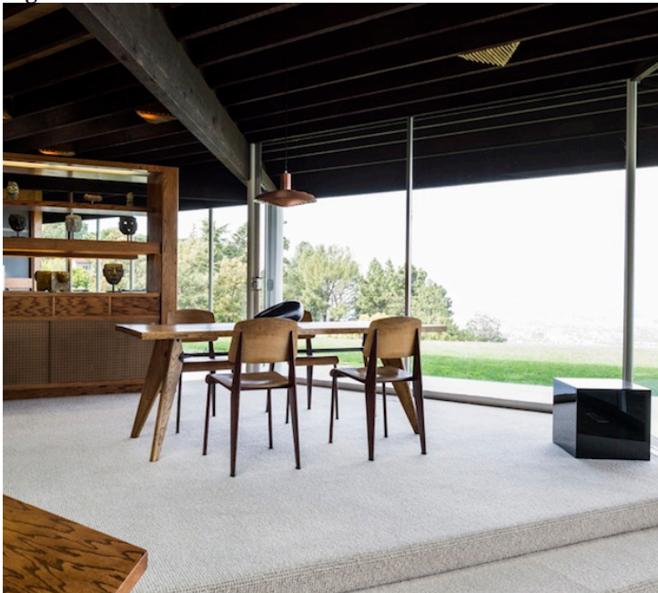
Interior detail of dining room (© The John Lautner Foundation, courtesy of Frank Escher, date of photograph unknown)