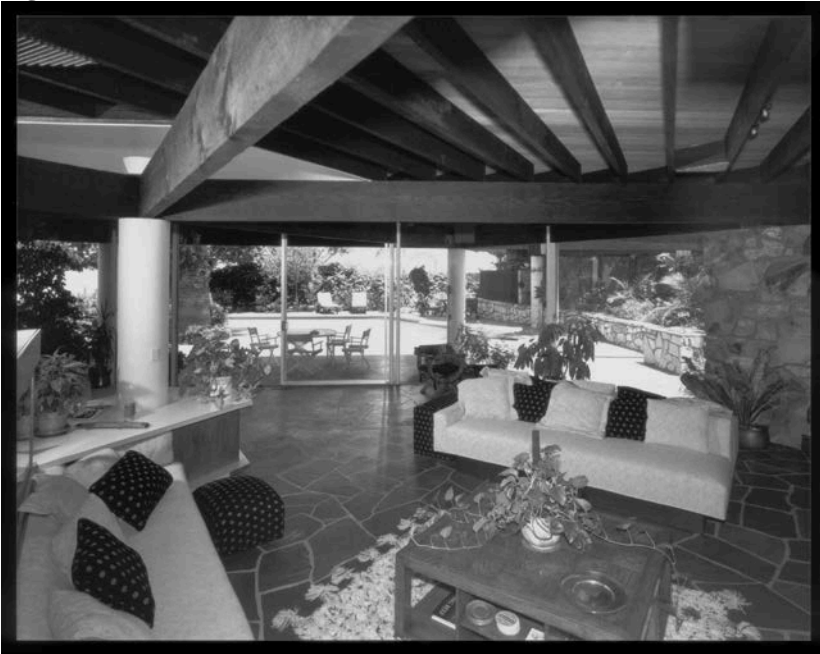
Detail of living room