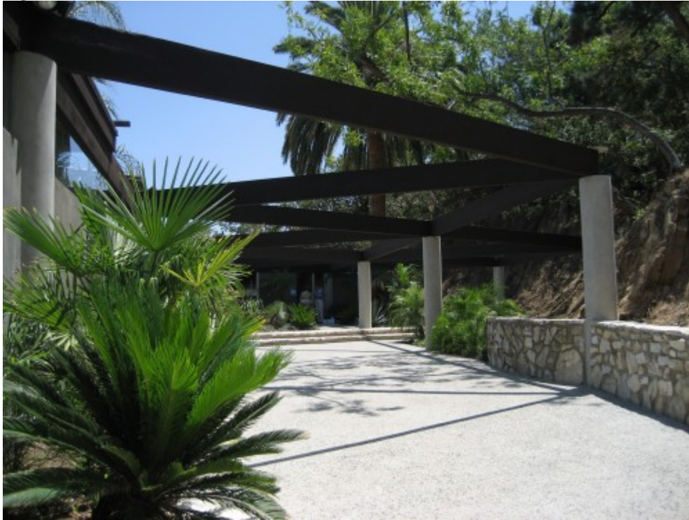
Detail of primary entrance, facing southeast (© The John Lautner Foundation, courtesy of Frank Escher, date of photograph unknown)