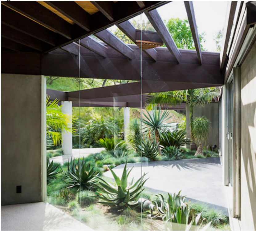
Detail of trellis (, date of photograph unknown)