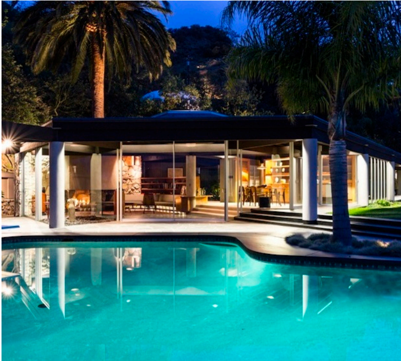
View of the swimming pool, west and north façade, facing southwest (© The John Lautner Foundation, courtesy of Frank Escher, date of photograph unknown)