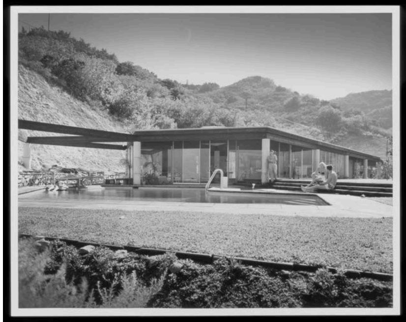
View of the swimming pool, west and north façade, facing southwest