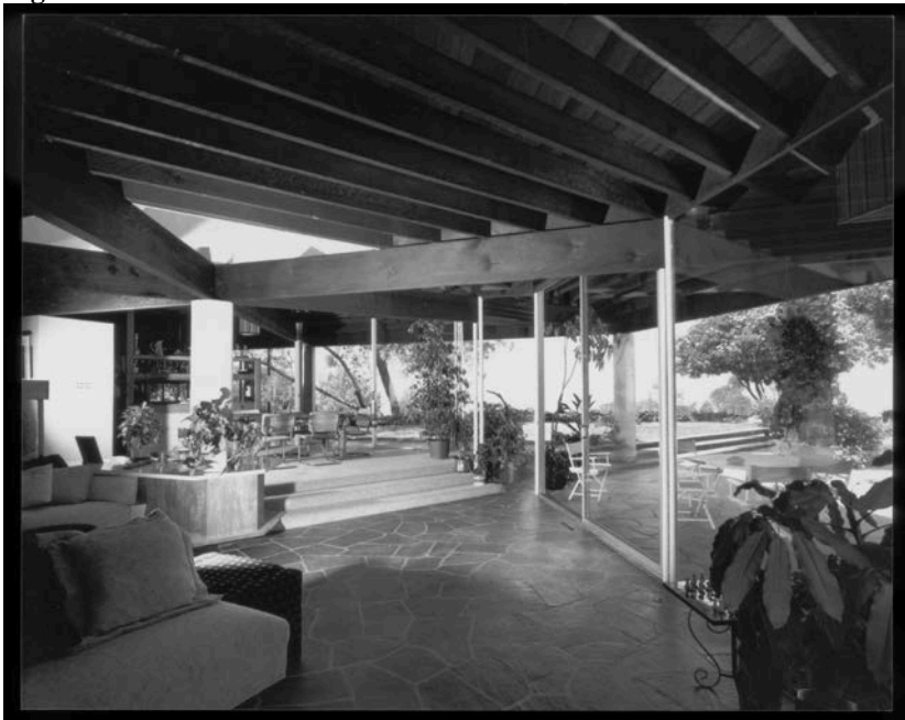
View of living room