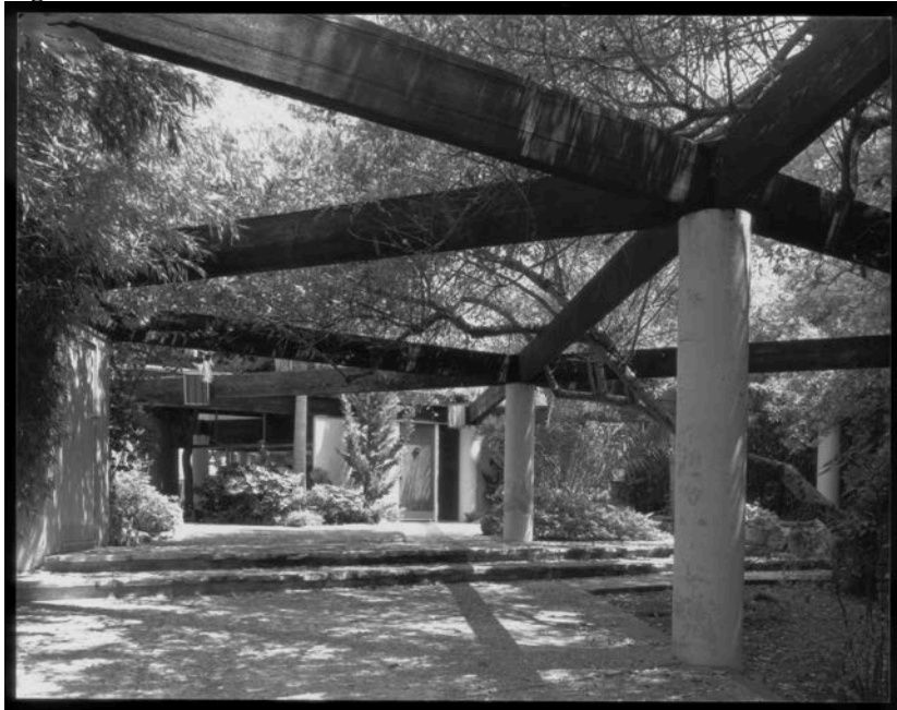
Detail of primary entrance, facing southeast