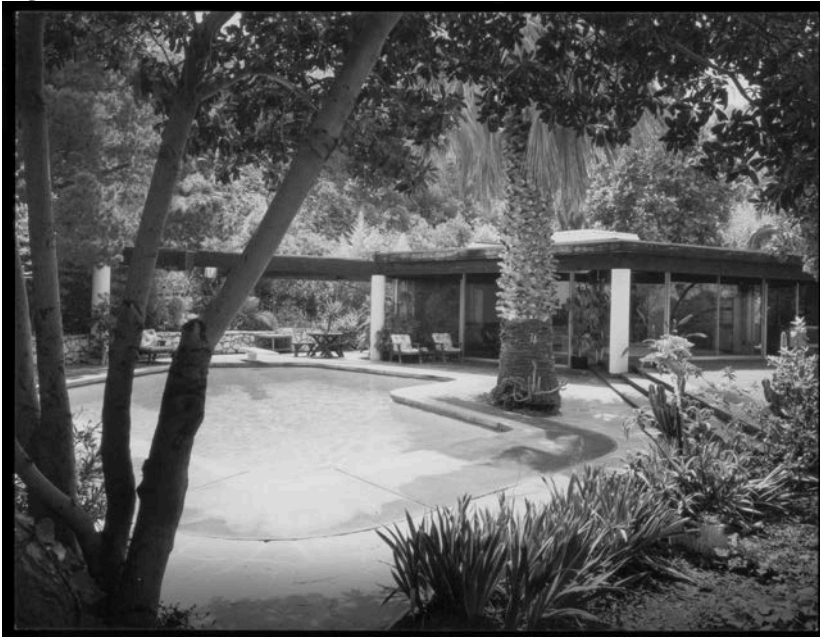
Overview of pool and west façade (Photo credit: Getty Research Institute – Julius Shulman, photographed in 1977)