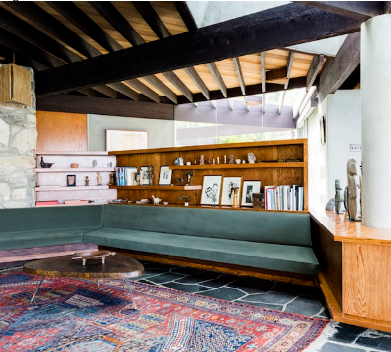
Detail of living room