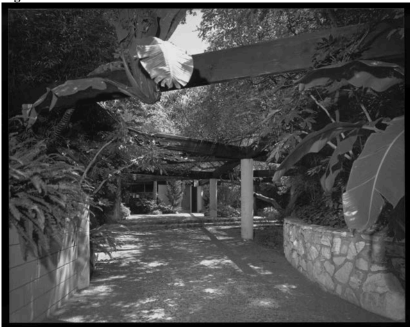
View of driveway and west façade, facing southeast