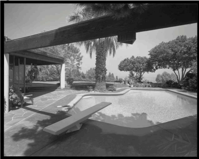
Overview of pool, facing north