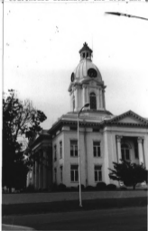
WORTH COUNTY COURTHOUSE

The courthouse's dome can be seen from some distance before one enters the small town of Sylvester. The courthouse dominates the area and gives a visual stability to the surroundings.