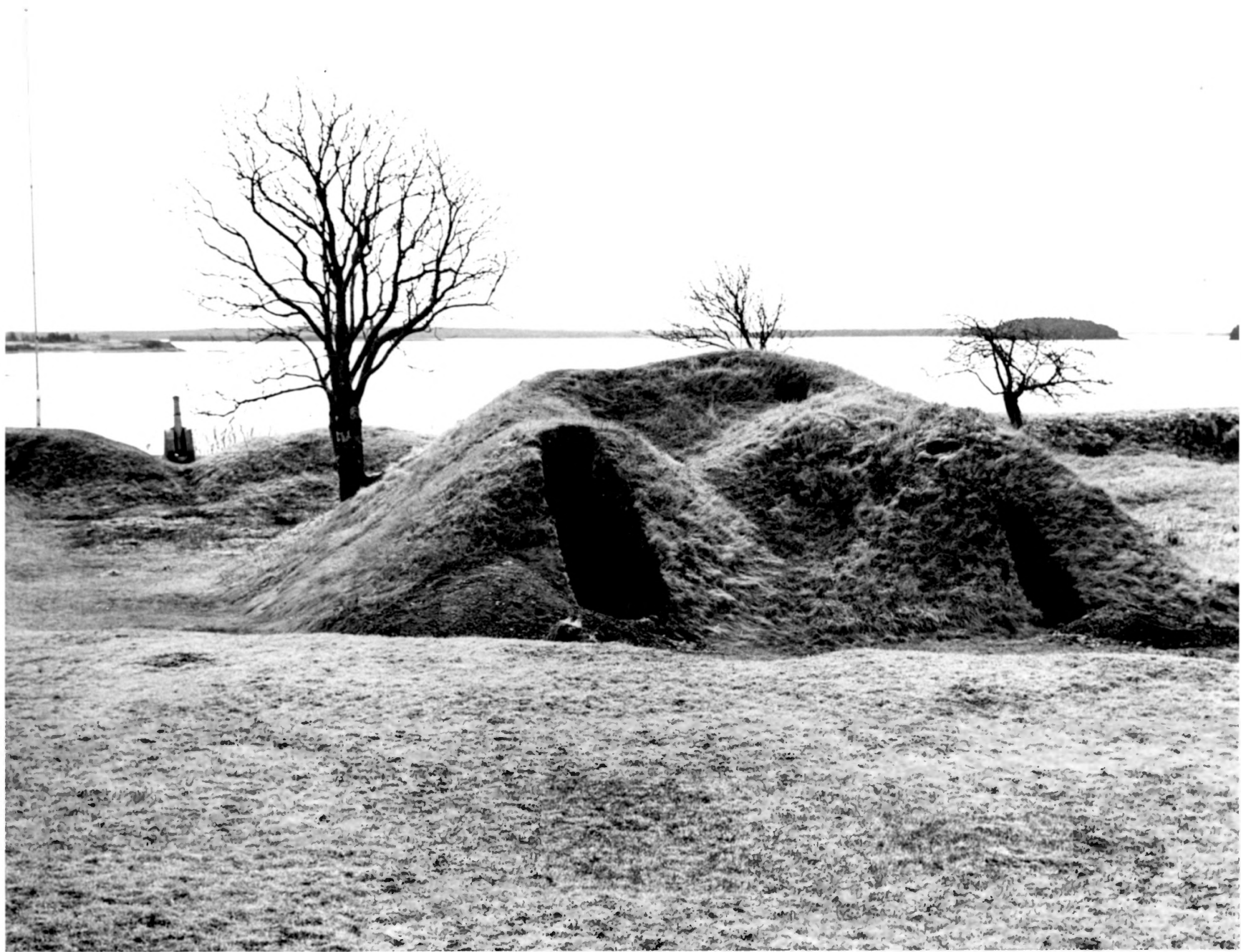
#1 Ft. O'Brien Machiasport, Me.