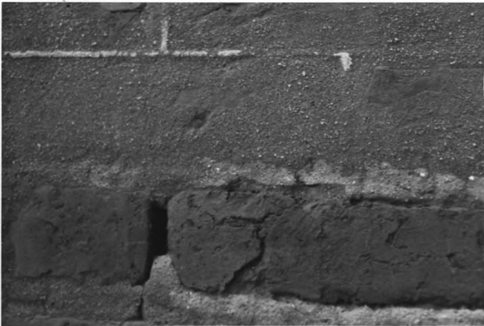
DETAIL - FINISH OVER EXTERIOR BRICK