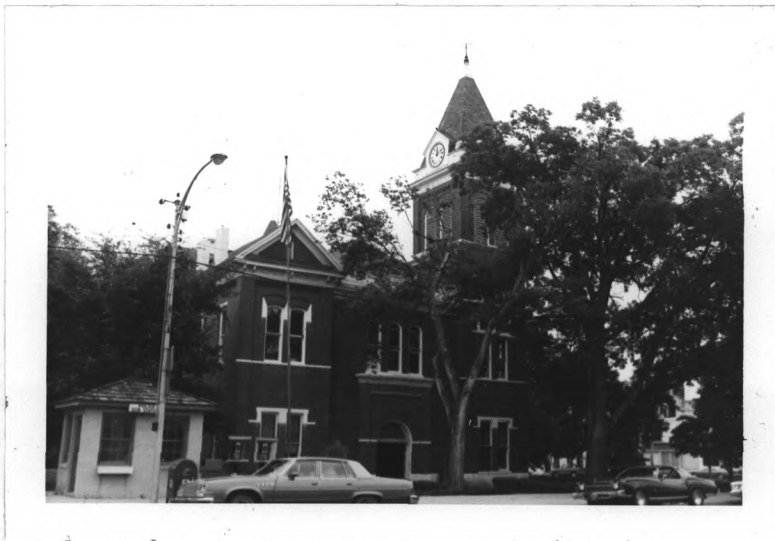
BURKE COUNTY COURTHOUSE

The cement-looking finish that is scored to look like perfect brick is on the 1857 and 1900 portions of the building. This is not found on any other Georgia courthouse, but is on the Hay House in Macon, Georgia (A National Historic Landmark).