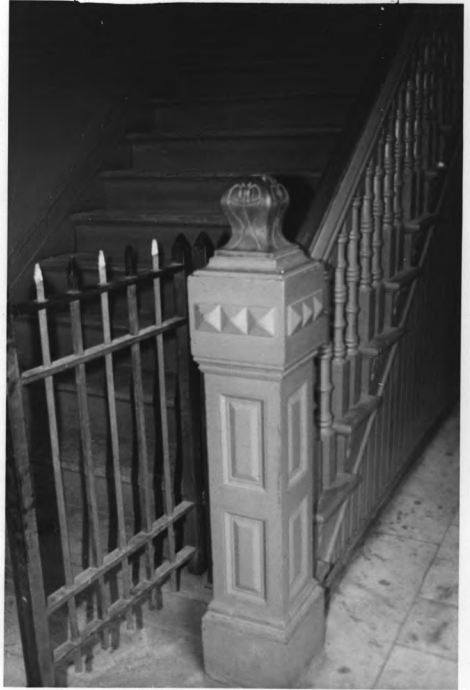
DETAIL - NEWEL POST