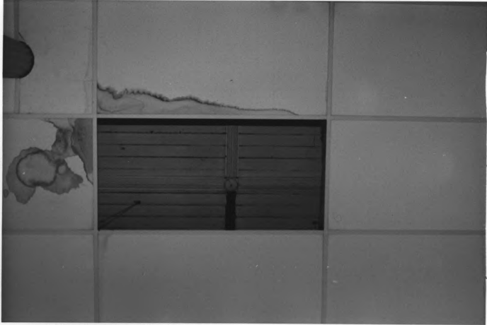
VIEW OF ORIGINAL CEILING